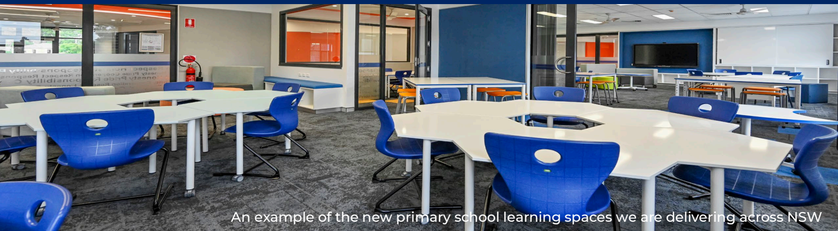
An example of the new primary school learning spaces we are delivering across NSW