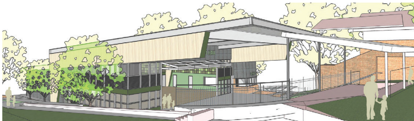
Hall with attached covered outdoor learning area (COLA)