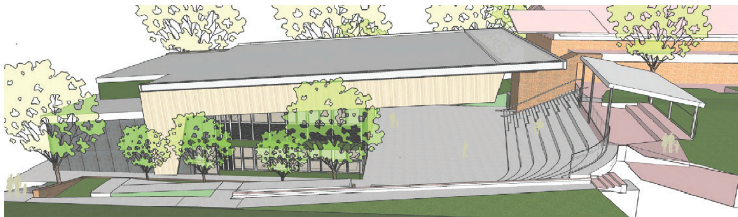
Tiers for increased audience