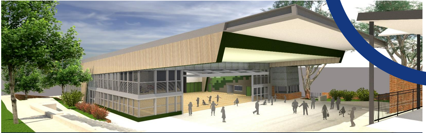
Artist impression of the new hall. Indicative only