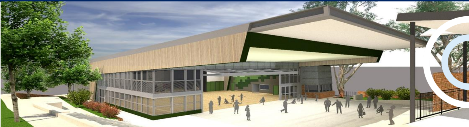
Artist impression of the new hall. Indicative only