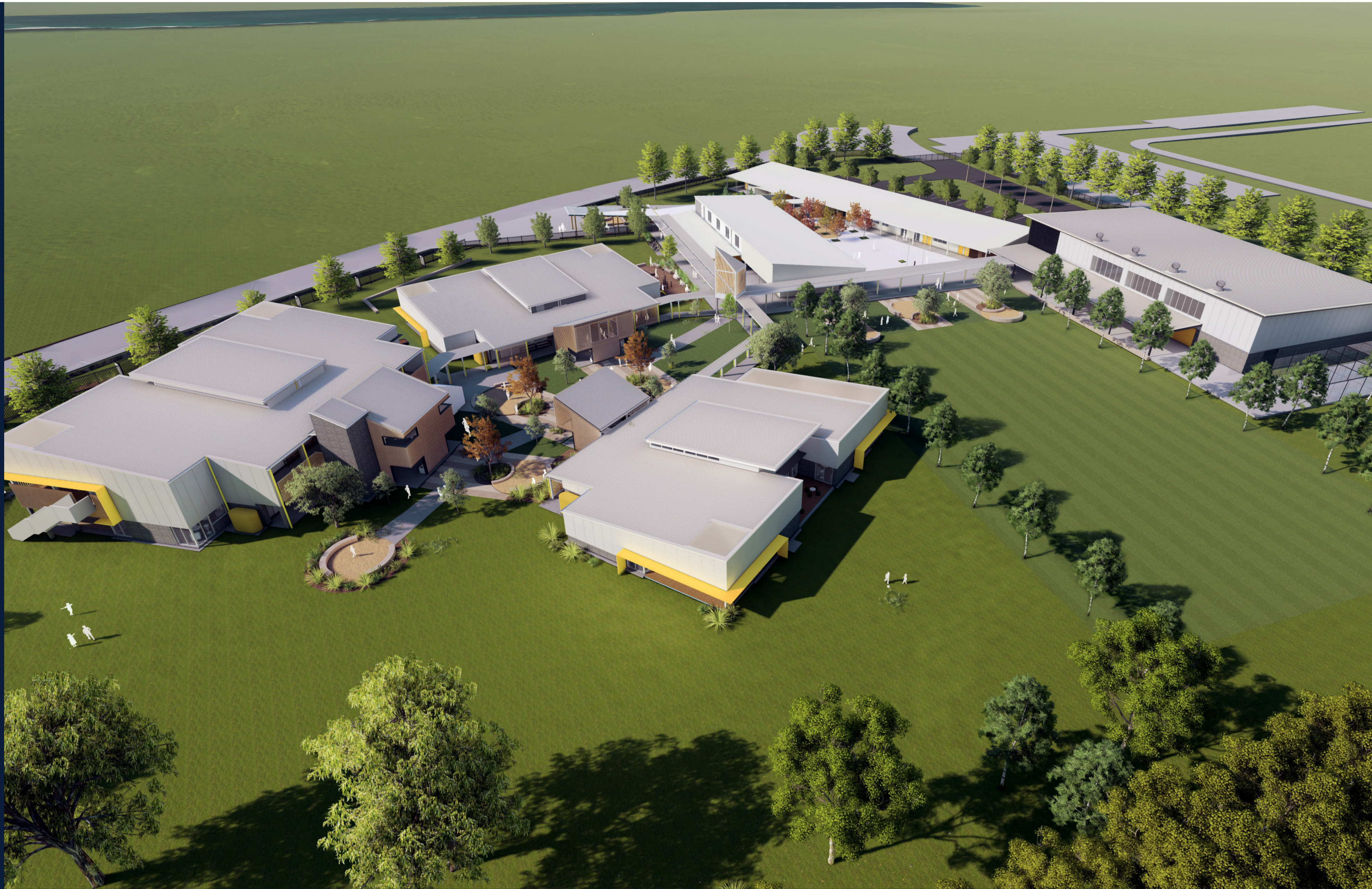
Artist impression of Lake Cathie Public School