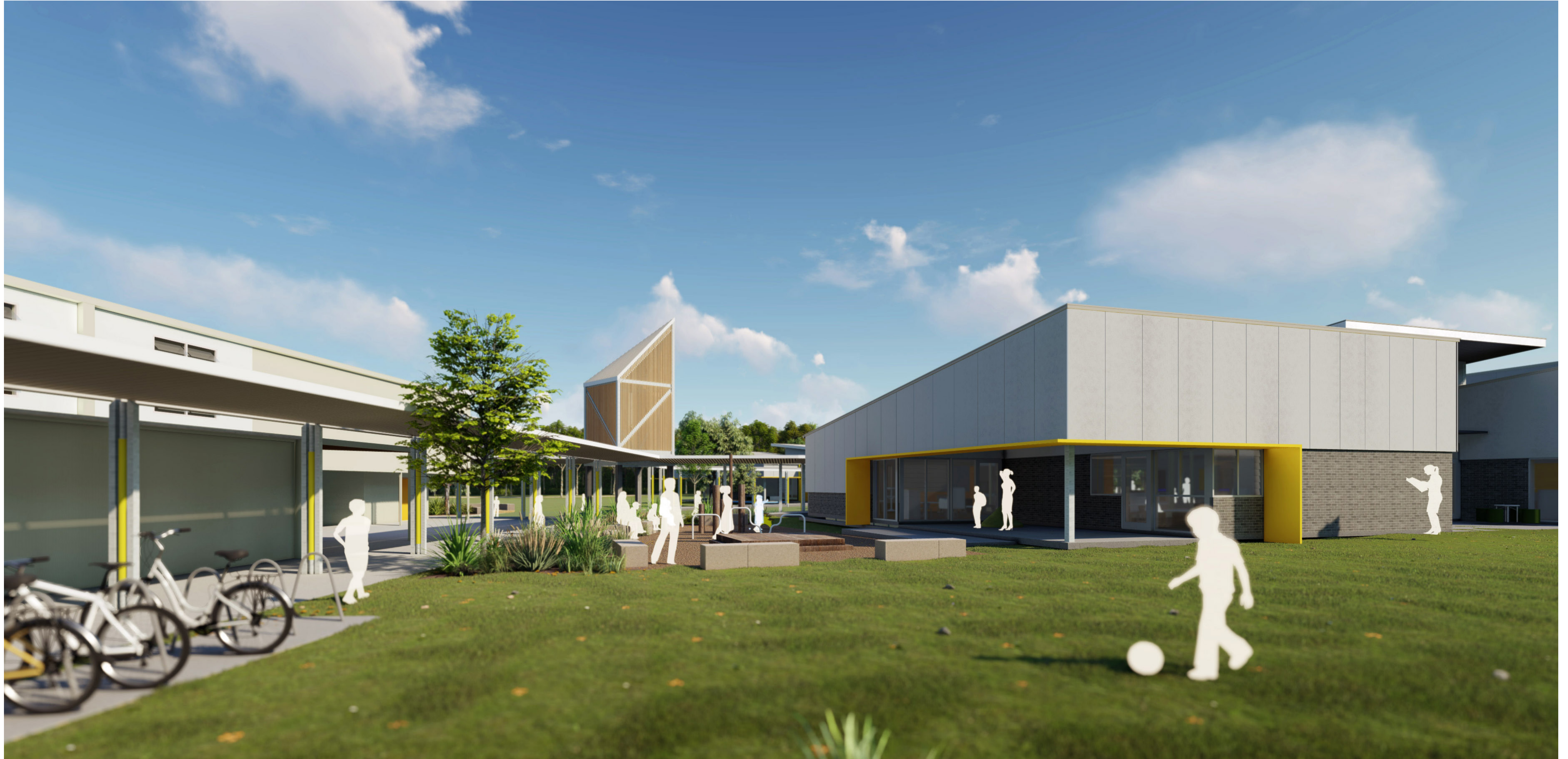
Artist impression of Lake Cathie Public School