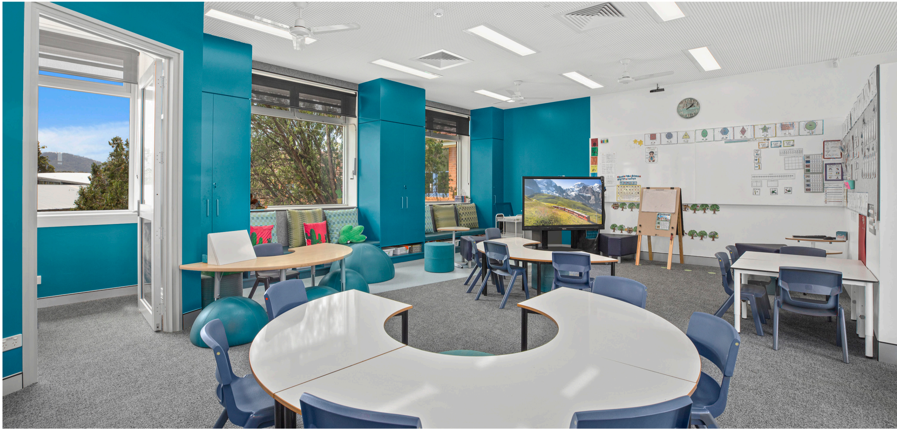
Examples of innovative learning spaces