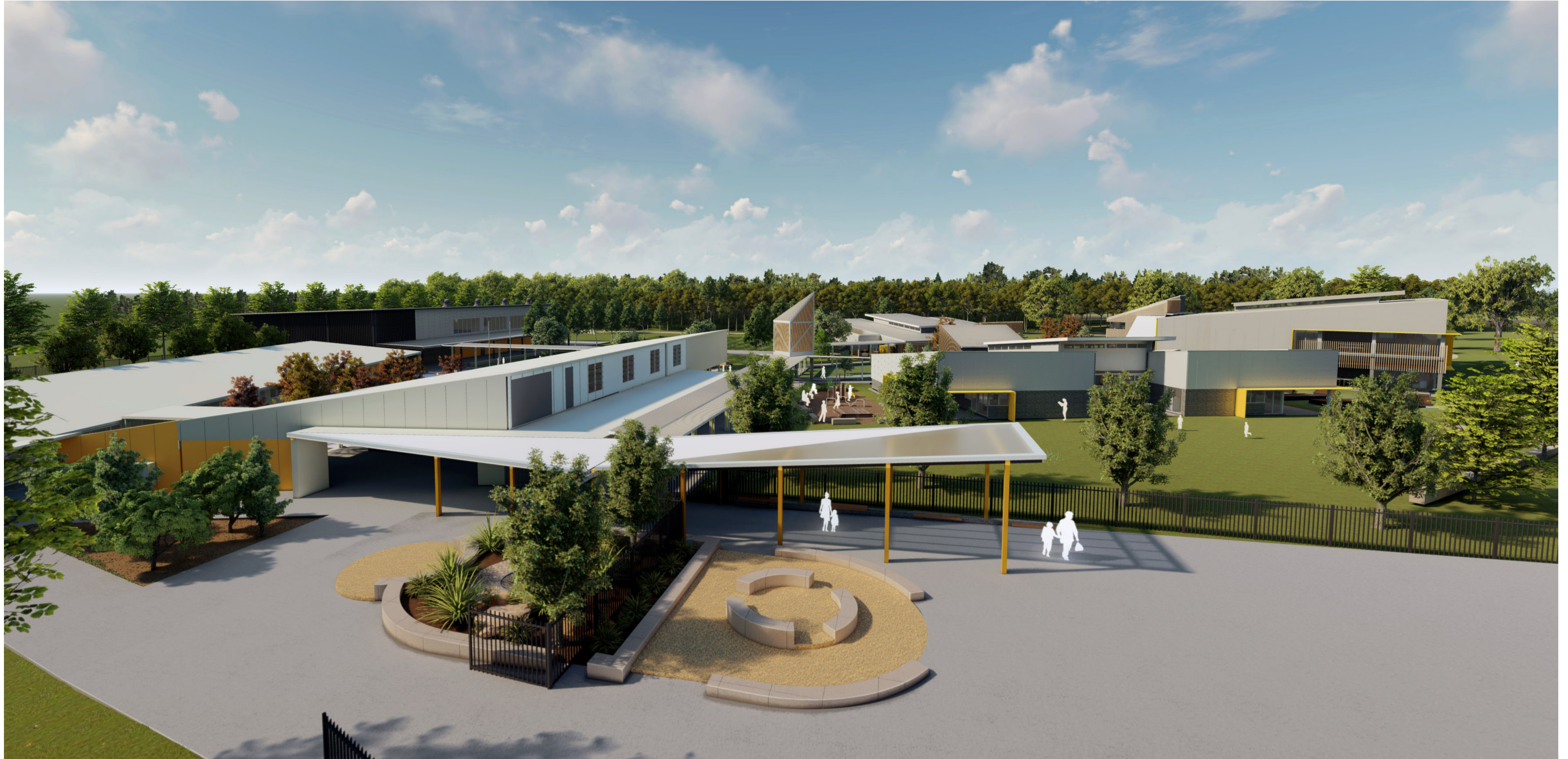
Artist impression of Lake Cathie Public School