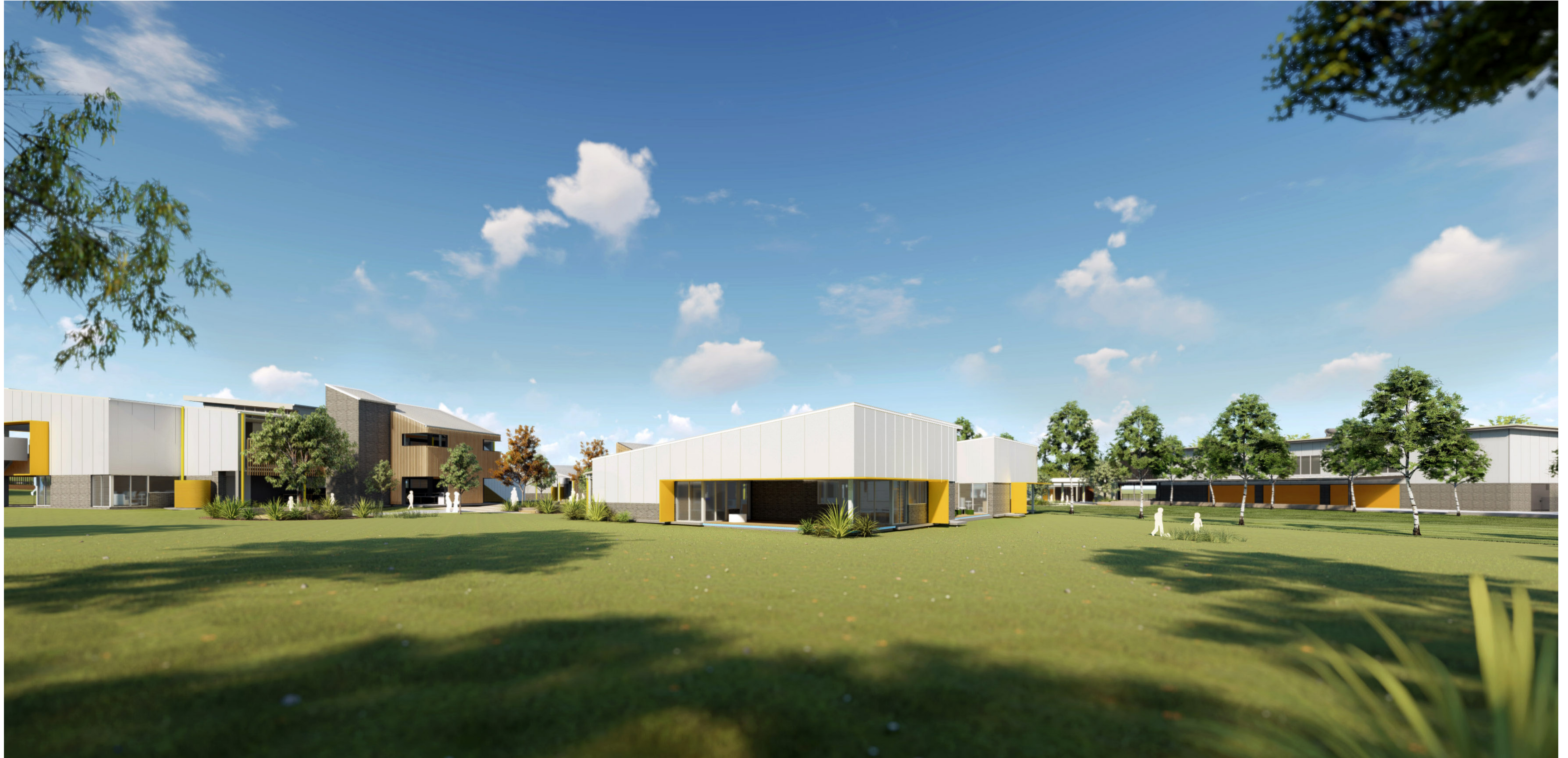
Artist impression of Lake Cathie Public School