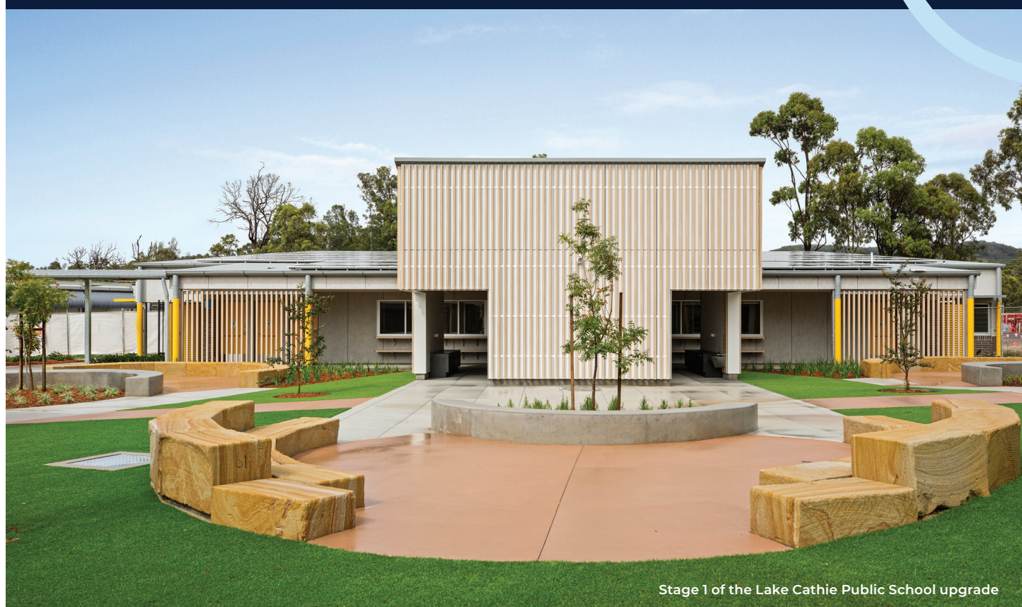
Stage 1 of the Lake Cathie Public School upgrade