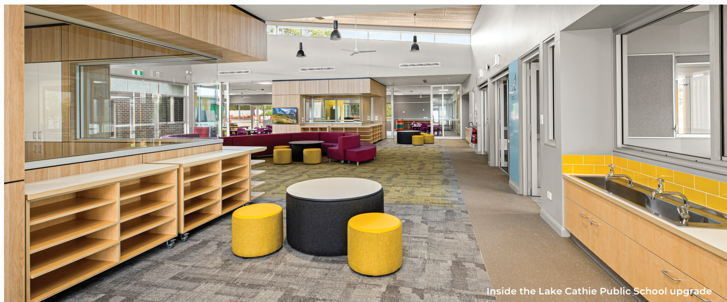
Inside the Lake Cathie Public School upgrade