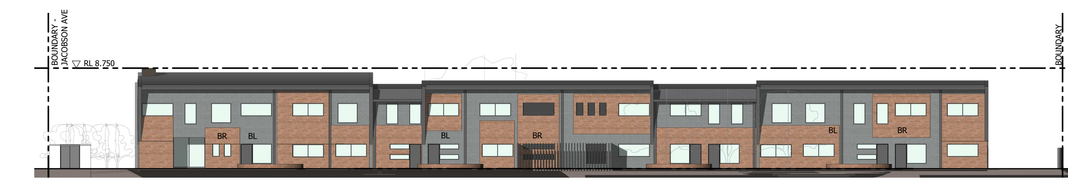
4 EAST ELEVATION 1 : 200