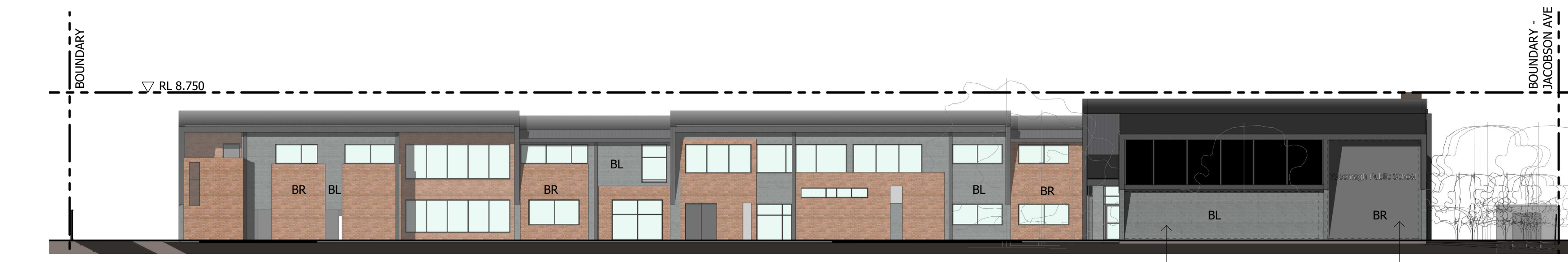
2 WEST ELEVATION - BEEHAG ST 1 : 200