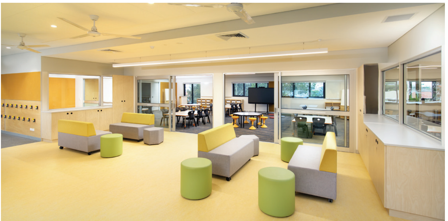
New flexible learning space