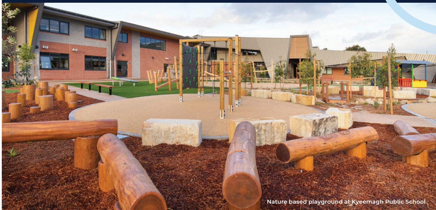
Nature based playground at Kyeemagh Public School