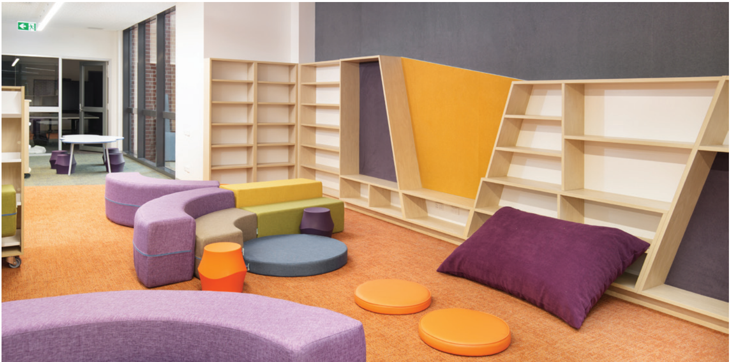
New library space