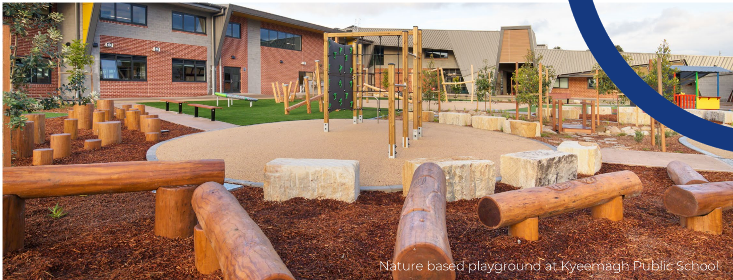
Nature based playground at Kyeemagh Public School