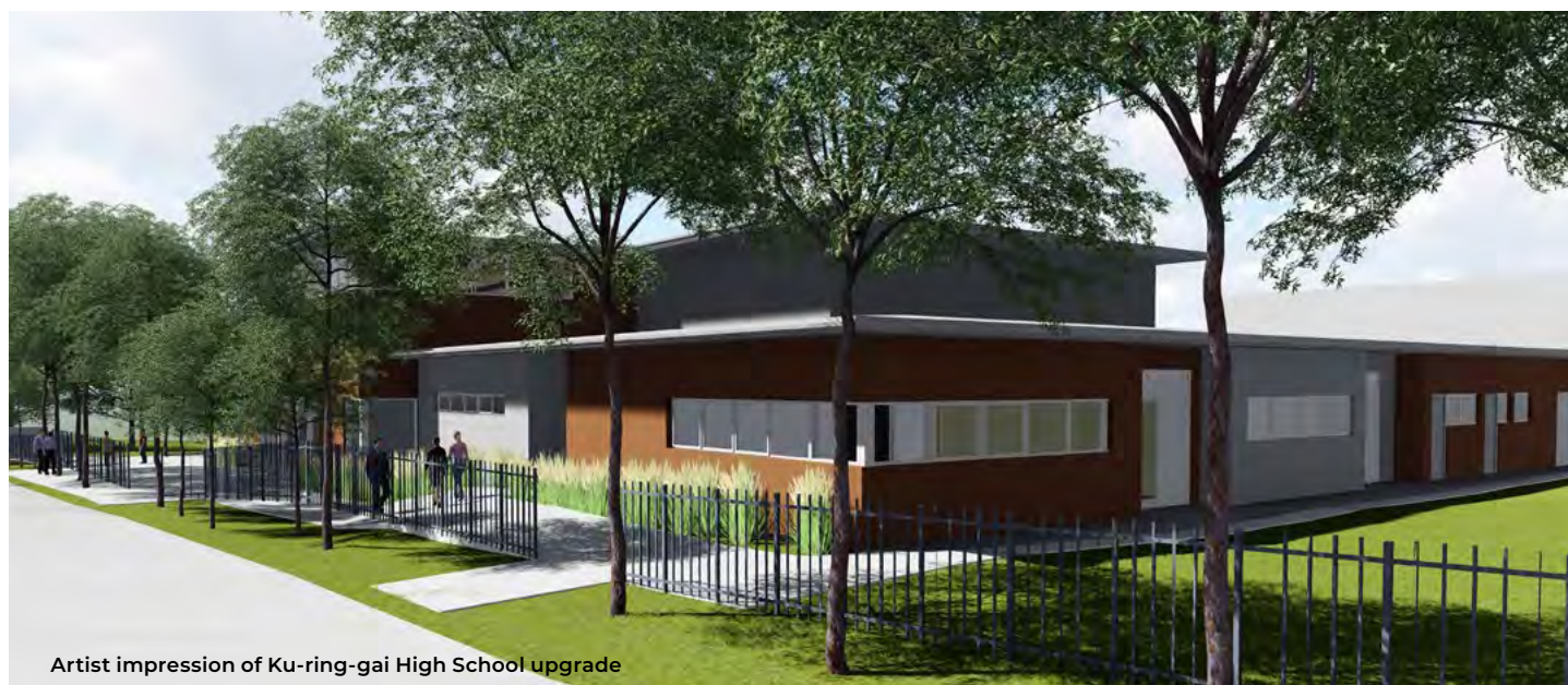
Artist impression of Ku-ring-gai High School upgrade