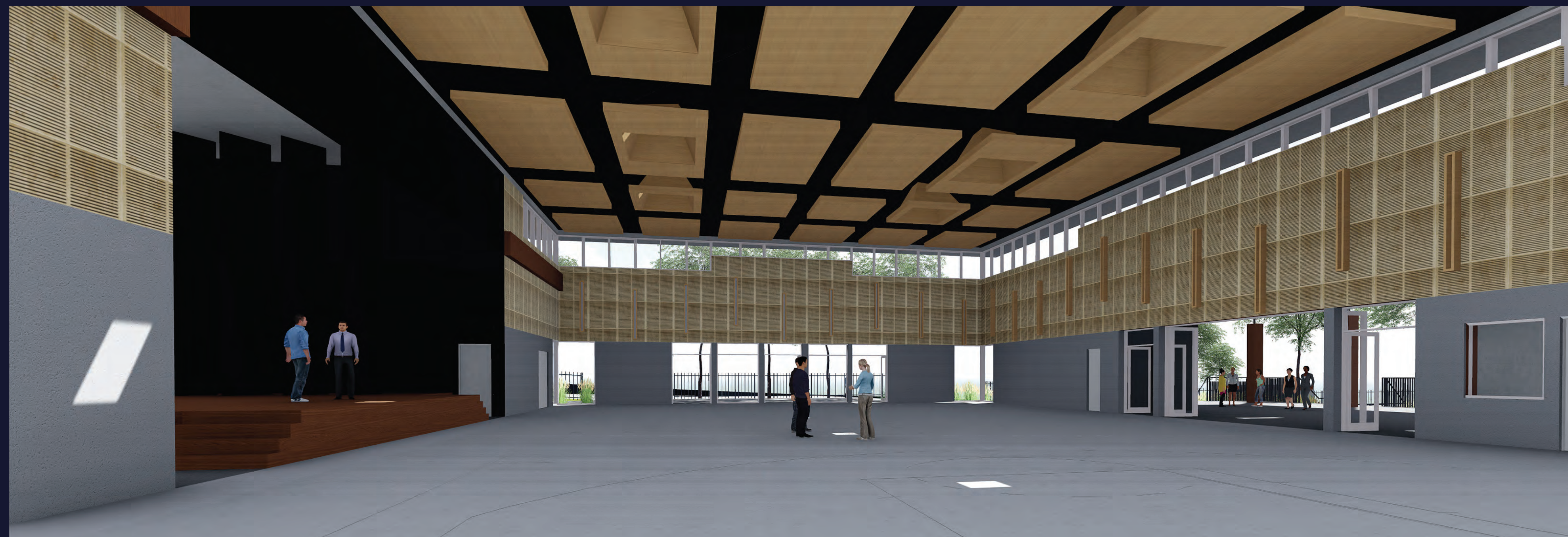
Artist render Ku-ring-gai High School hall interior.