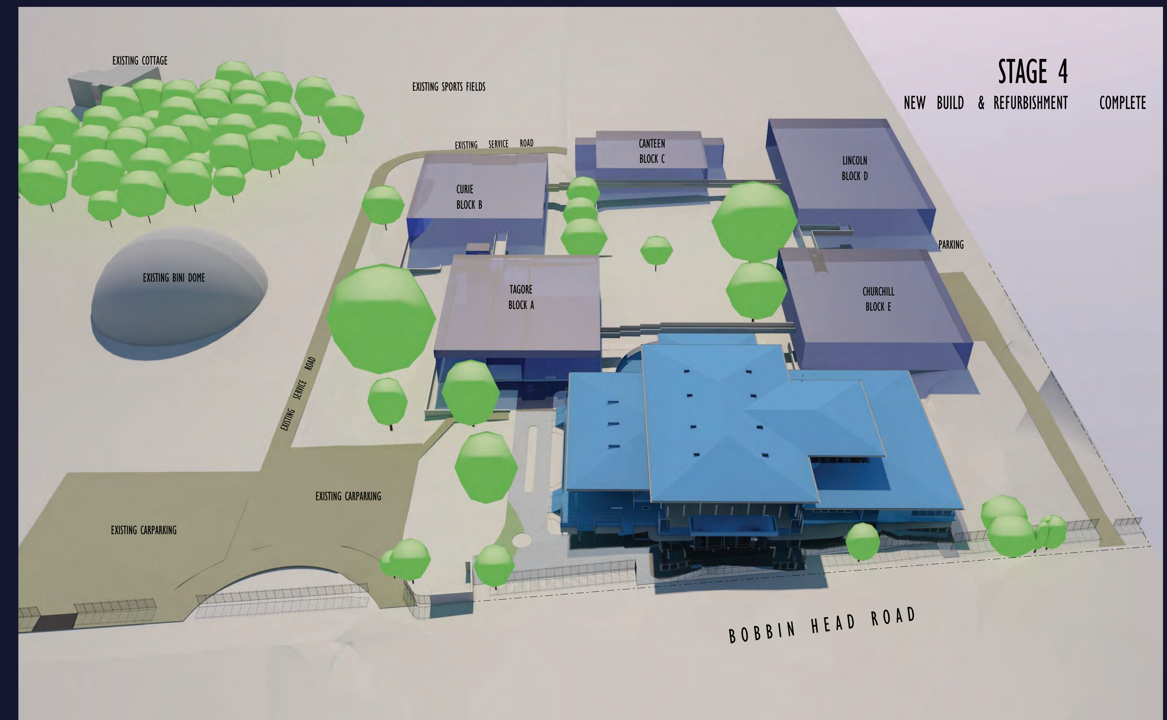
New build and refurbishments to some spaces within blocks A, B, D, E. Artist render.