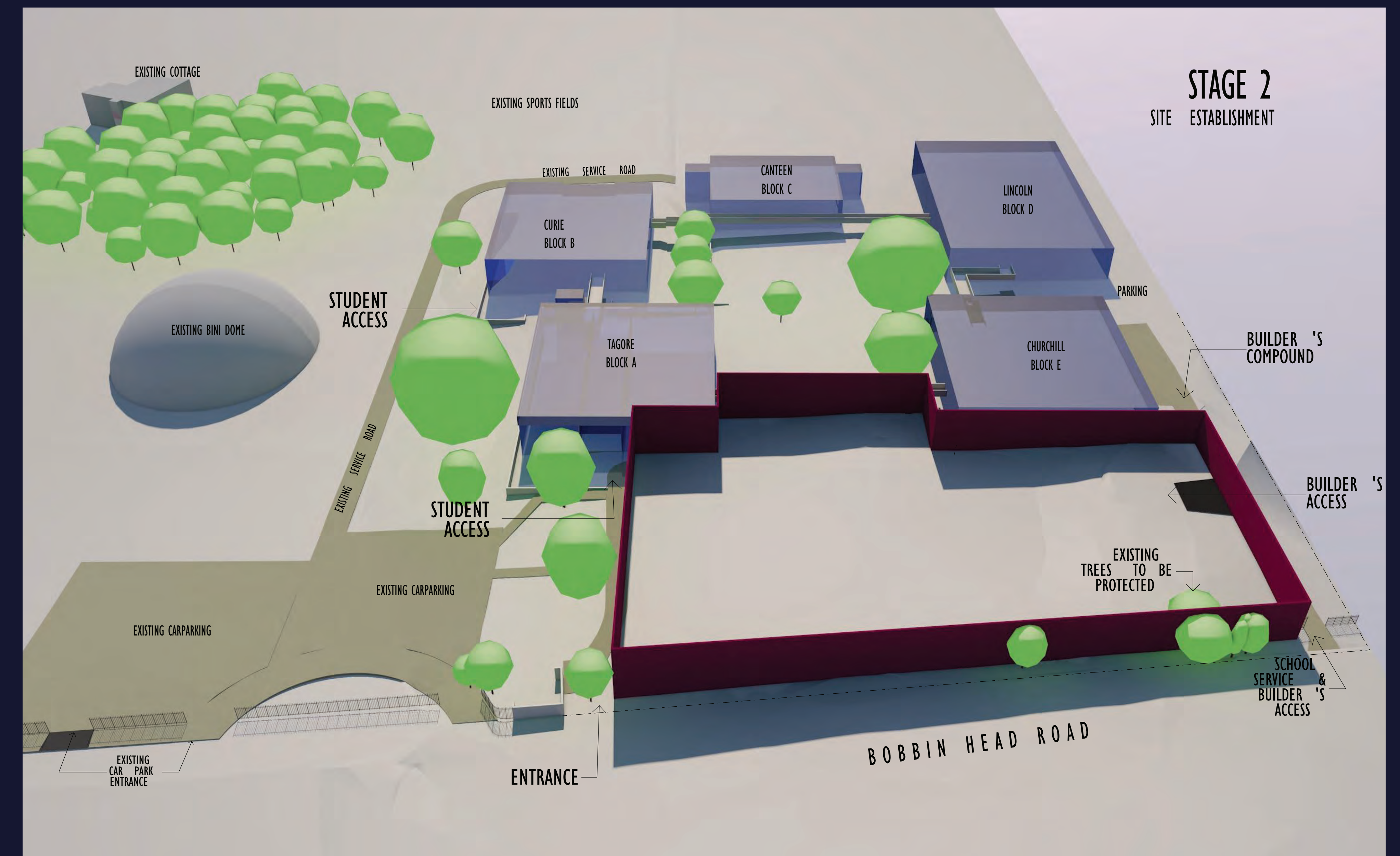
Staging plans for Ku-ring-gai High School hall. Artist render.