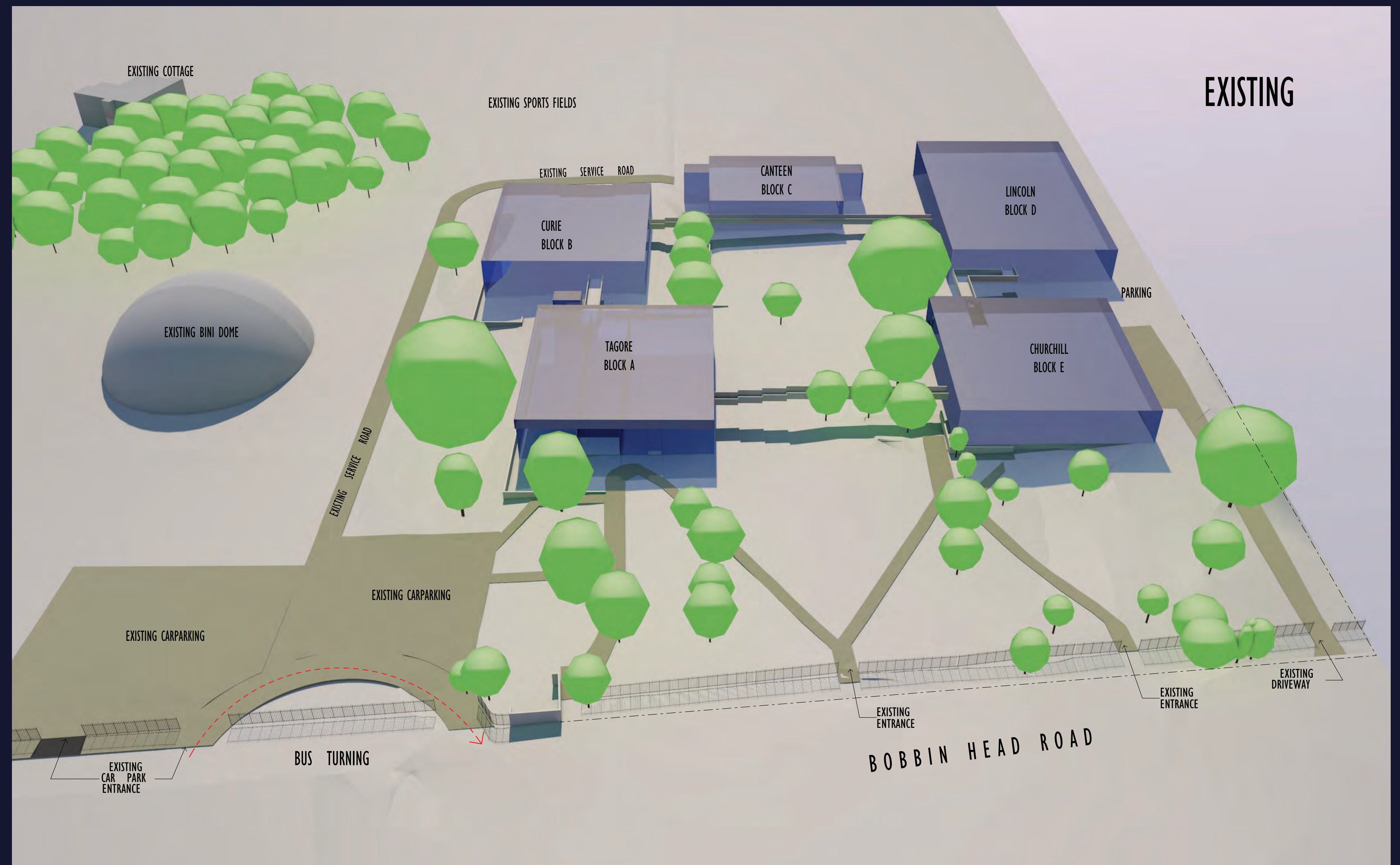
Staging plans for Ku-ring-gai High School hall. Artist render.

Construction of the new facilities is due to start in early 2019 and is expected to be completed by mid 2020.