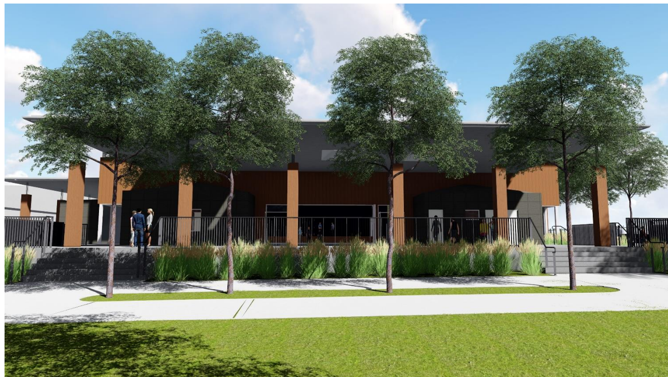
Artists render of the new Ku-ring-gai High School Multi-Purpose Hall.

School Infrastructure NSW will continue to work closely with the school community by sharing regular updates as the project progresses.