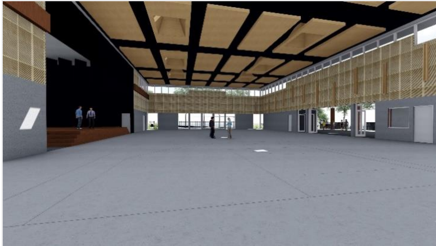
Artist render Ku-ring-gai High School hall interior