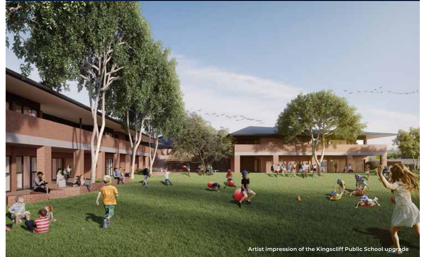
Artist impression of the Kingscliff Public School upgrade

The NSW Government is investing $6.7 billion over four years to deliver more than 190 new and upgraded schools to support communities across NSW. In addition, a record $1.3 billion is being spent on school maintenance over five years. This is the largest investment in public education infrastructure in the history of NSW.