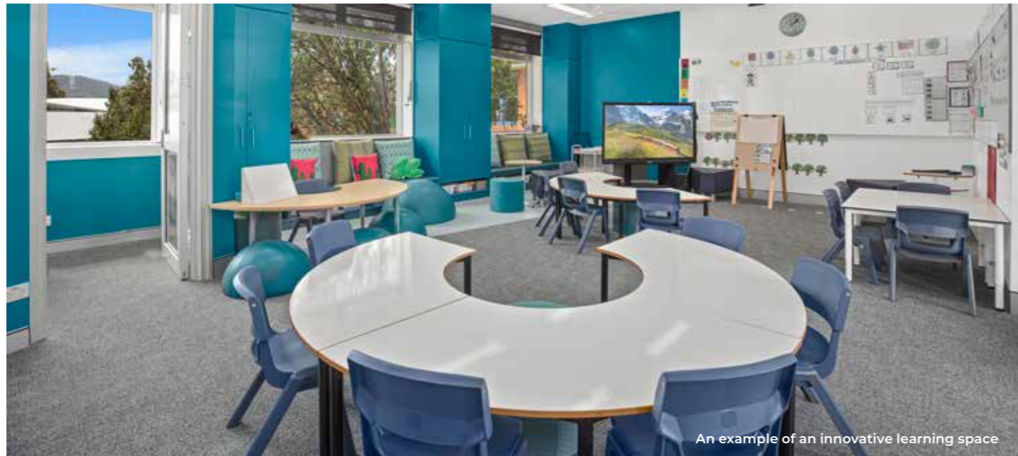
An example of an innovative learning space

All existing classrooms, including demountables, will be demolished and 32 new innovative and flexible learning spaces will be built to facilitate a range of learning modes and activities.