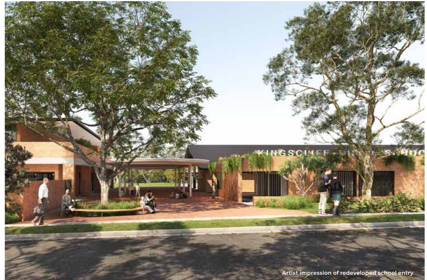
Artist impression of redeveloped school entry