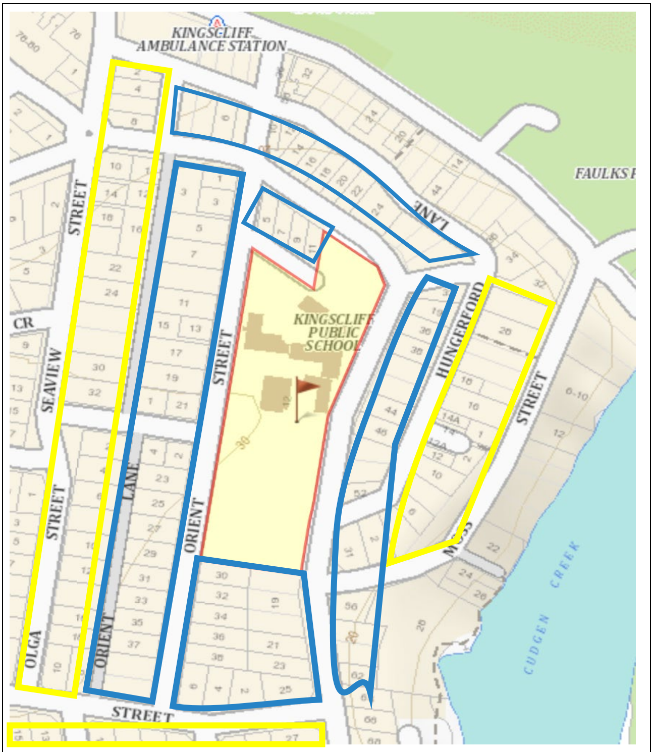
Map 1 – Distribution areas for letterbox drops