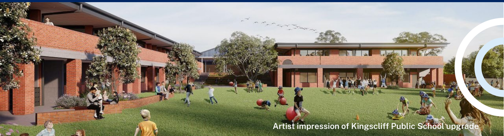
Artist impression of Kingscliff Public School upgrade