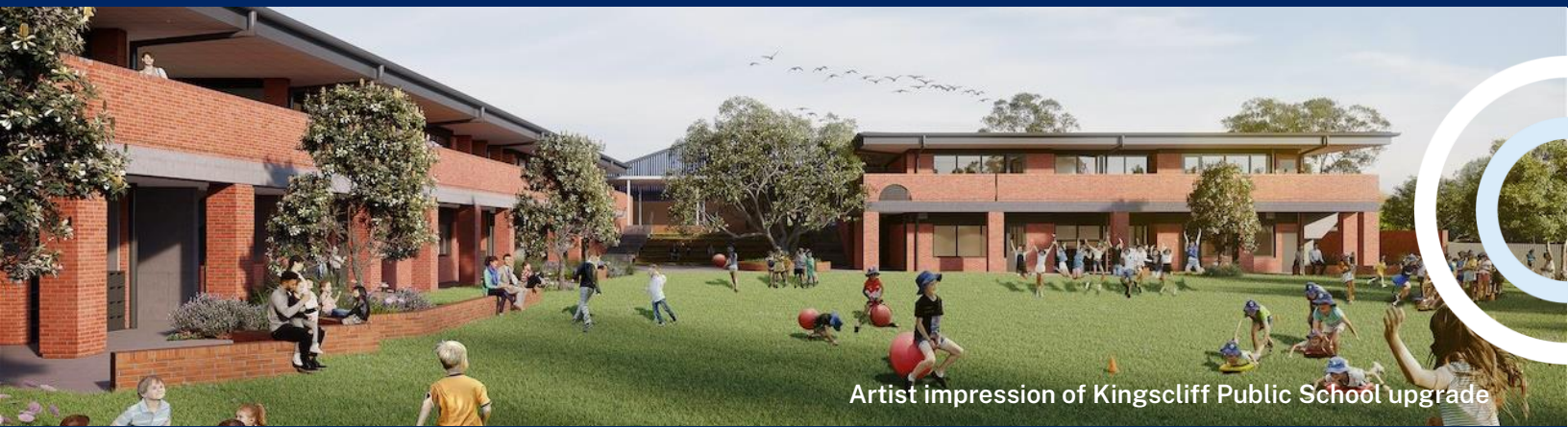
Artist impression of Kingscliff Public School upgrade