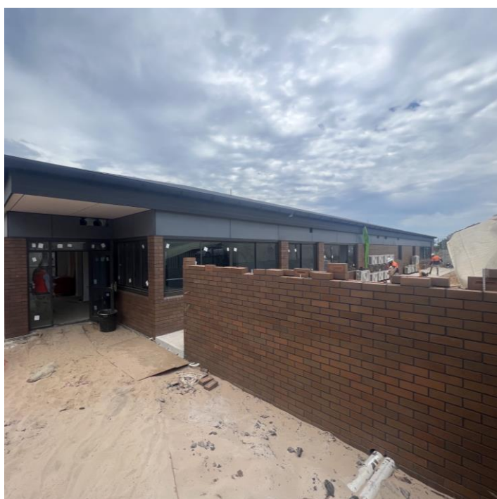
Exterior of Building 2

The façade and external glazing of Building 2, the new administration building, is now complete, and internal fit out and landscaping have commenced. Community consultation to incorporate Aboriginal design into the project is progressing.