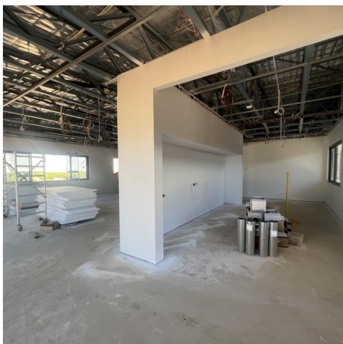
Interior of Building 2