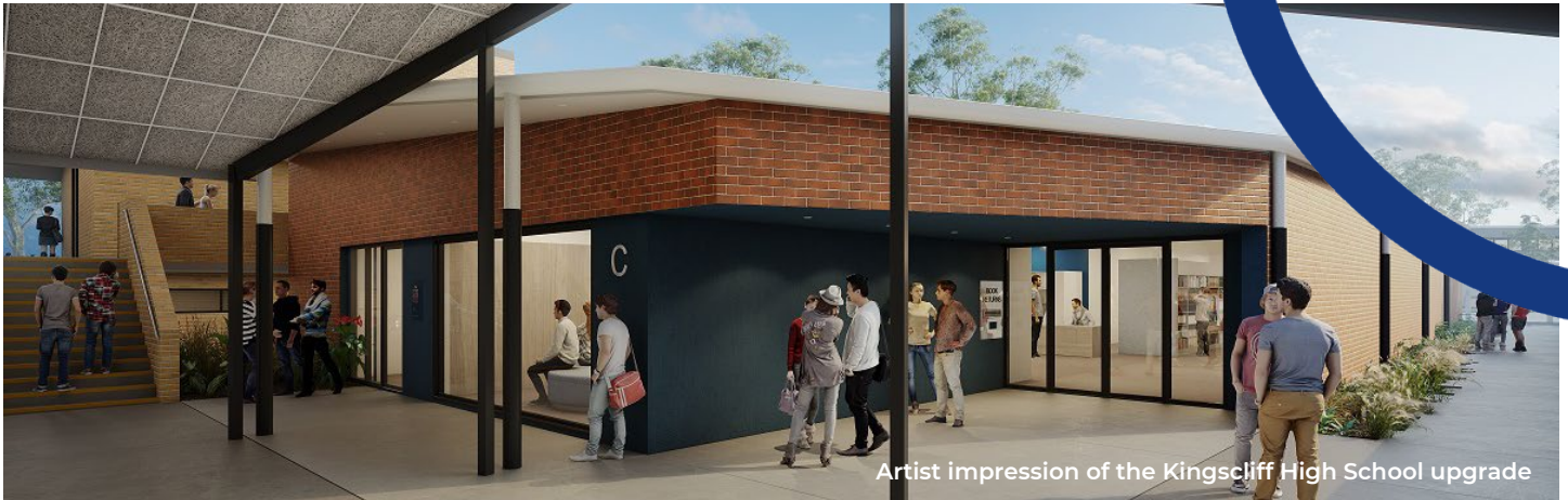
Artist impression of the Kingscliff High School upgrade