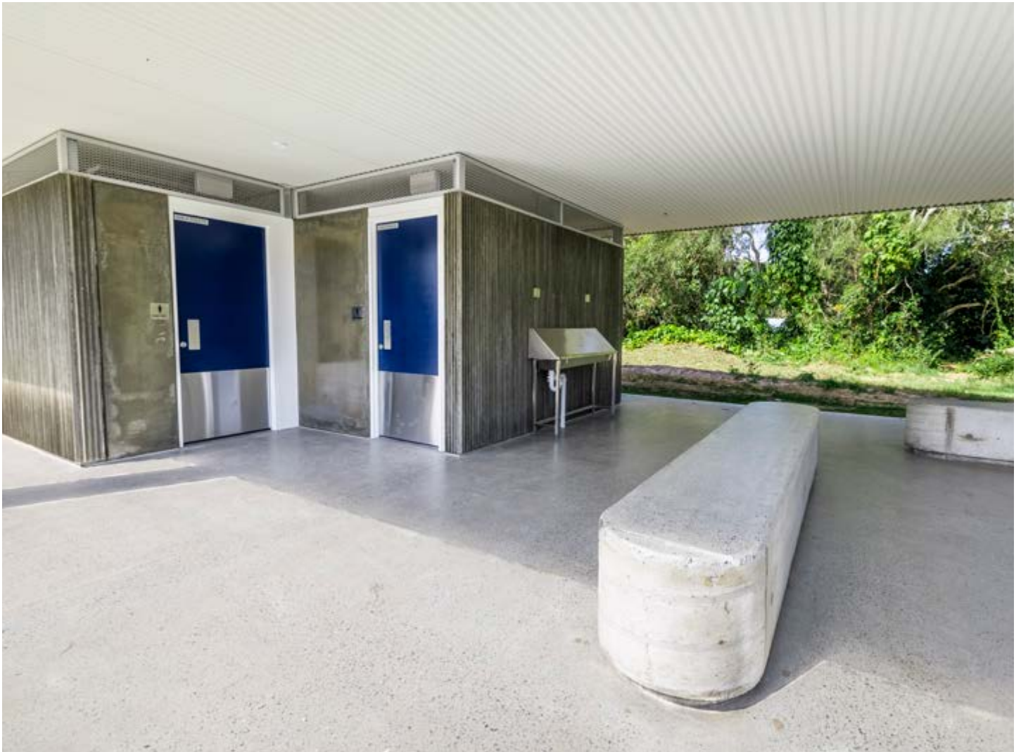
Outdoor learning area at the new sports pavilion

We are also conducting a Review of Environmental Factors (REF) which will enable us to progress the construction of the library while the SSDA is being assessed.