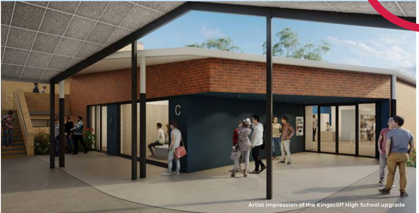
Artist impression of the Kingscliff High School upgrade

The NSW Government is investing $7 billion over the next four years, continuing its program to deliver more than 200 new and upgraded schools to support communities across NSW. This is the largest investment in public education infrastructure in the history of NSW.