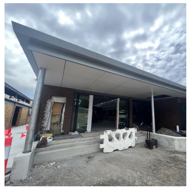
Facade of the new library

The library façade and external glazing is complete and internal fit out is progressing. Work has progressed on the Covered Outdoor Learning Area (COLA). Community consultation to incorporate Aboriginal design into the project is progressing.