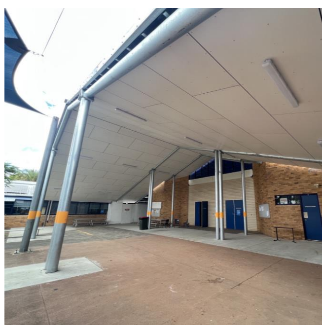
Covered Outdoor Learning Area (COLA)

School Infrastructure NSW Email: <u>schoolinfrastructure@det.nsw.edu.au</u> Phone: 1300 482 651 www.schoolinfrastructure.nsw.gov.au