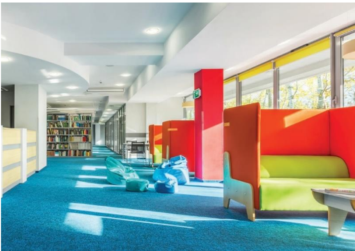
These images are an example of innovative learning spaces we are building for students across NSW.