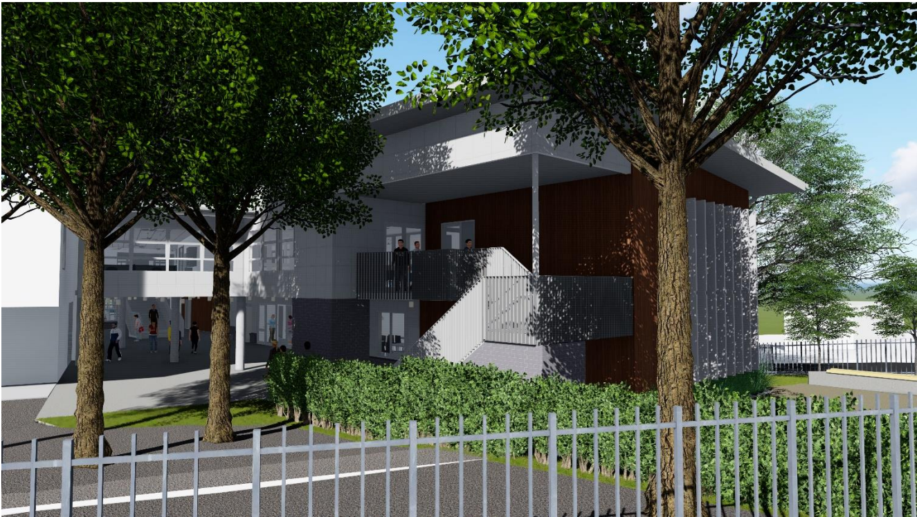
Artist render of Killara High School

School Infrastructure NSW will continue to work closely with the school community by sharing regular updates as the project progresses.