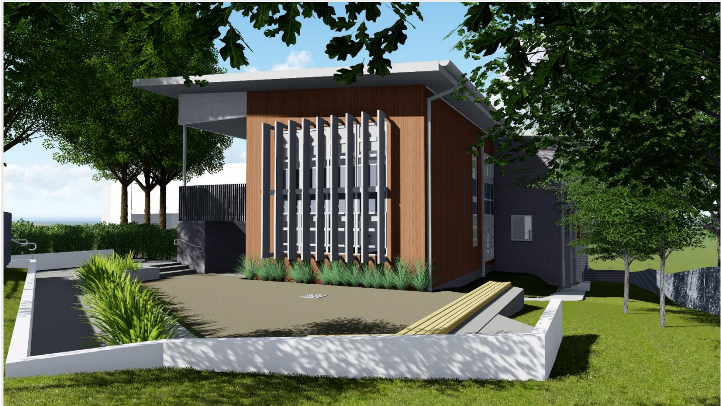
Artist render of Killara High School