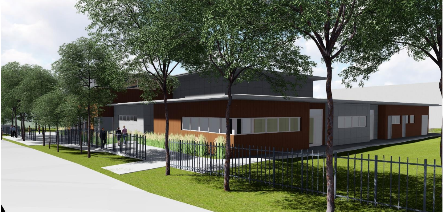
Artist render of Killara High School

A project is underway for Killara High School. The project will deliver new permanent teaching spaces, specialist spaces, and upgrades to some of the school’s existing core facilities.