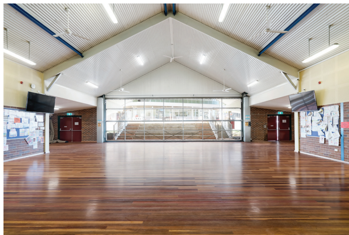
Learning spaces and facilities at Kent Road Public School