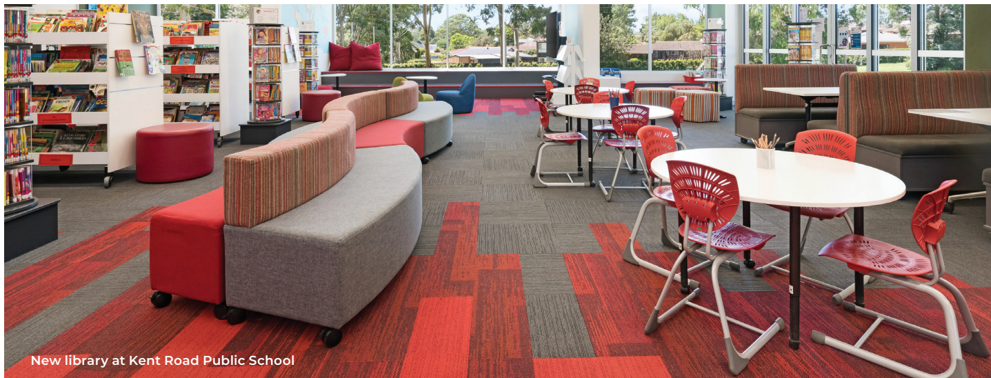
New library at Kent Road Public School