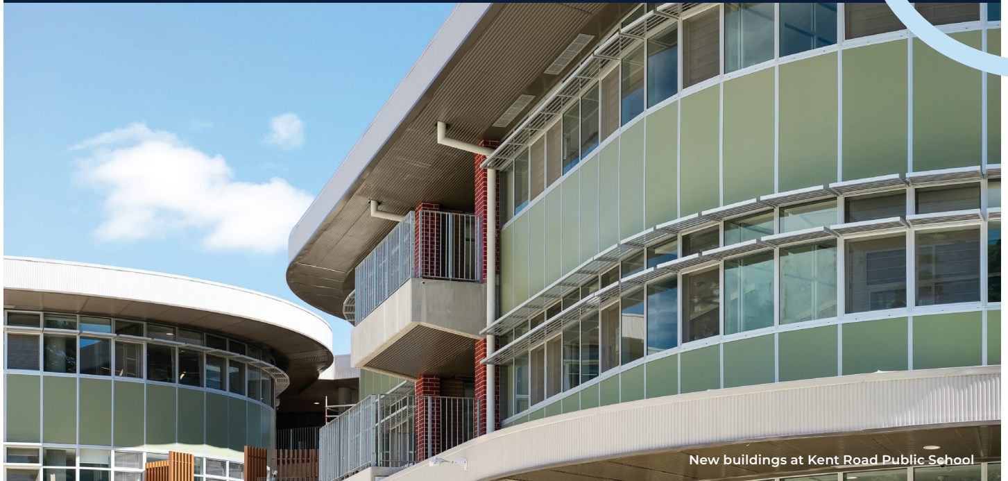
New buildings at Kent Road Public School