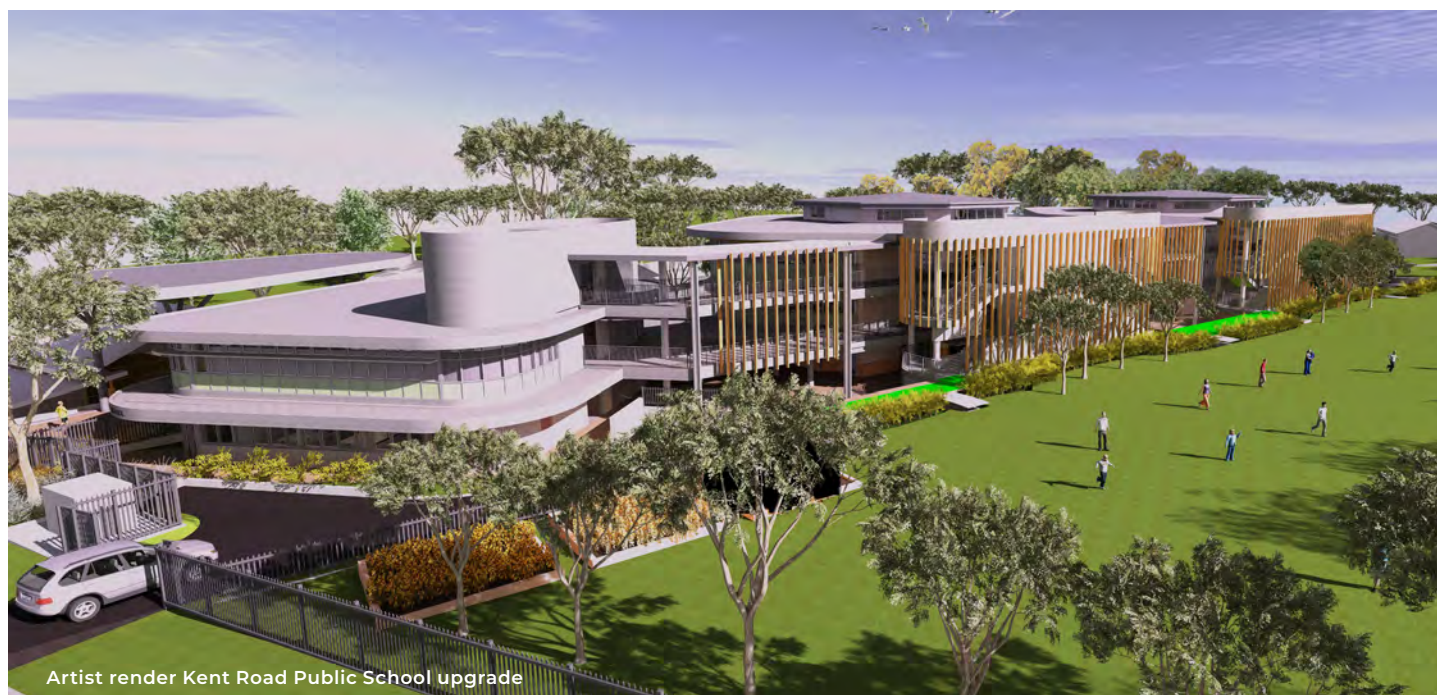
Artist render Kent Road Public School upgrade