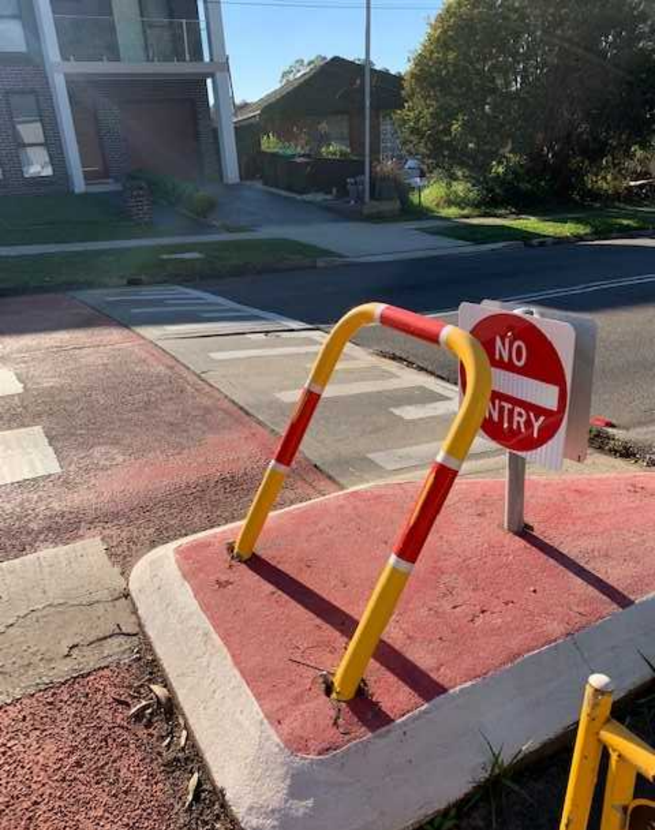
40. General Condition of existing pedestrian crossing Barriers have been bent