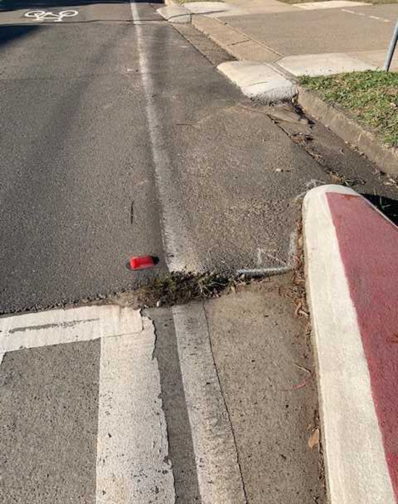
40. General Condition of existing pedestrian crossing Multiple cracks 1-10mm. Ramp sunken approx 50mm