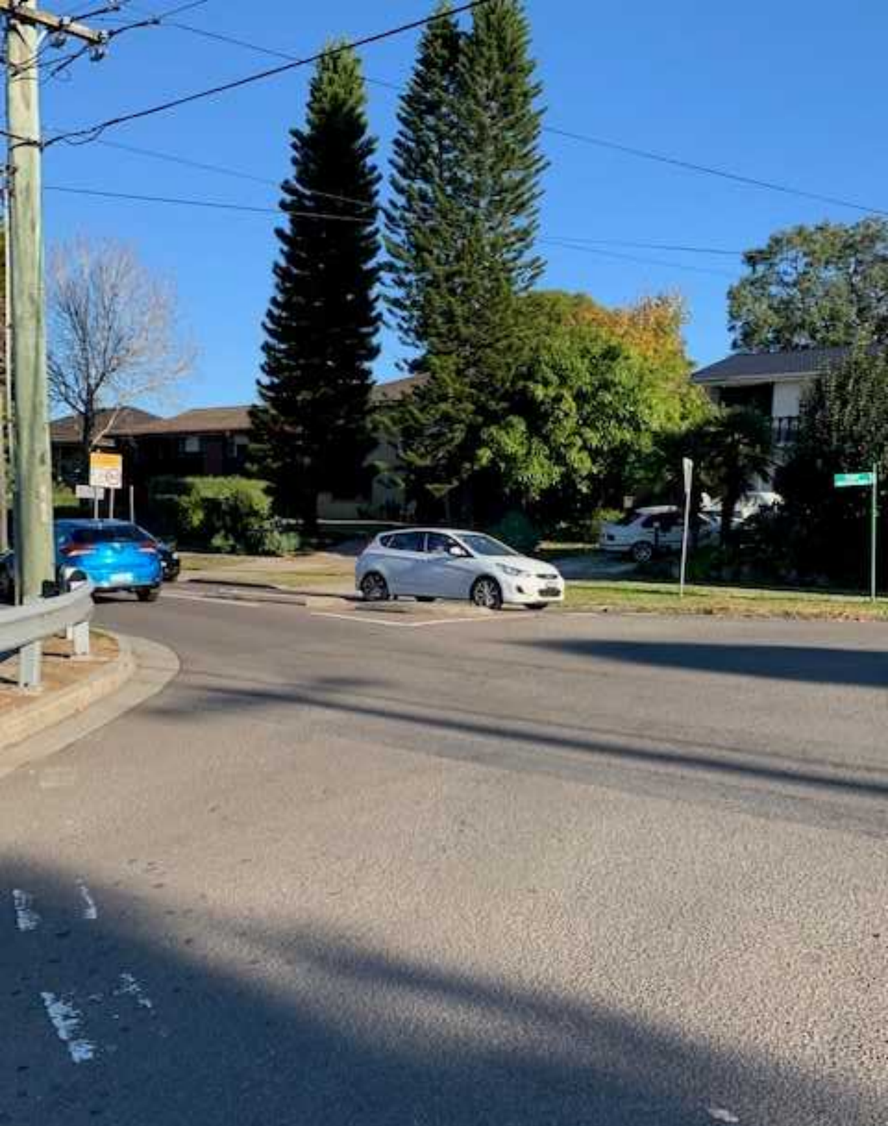
32. General Conditions of round about. Generally ok. Minor wear and tear