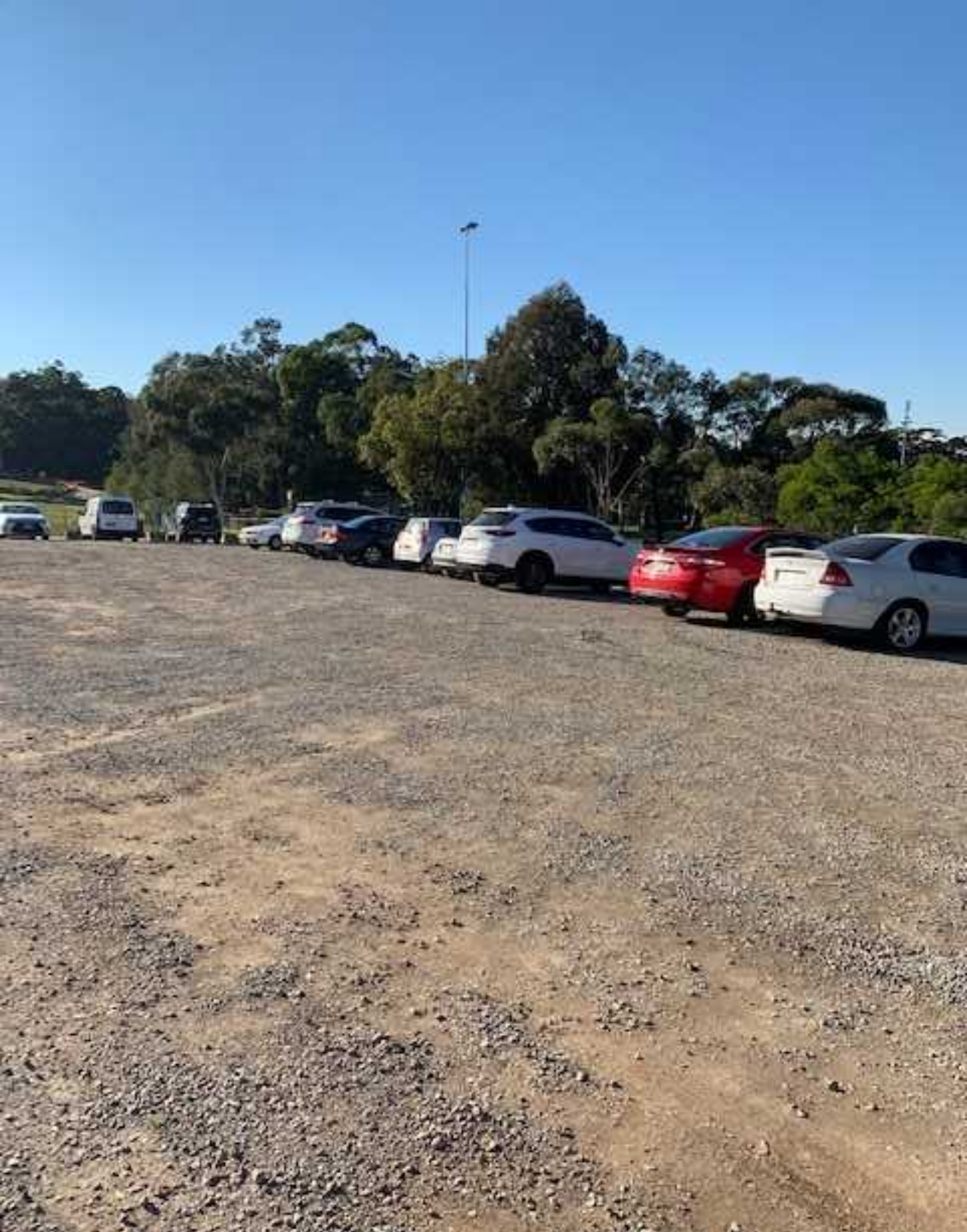
39. General Conditions of proposed construction parking area