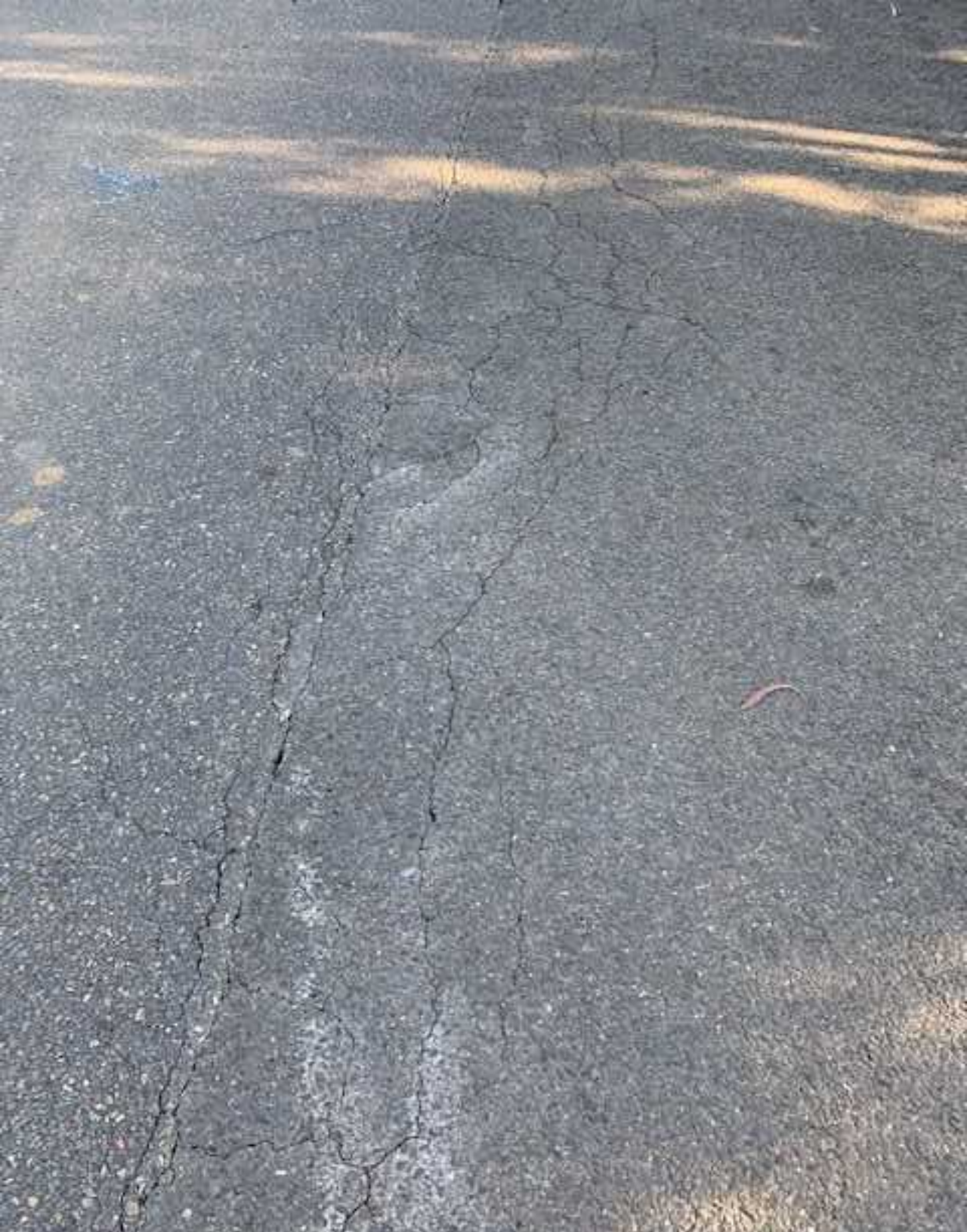
18. General Conditions of Kent Road Sinking present and extensive small cracks