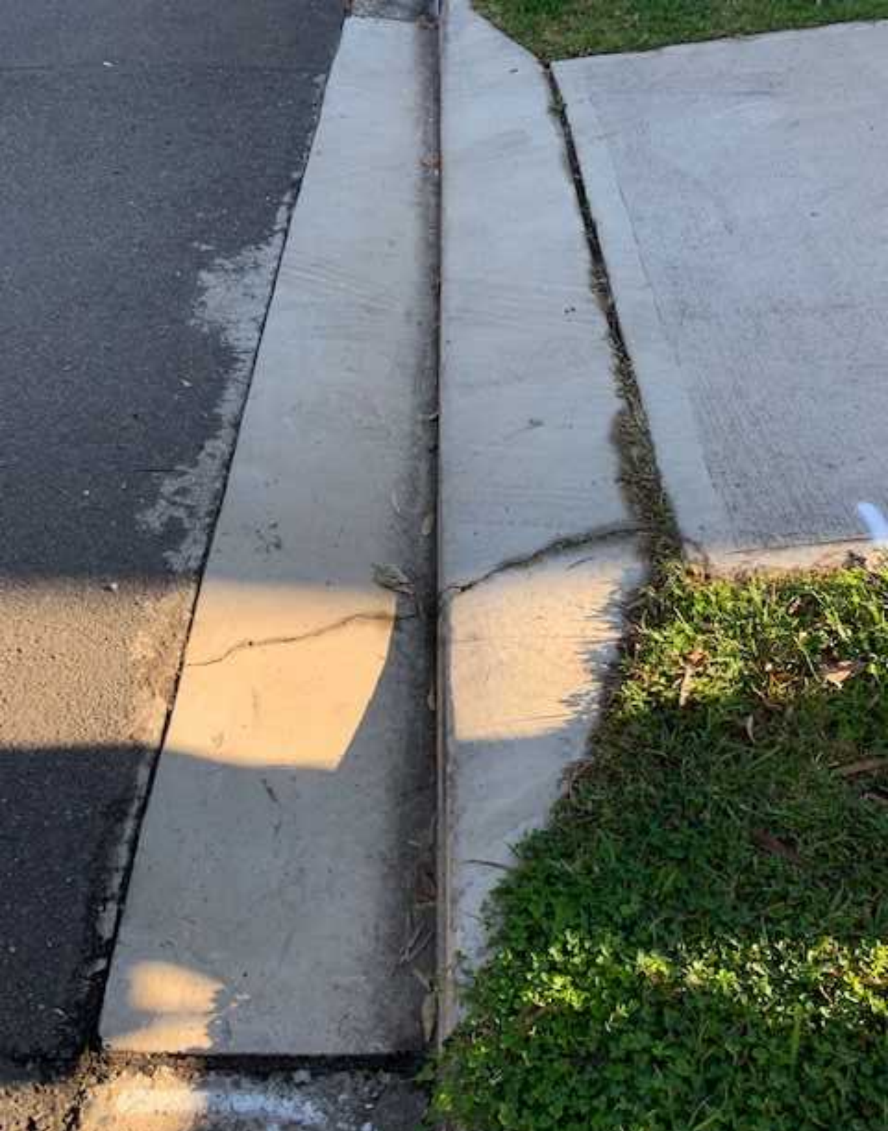
20a. General Conditions of footpath and neighboring driveways Cracks in driveway 1-10mm. Concrete sinking present