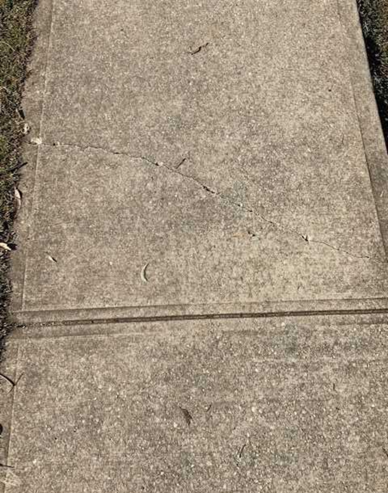
34b. General Conditions of footpath Multiple cracks in concrete pavement 1-10mm. Concrete sinking present