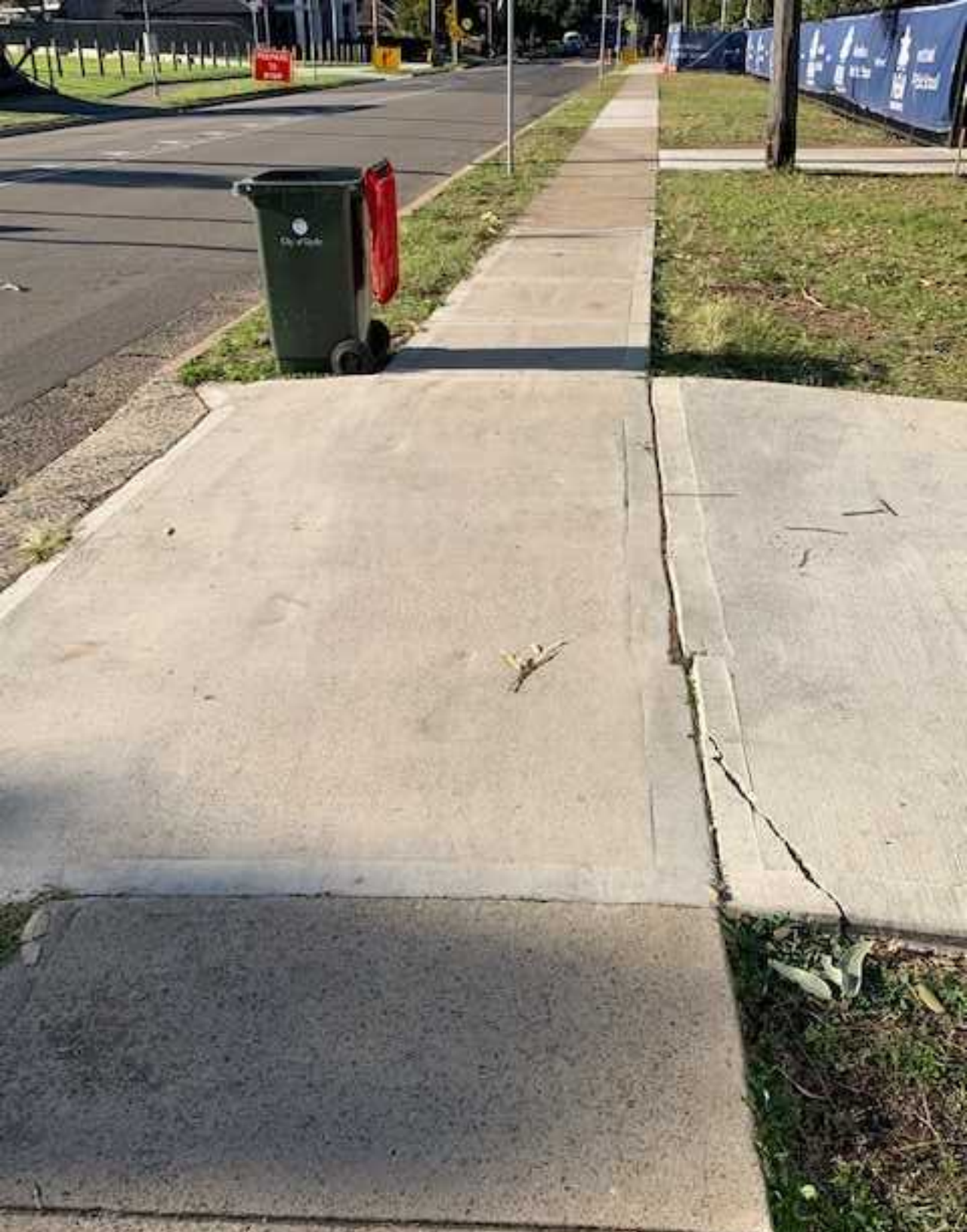
33. General Conditions neighboring driveway Concrete cracking 1-15mm. Minor concrete shrinkage present