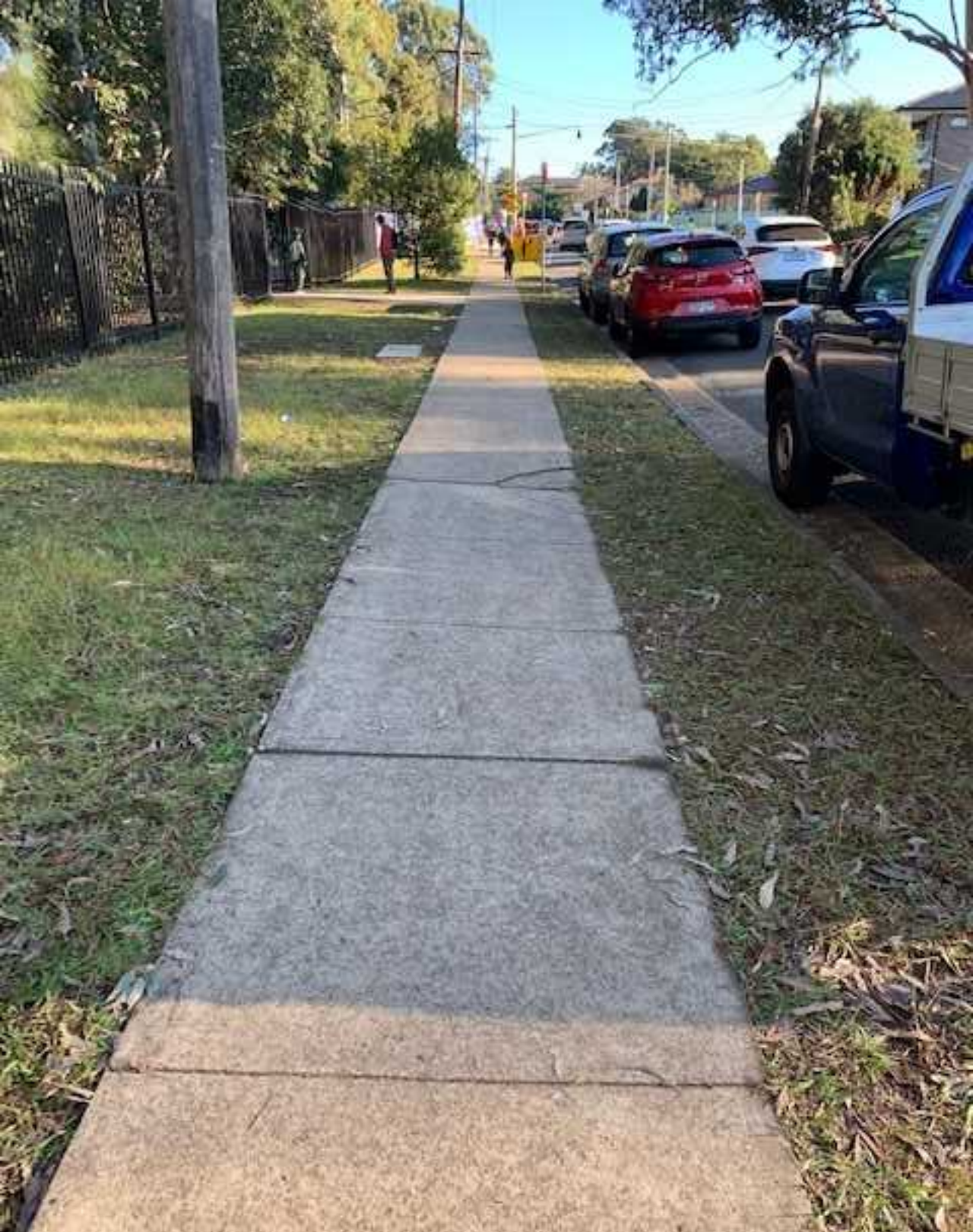
5. General Conditions of footpath Multiple cracks in concrete pavement 1-10mm. Concrete sinking present