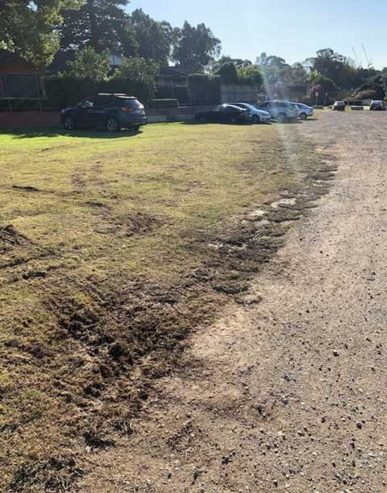
39. General Conditions of proposed construction parking area