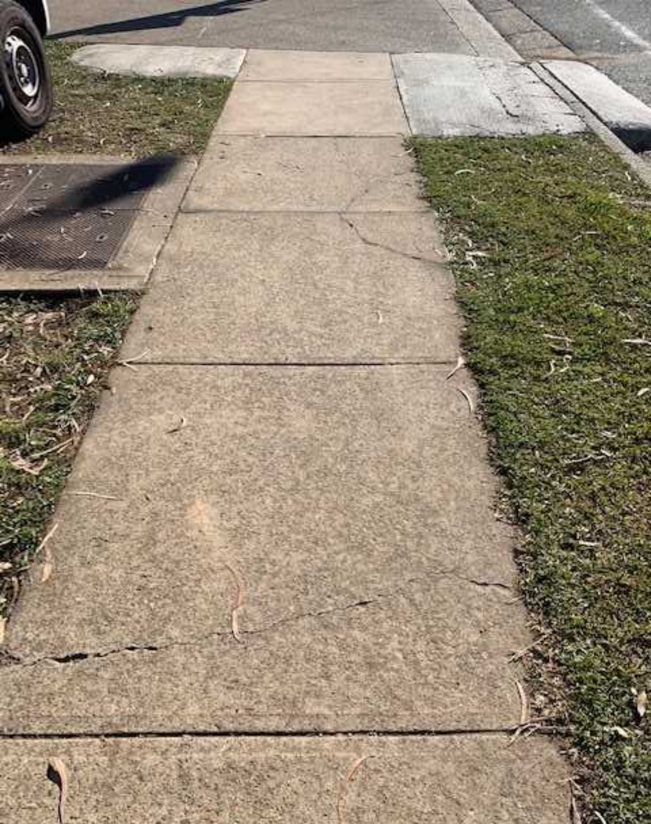
9a. General Conditions of footpath Multiple cracks in concrete pavement 1-10mm