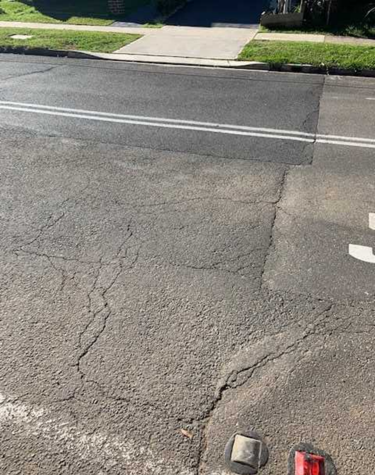
9c. General Conditions of Kent Road Sinking present and extensive small cracks