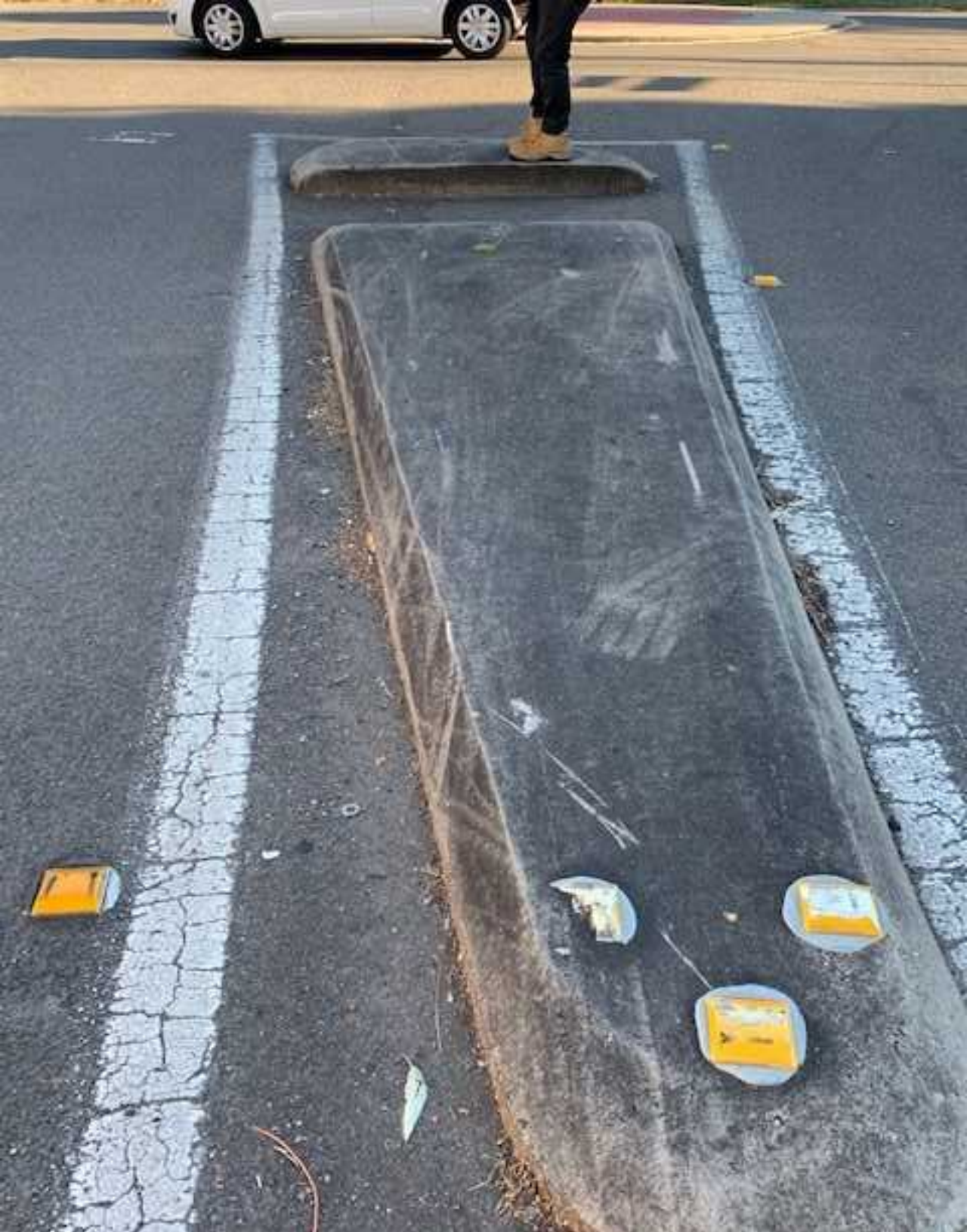
31. General Conditions of concrete island Cats eye broken. Multiple scratches