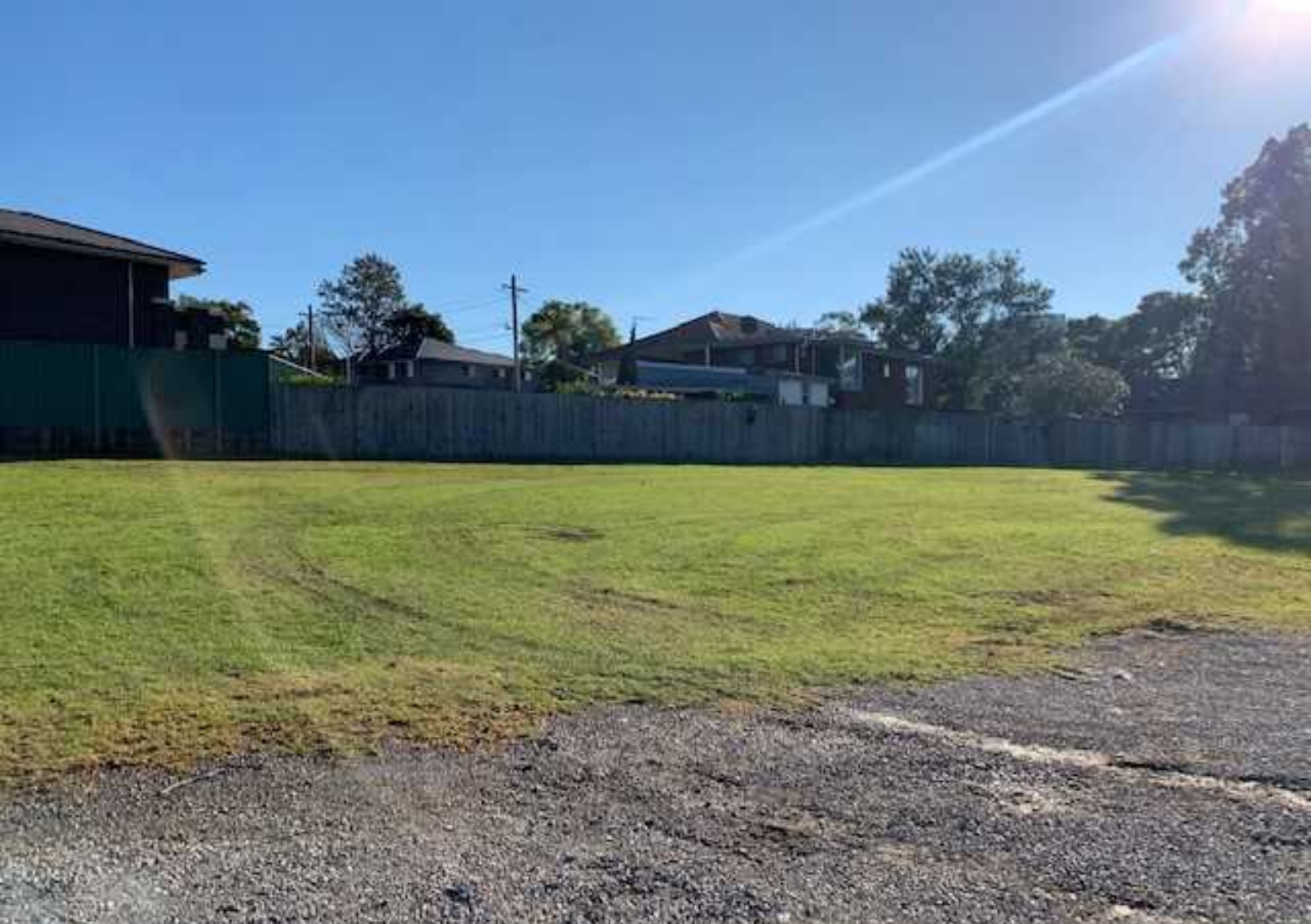
39. General condition of proposed construction parking area