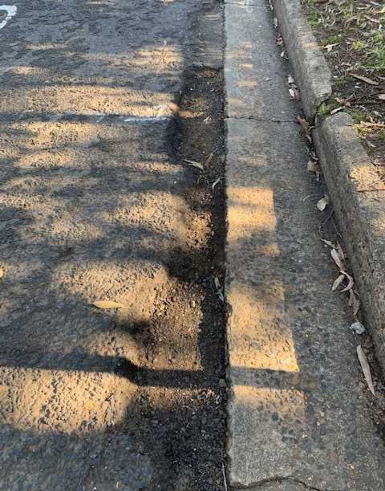
14. General Conditions of Kerb and Gutter Multiple cracks 1-20mm. Medium- Large pot holes in asphalt