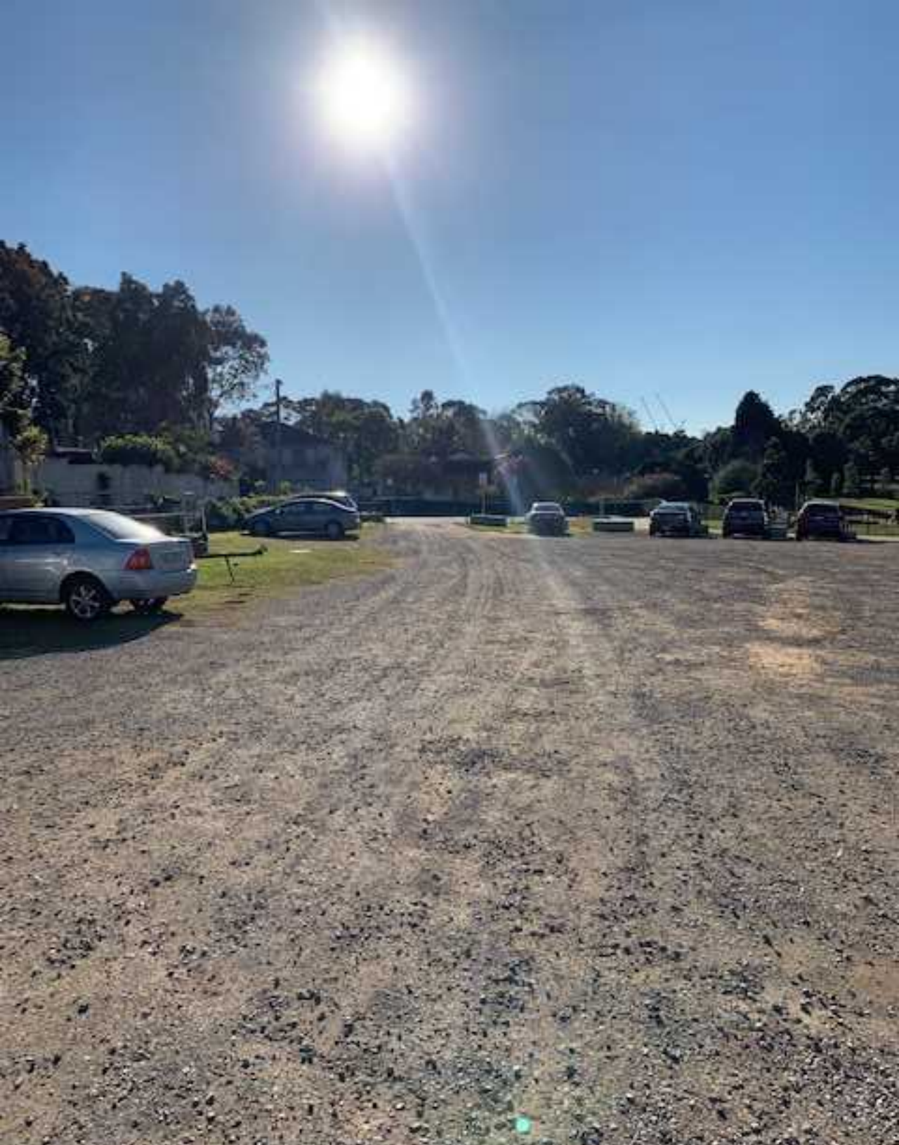
39. General Conditions of proposed construction parking area