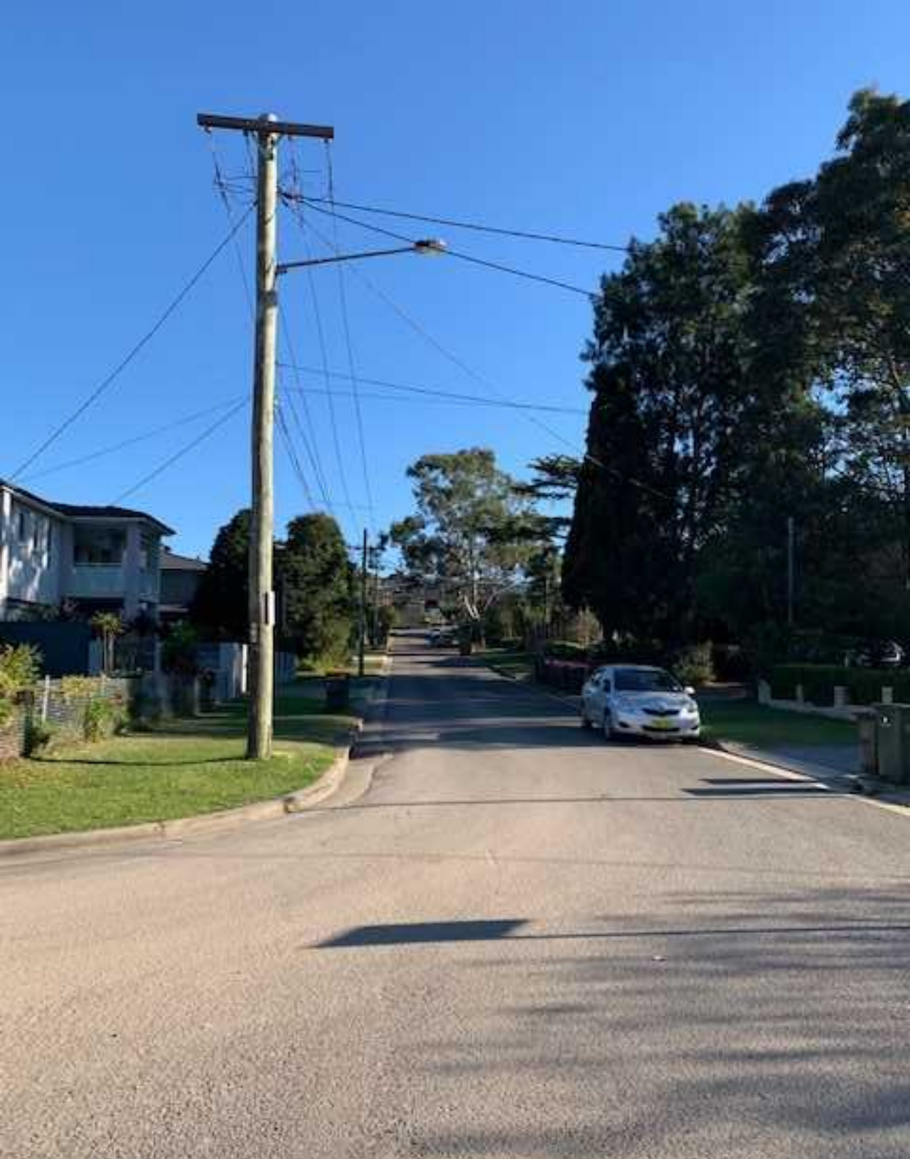
39. General Conditions of proposed construction parking access - Adelphi Road