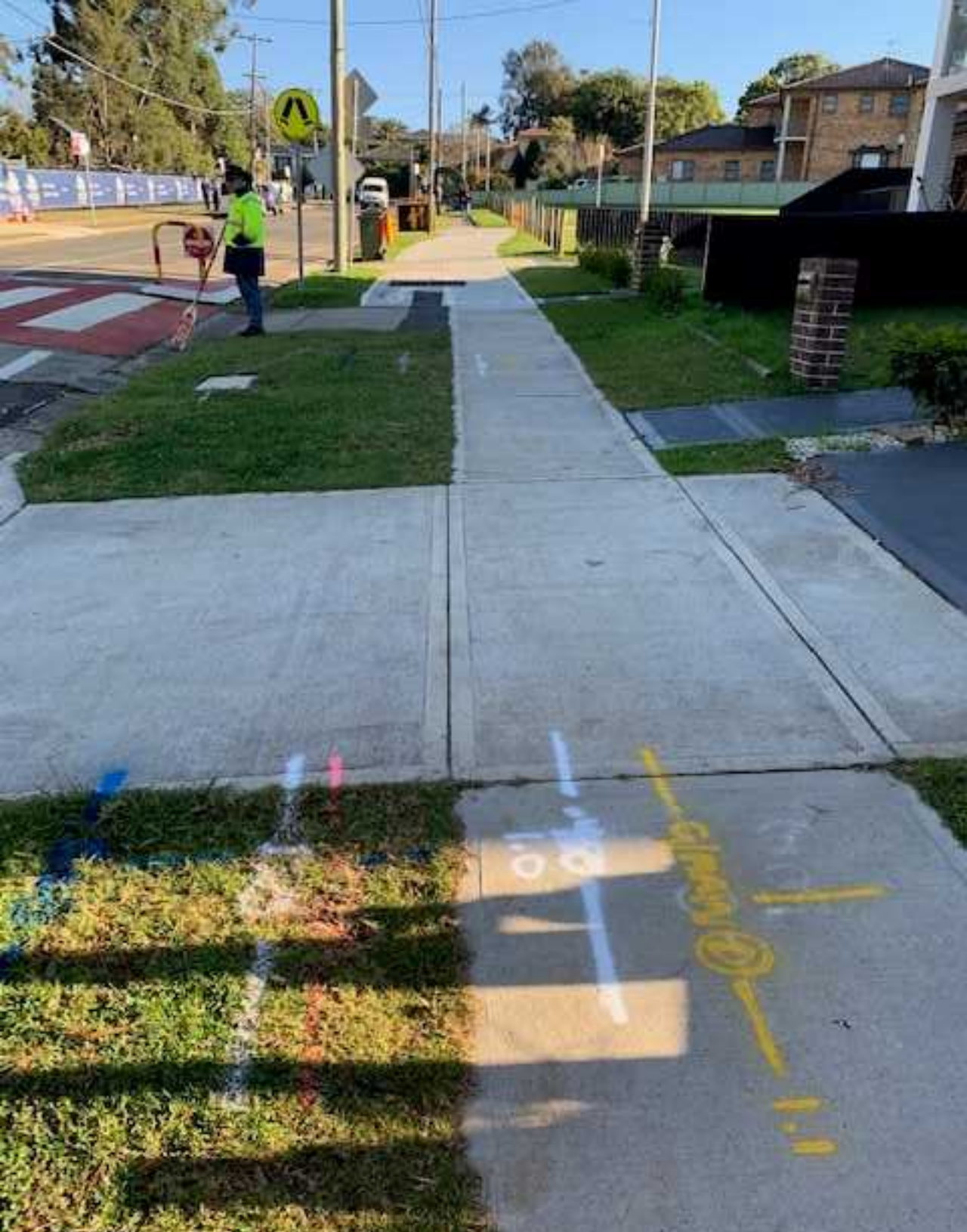
20b. General Conditions of footpath and neighboring driveways Cracks in driveway 1-10mm. Concrete sinking present Conditions of street South