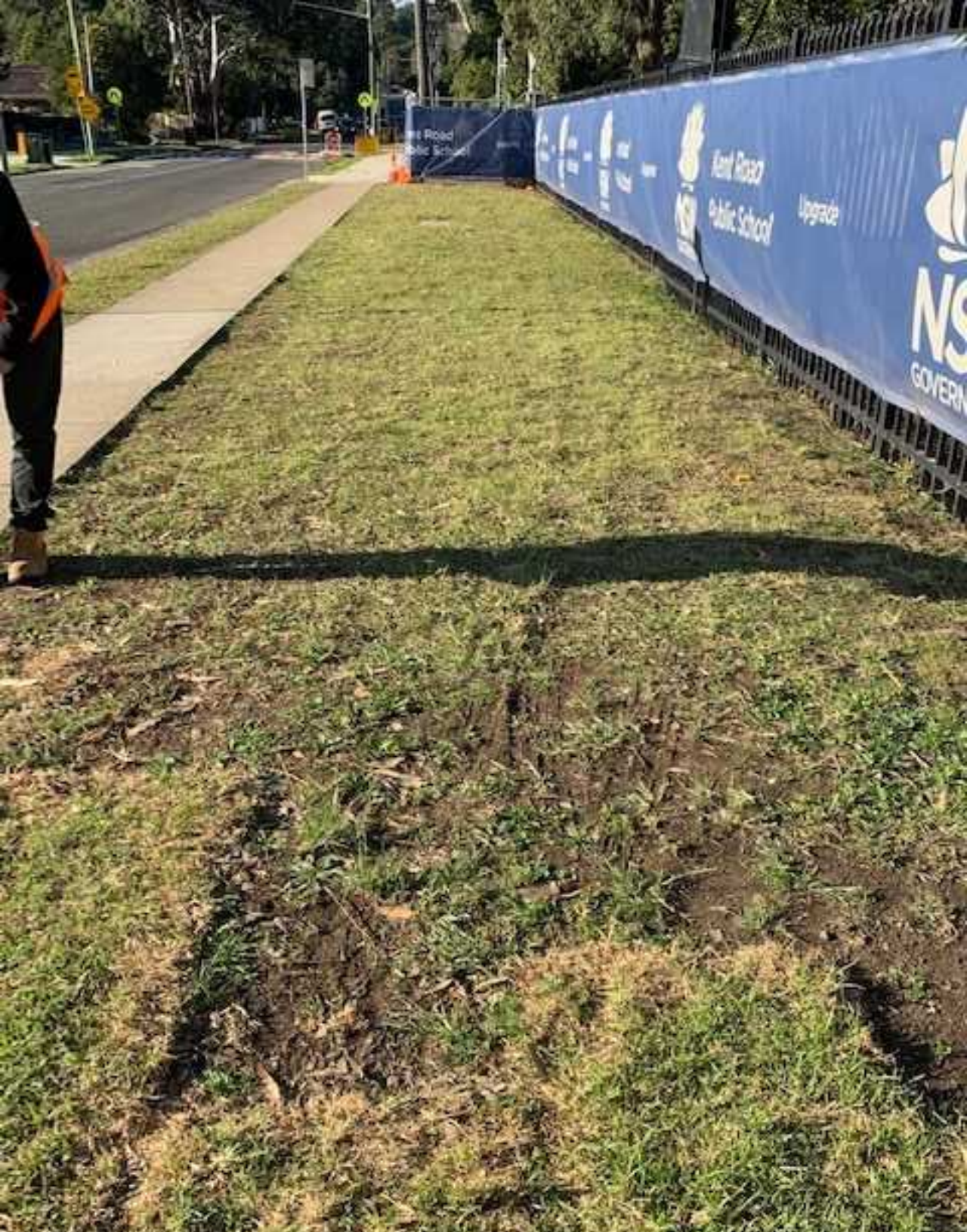
37b. General Conditions of turf in proposed cross over area Areas of turf no growth. Section of new turf (Not established completely yet)