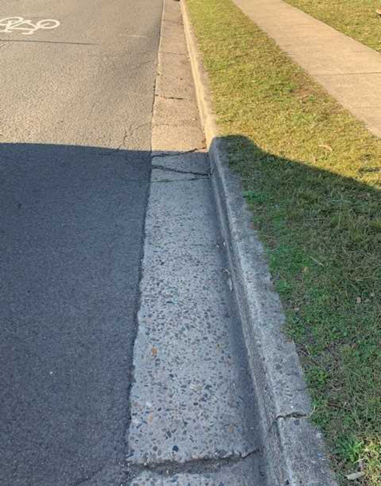
36. General Conditions of Kerb and Gutter Multiple cracks in concrete 1-15mm. Concrete sinking present