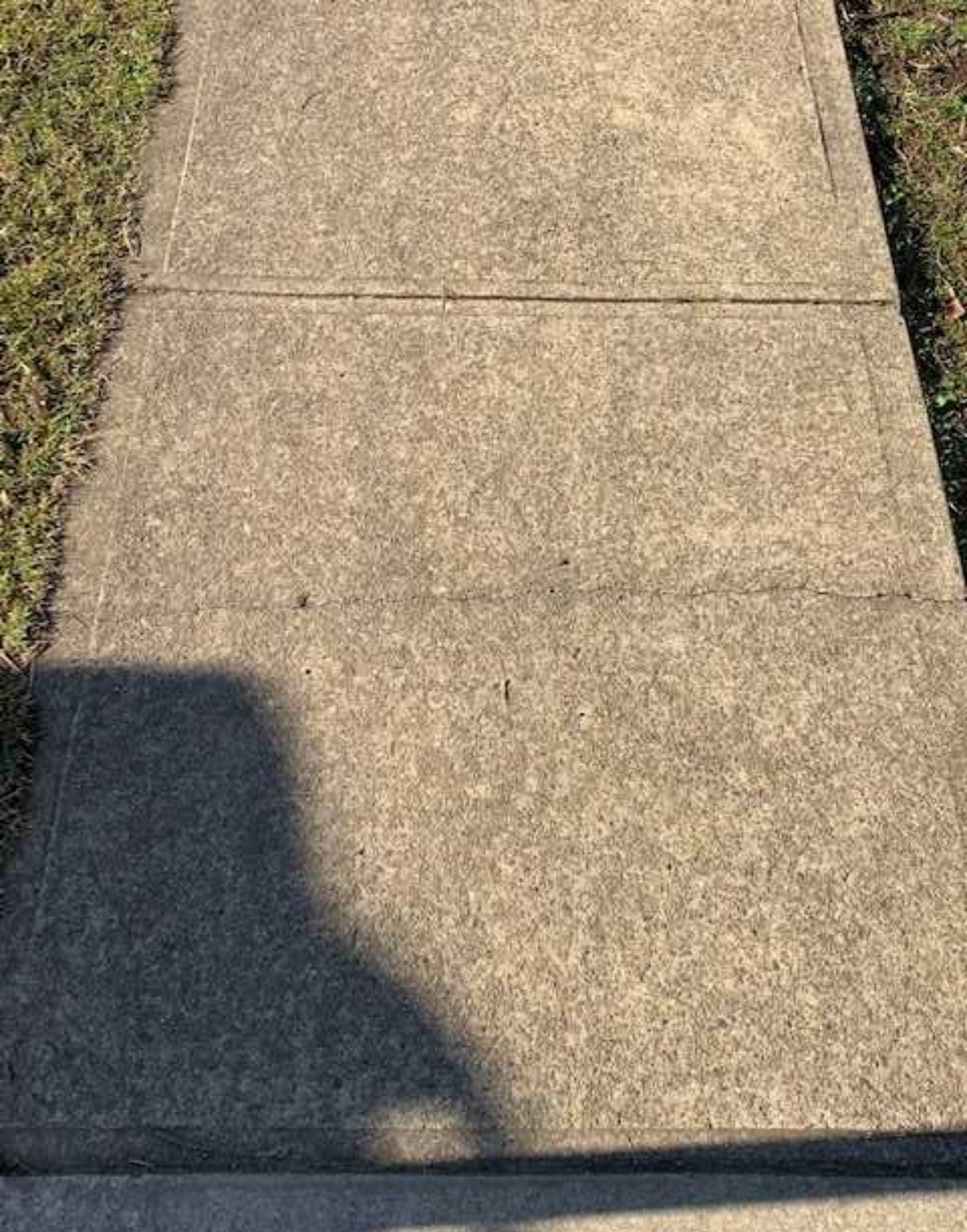
34c. General Conditions of footpath Multiple cracks in concrete pavement 1-10mm. Concrete sinking present