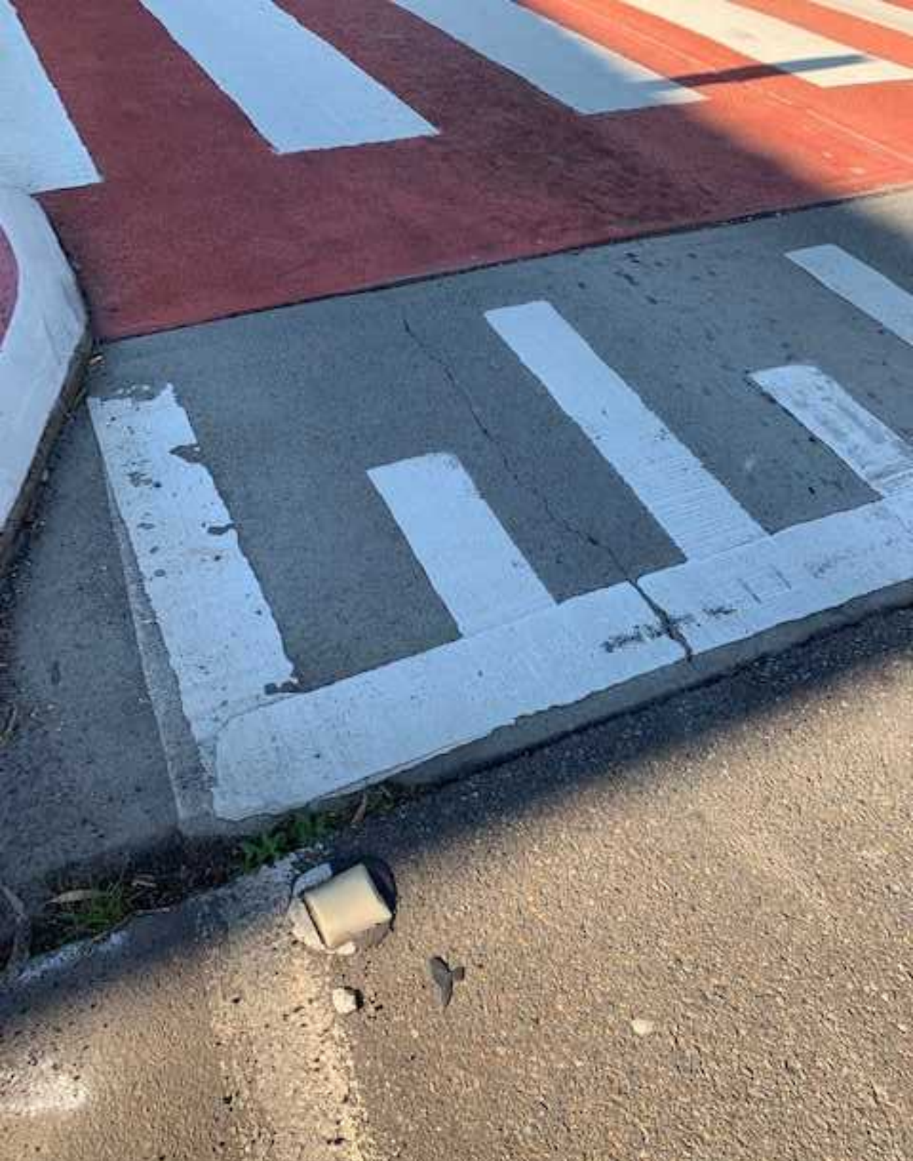
40. General Condition of existing pedestrian crossing Multiple cracks 1-10mm