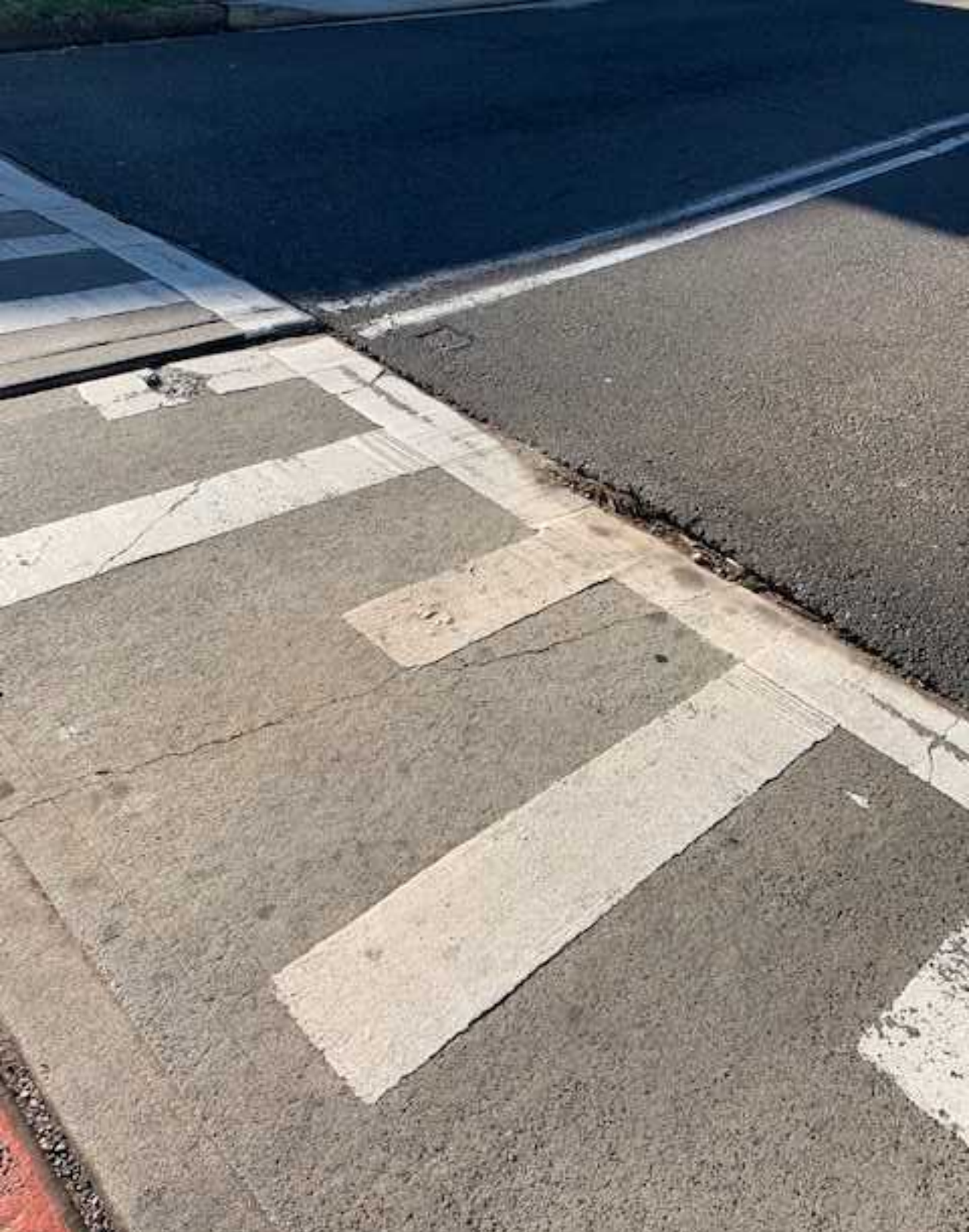
40. General Condition of existing pedestrian crossing Multiple cracks 1-10mm. Ramp sunken approx 25mm