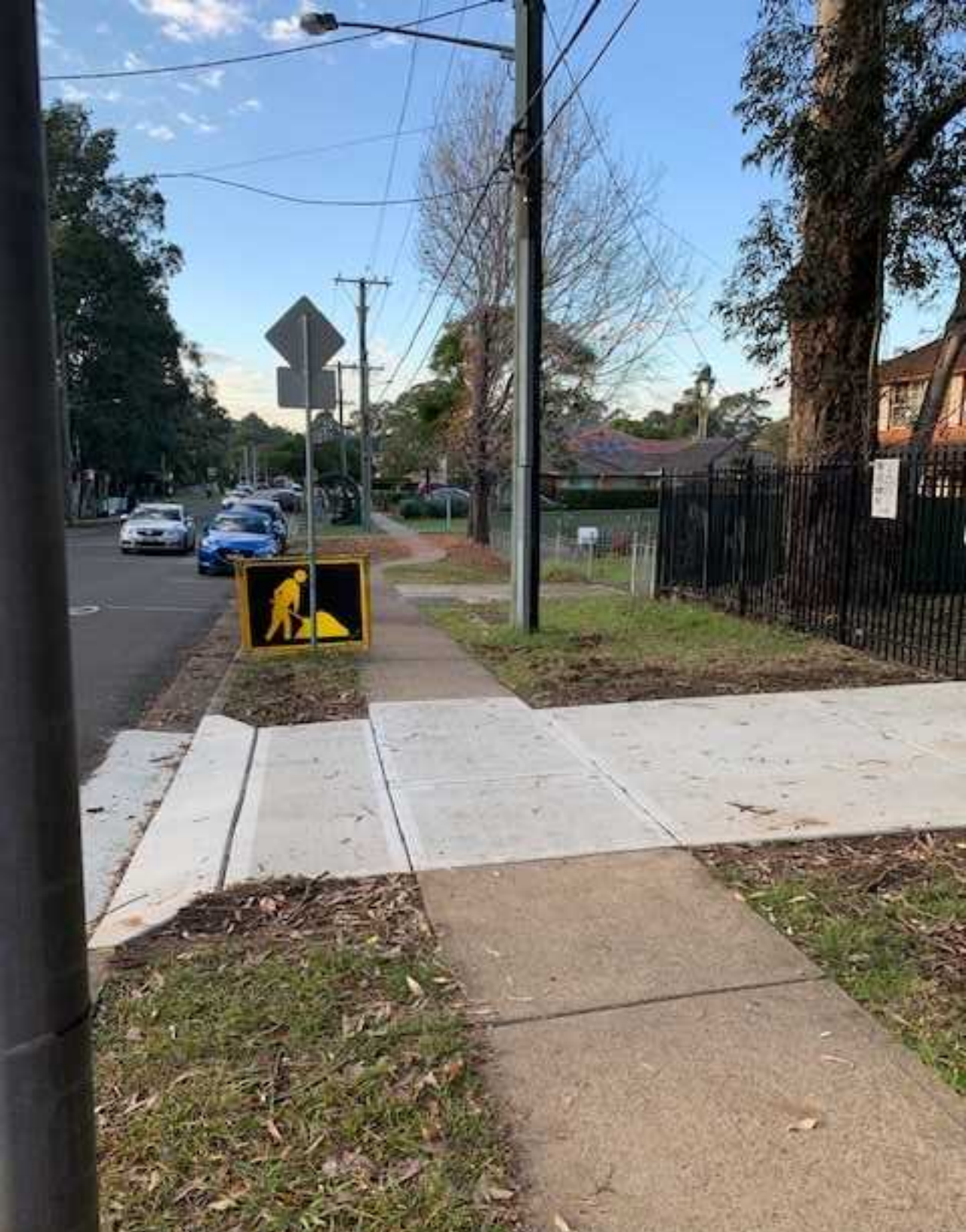
4. General Conditions of Footpath South