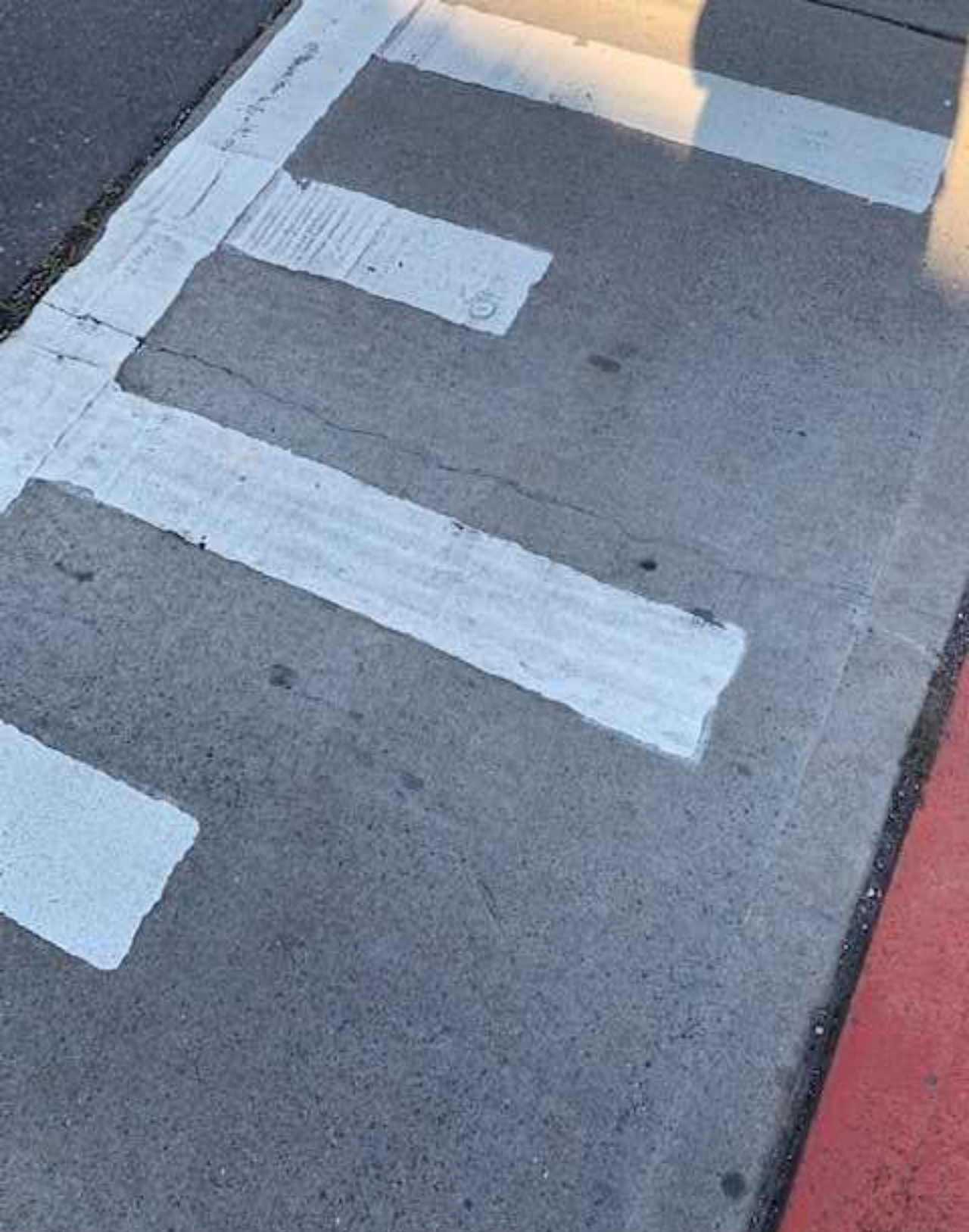
40. General Condition of existing pedestrian crossing Multiple cracks 1-10mm