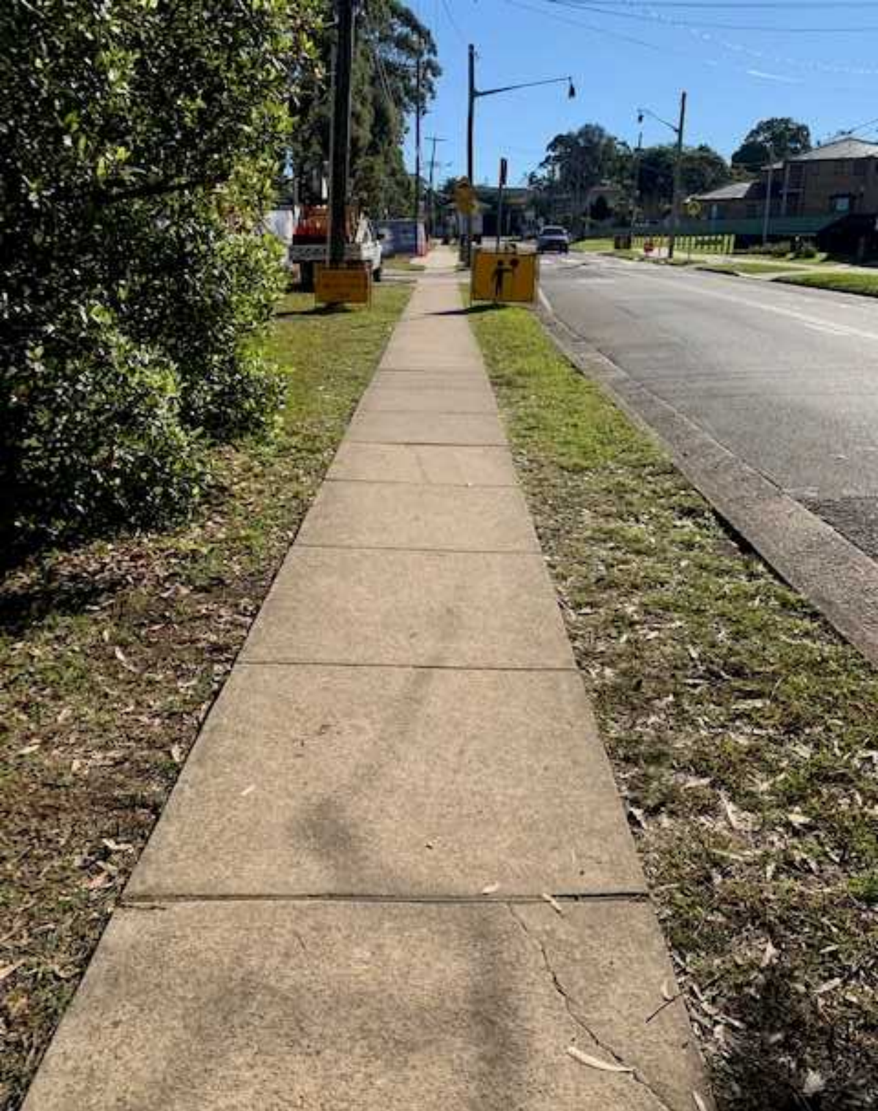
9a. General Conditions of footpath Multiple cracks in concrete pavement 1-10mm