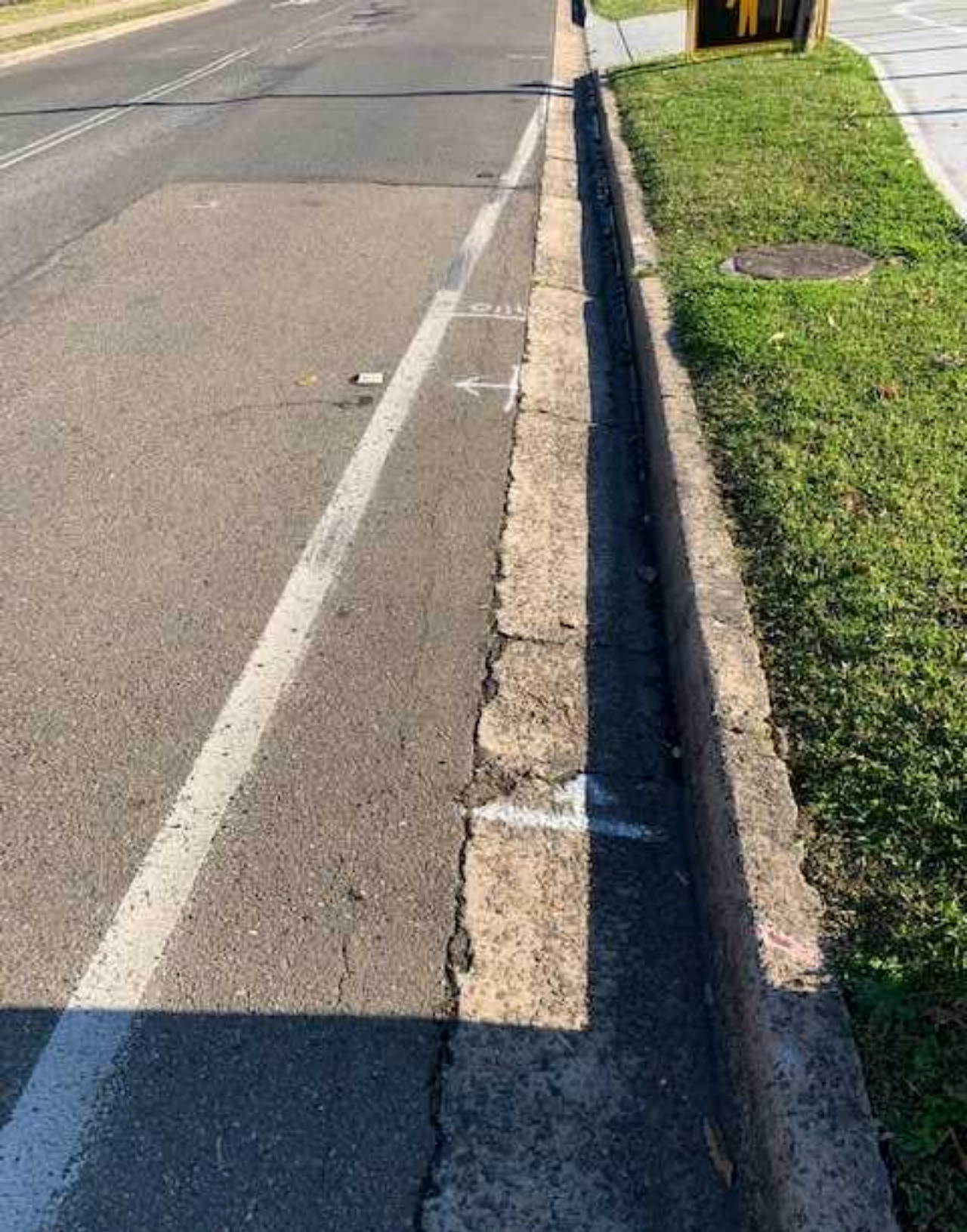
15b. General Conditions of Kerb and Gutter Multiple cracks 1-20mm