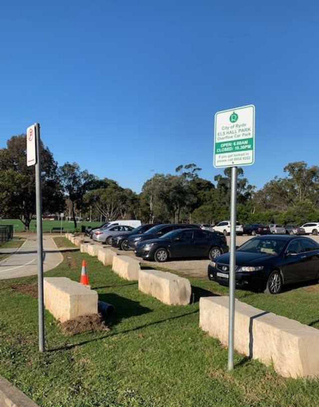
39. General Conditions of proposed construction parking area