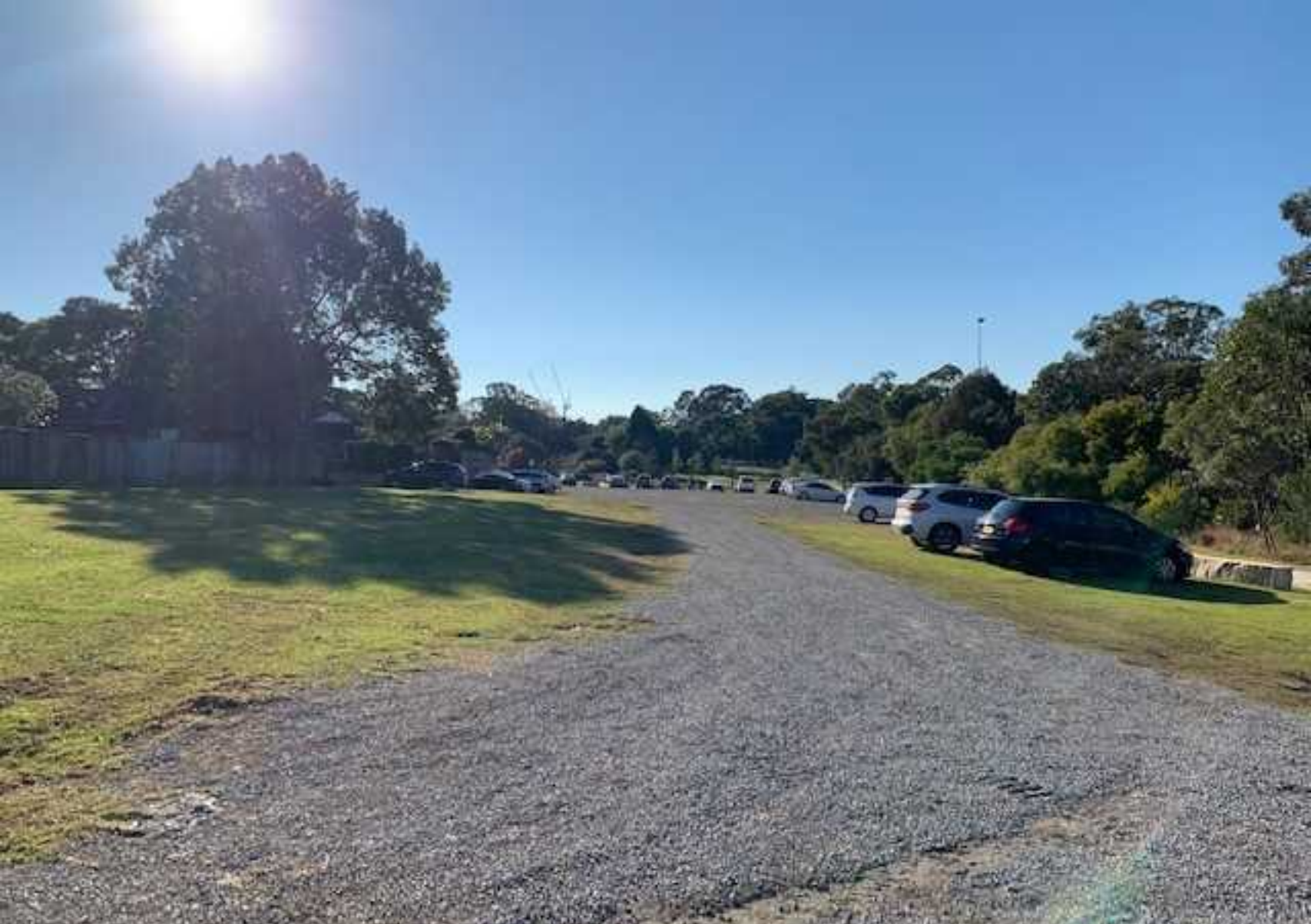
39. General condition of proposed construction parking area