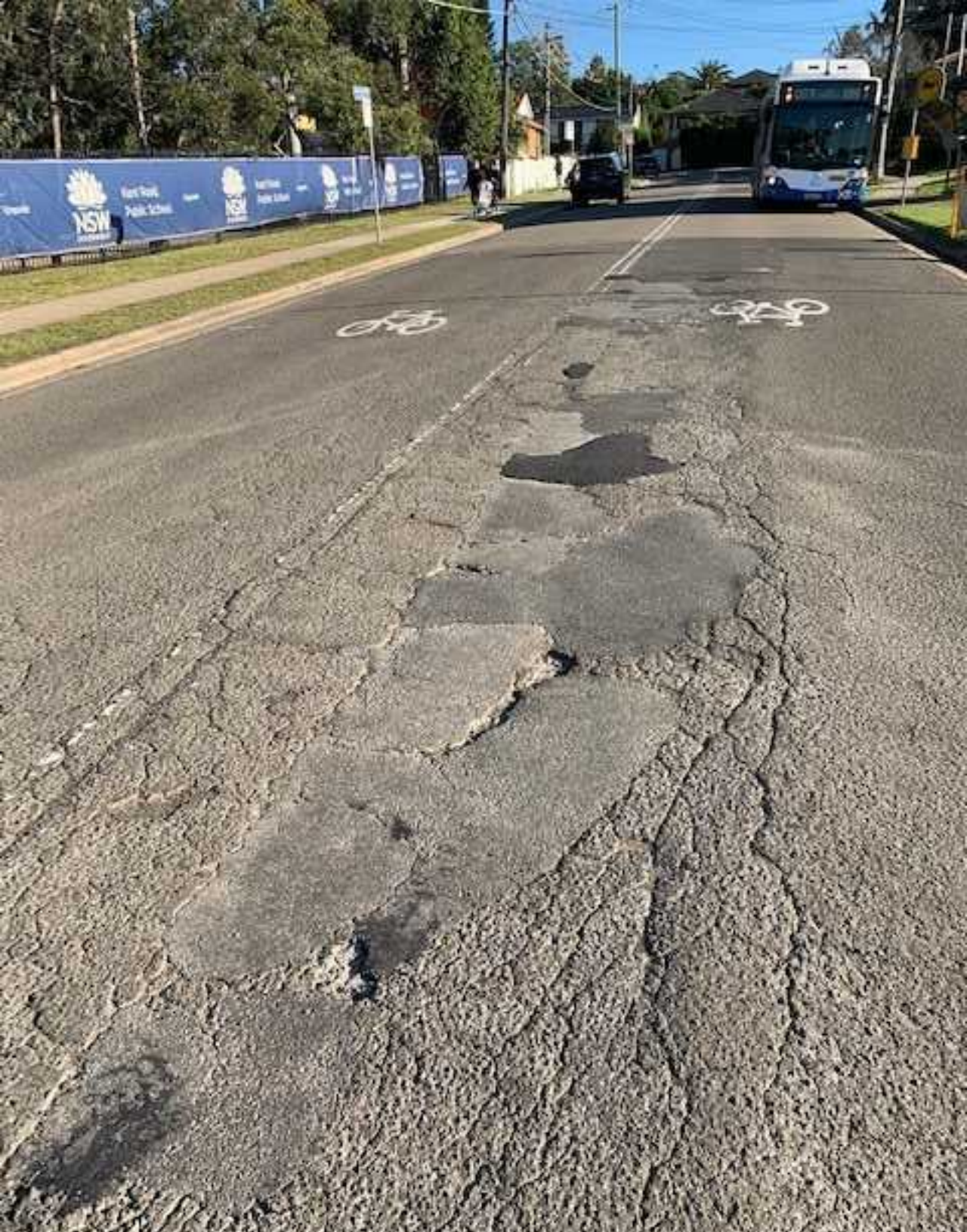
25. General Conditions of Kent Road - North Severe sinking and cracking. Multiple asphalt patches present