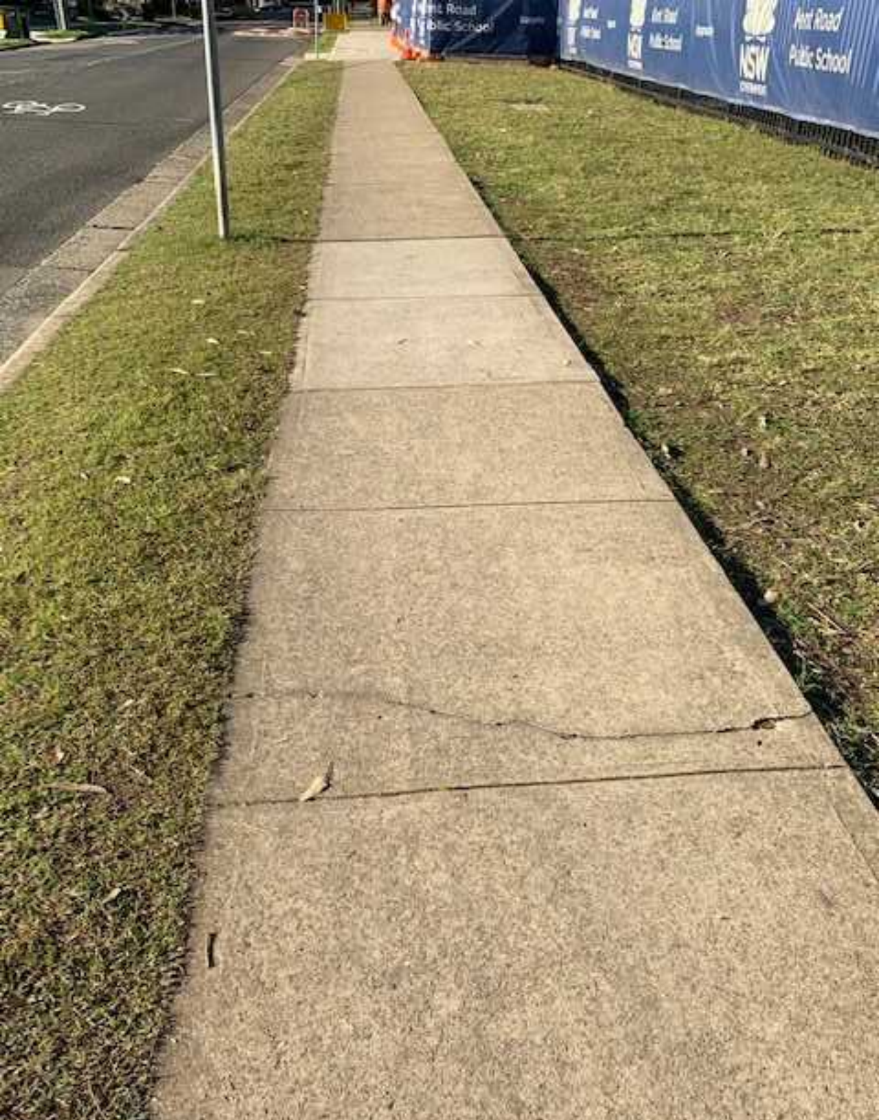
34a. General Conditions of footpath Multiple cracks in concrete pavement 1-10mm. Concrete sinking present