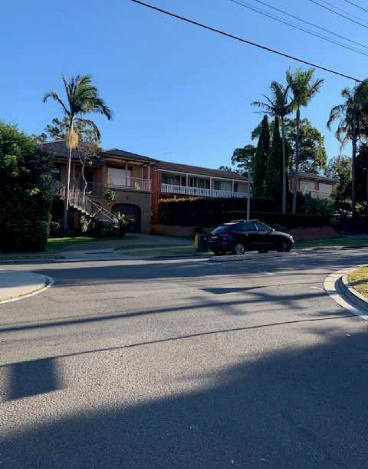
32. General Conditions of round about. Generally ok. Minor wear and tear