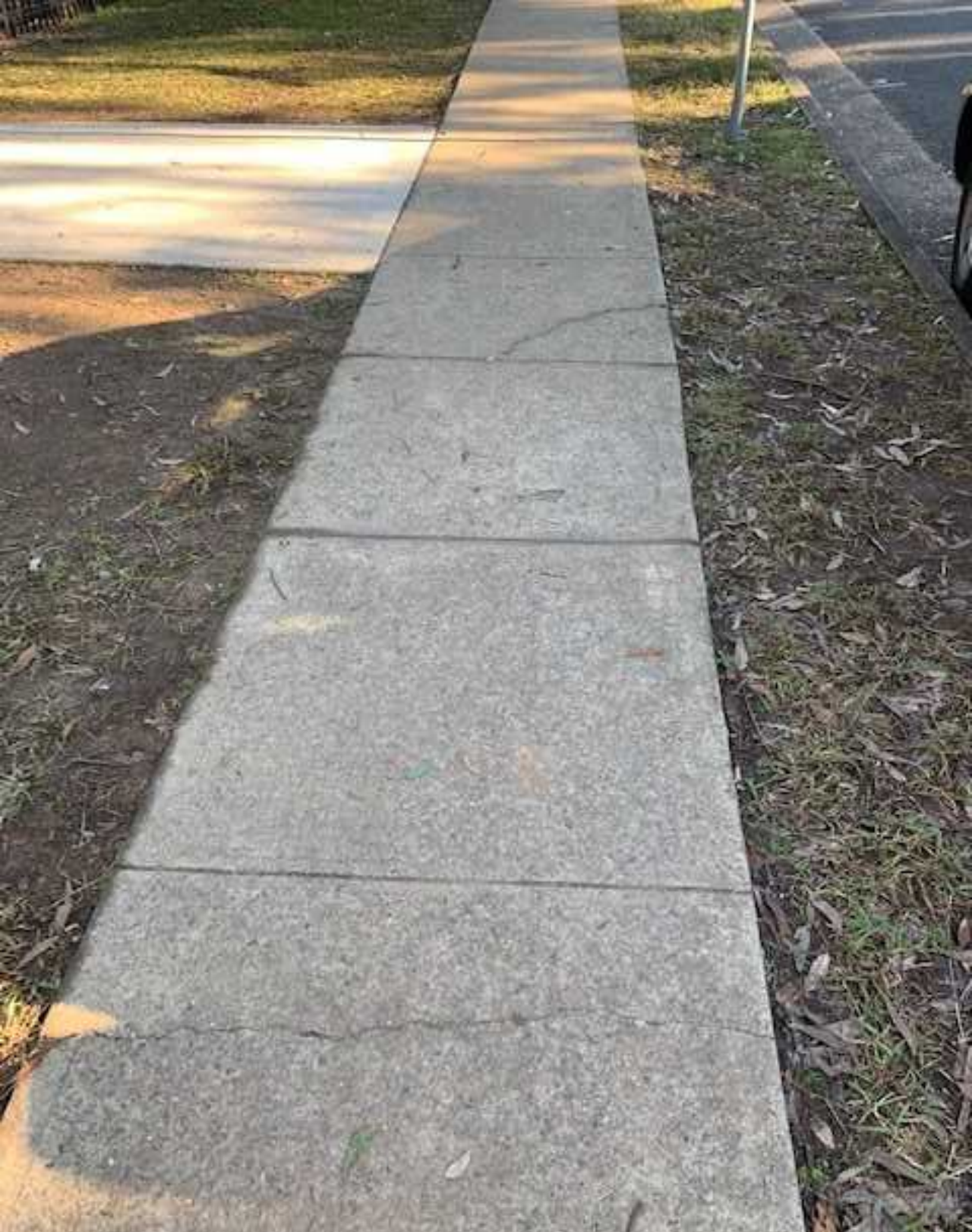
9. General Conditions of footpath Multiple cracks in concrete pavement 1-10mm