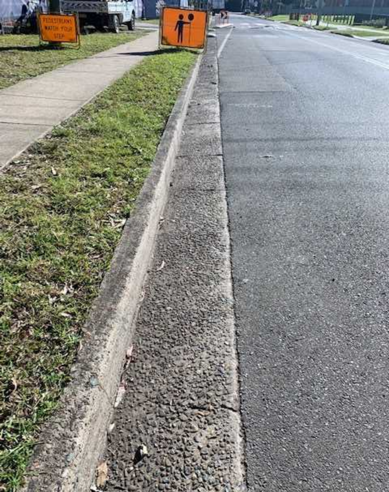
9b. General Conditions of Kerb and Gutter Multiple crack 1-15mm