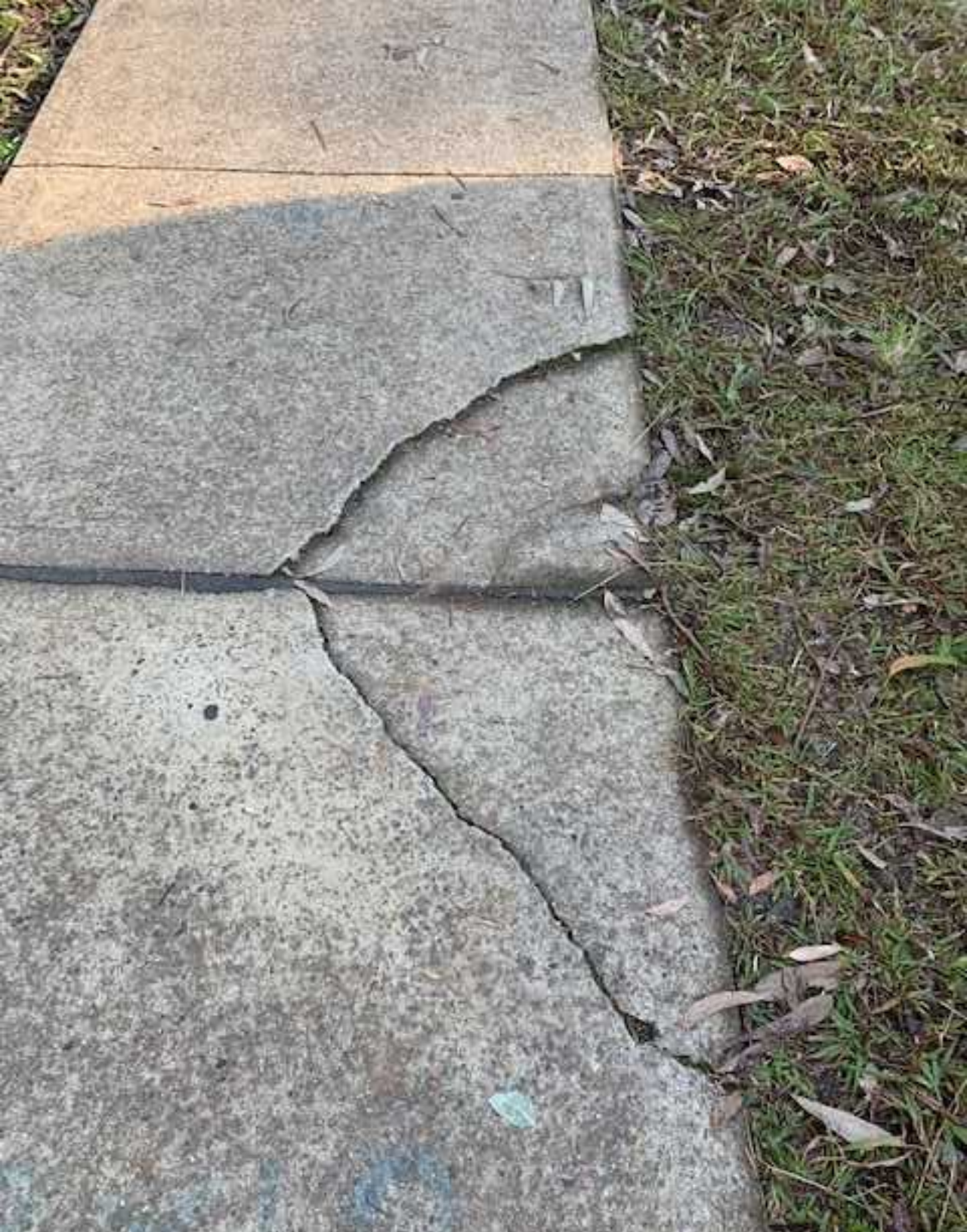
6. General Conditions of footpath Multiple cracks in concrete pavement 1-10mm. Concrete sinking present