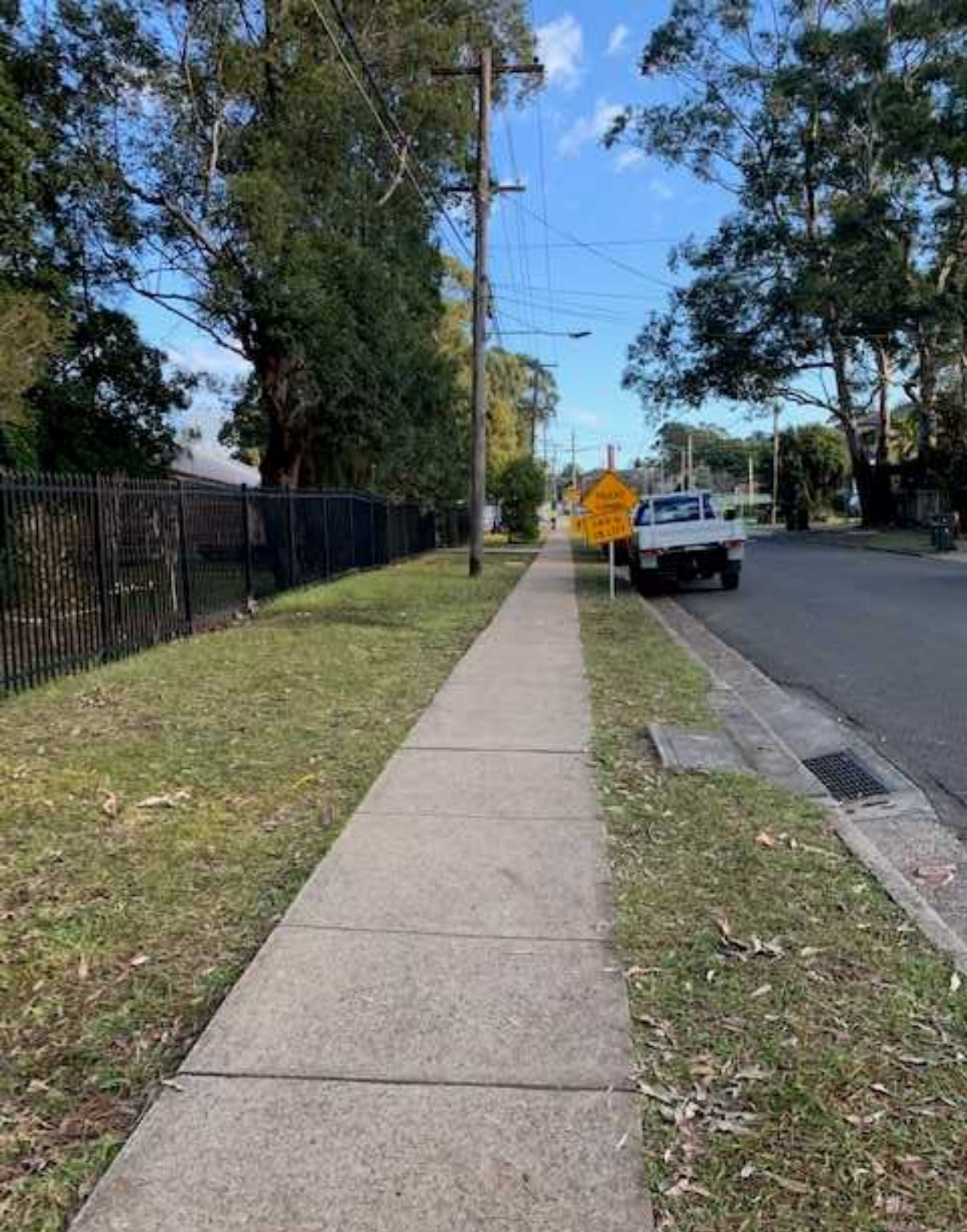
3. General Condition of Footpath - North