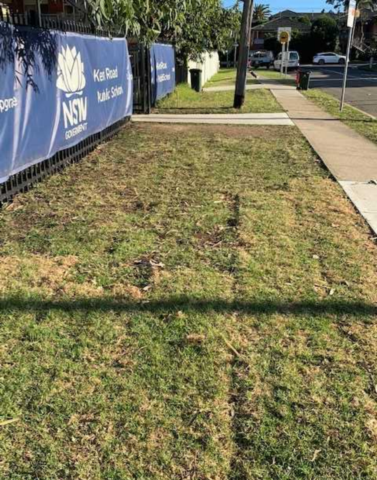
37a. General Conditions of turf in proposed cross over area Areas of turf no growth. Section of new turf (Not established completely yet)