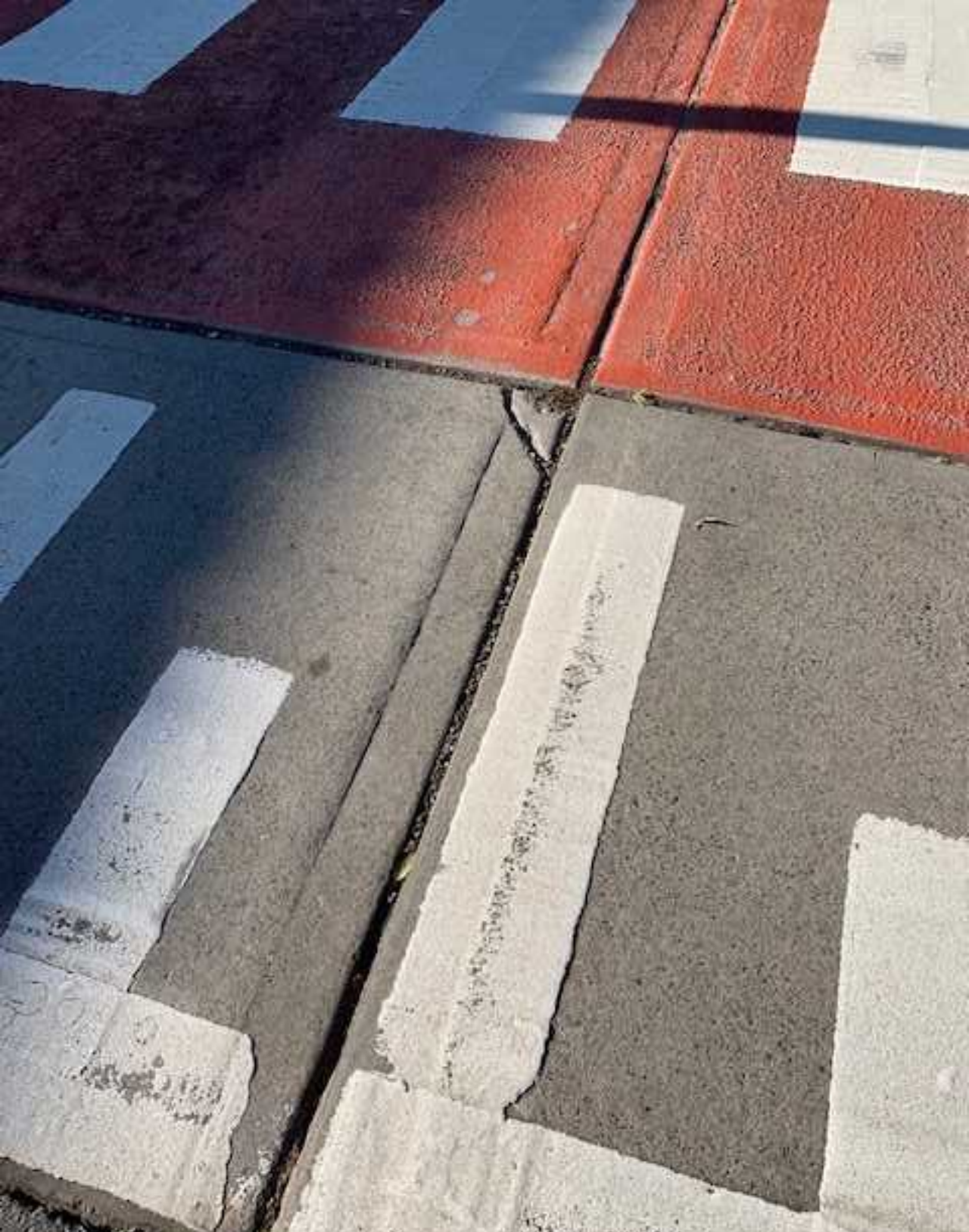
40. General Condition of existing pedestrian crossing Multiple cracks 1-10mm