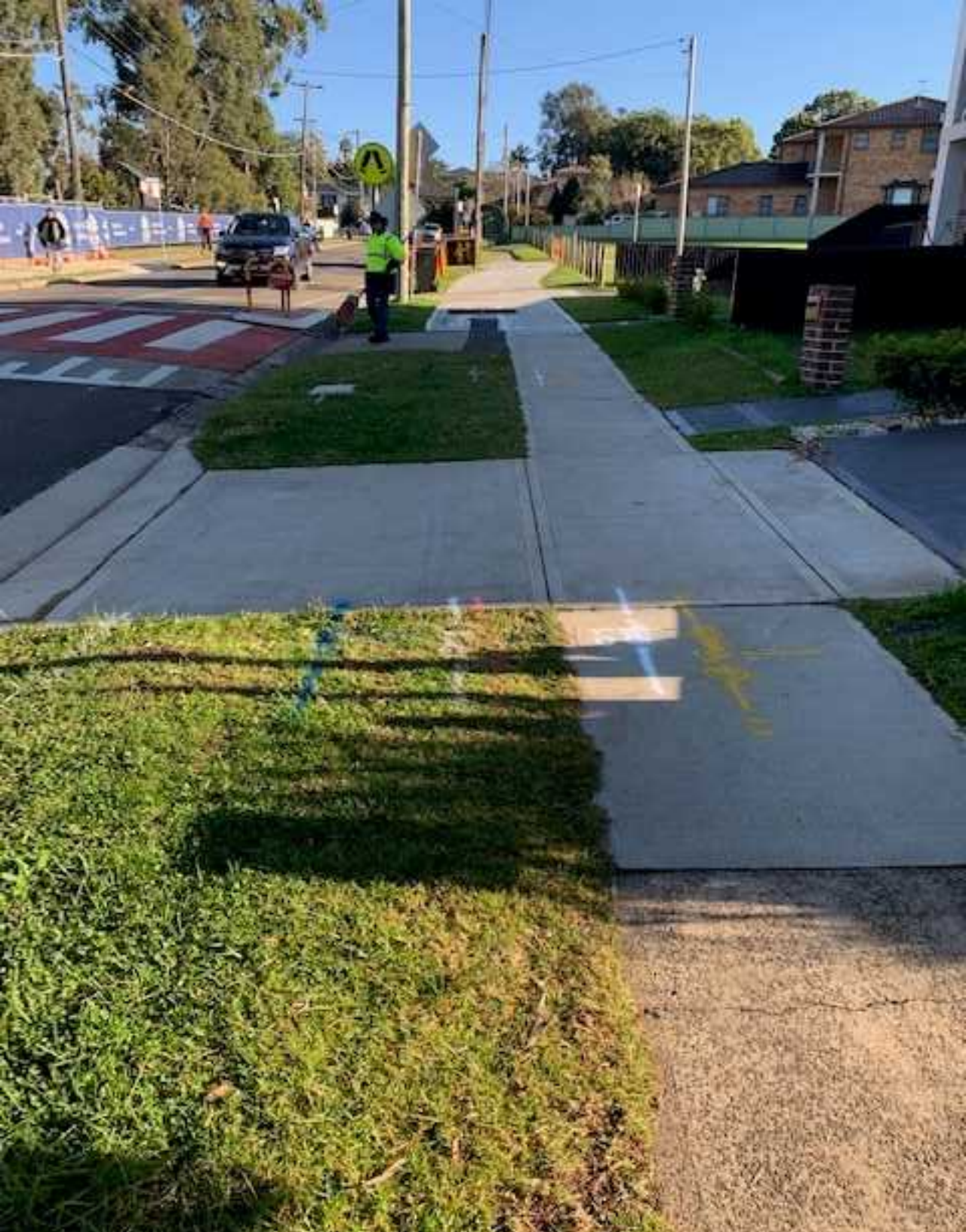
17. General Conditions of footpath and neighboring driveways Service location spray paint present. Small cracks in pavement