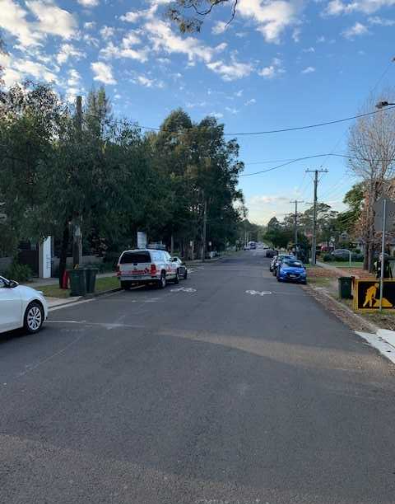
1. General Conditions of Kent Road - South