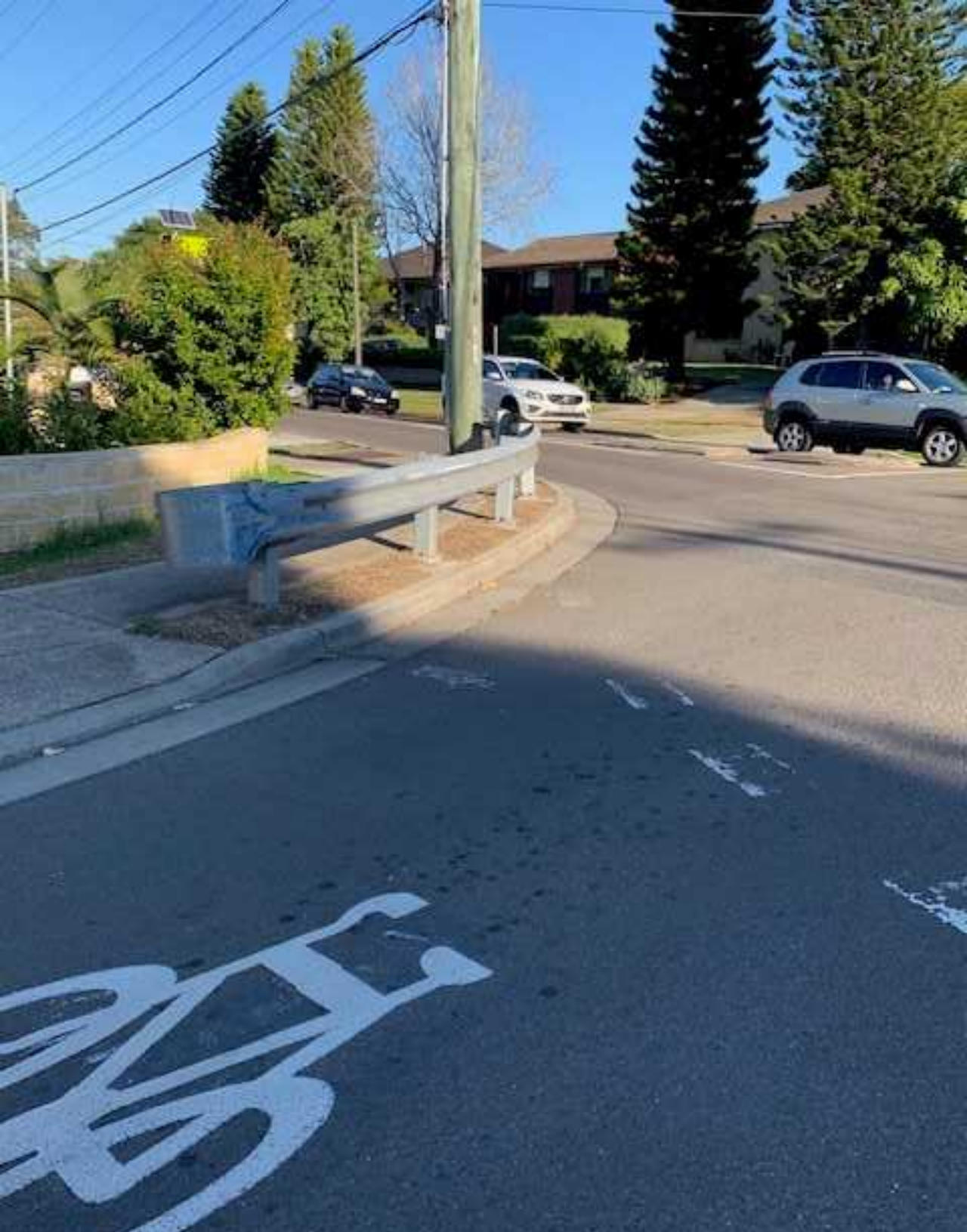
30. General Conditions of barrier Scratches and dents evident