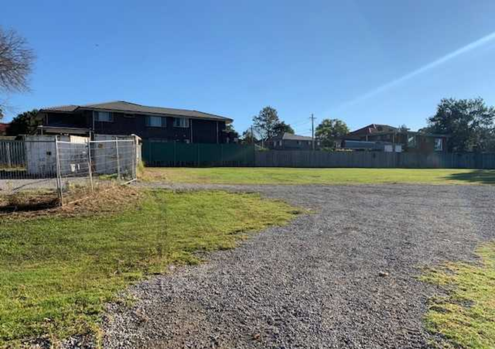
39. General condition of proposed construction parking area