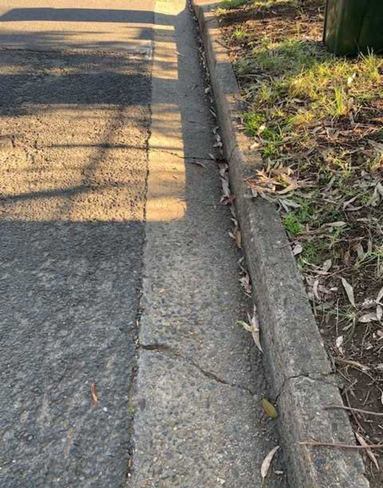
15a. General Conditions of Kerb and Gutter Multiple cracks 1-20mm