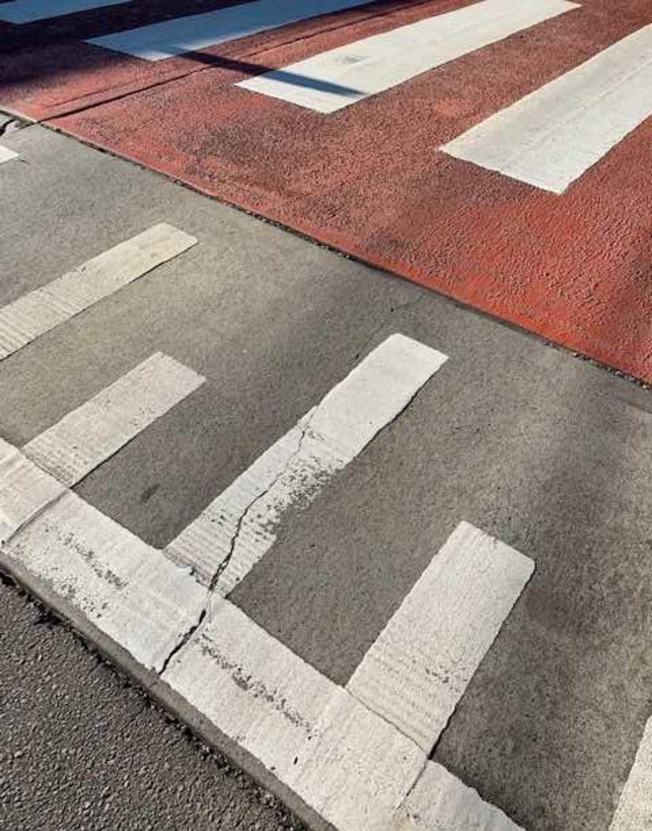
40. General Condition of existing pedestrian crossing Multiple cracks 1-10mm