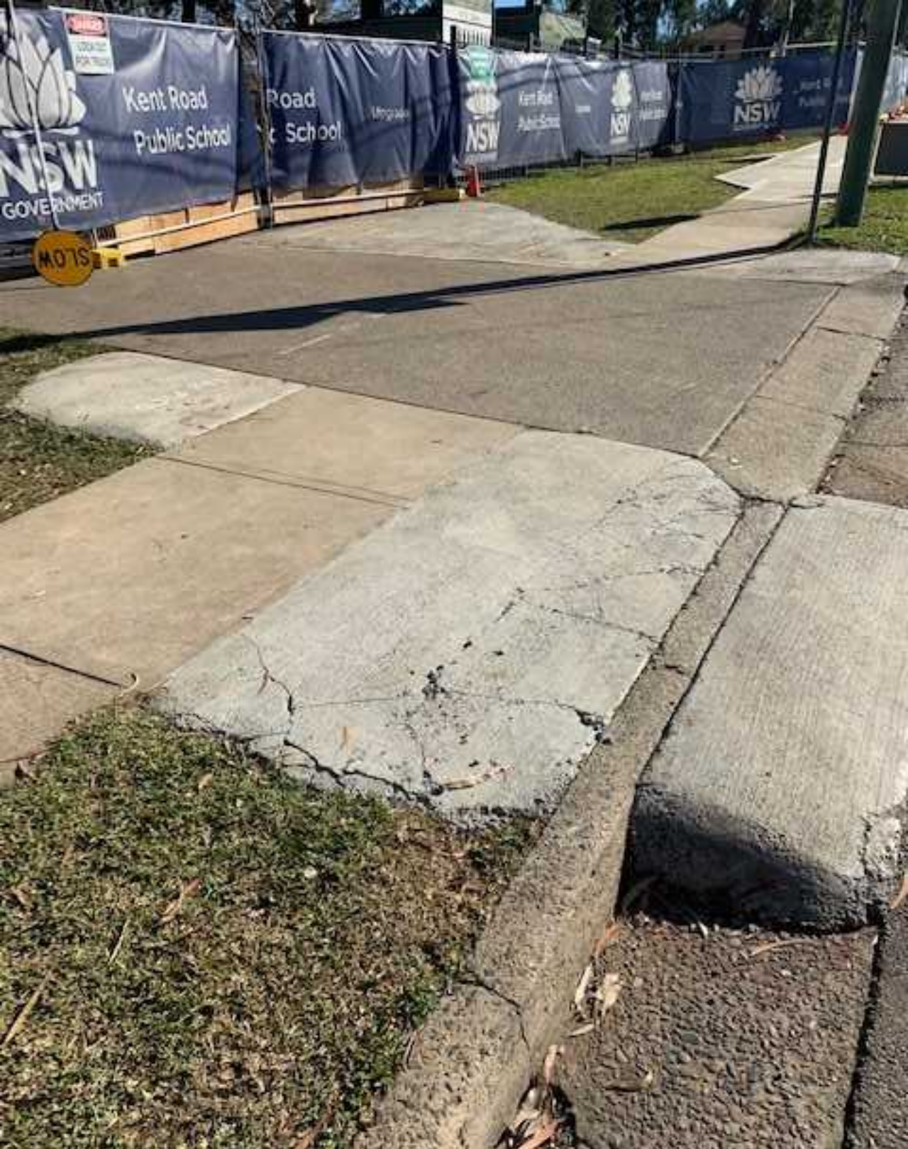
9d. General Conditions of temporary / existing cross over