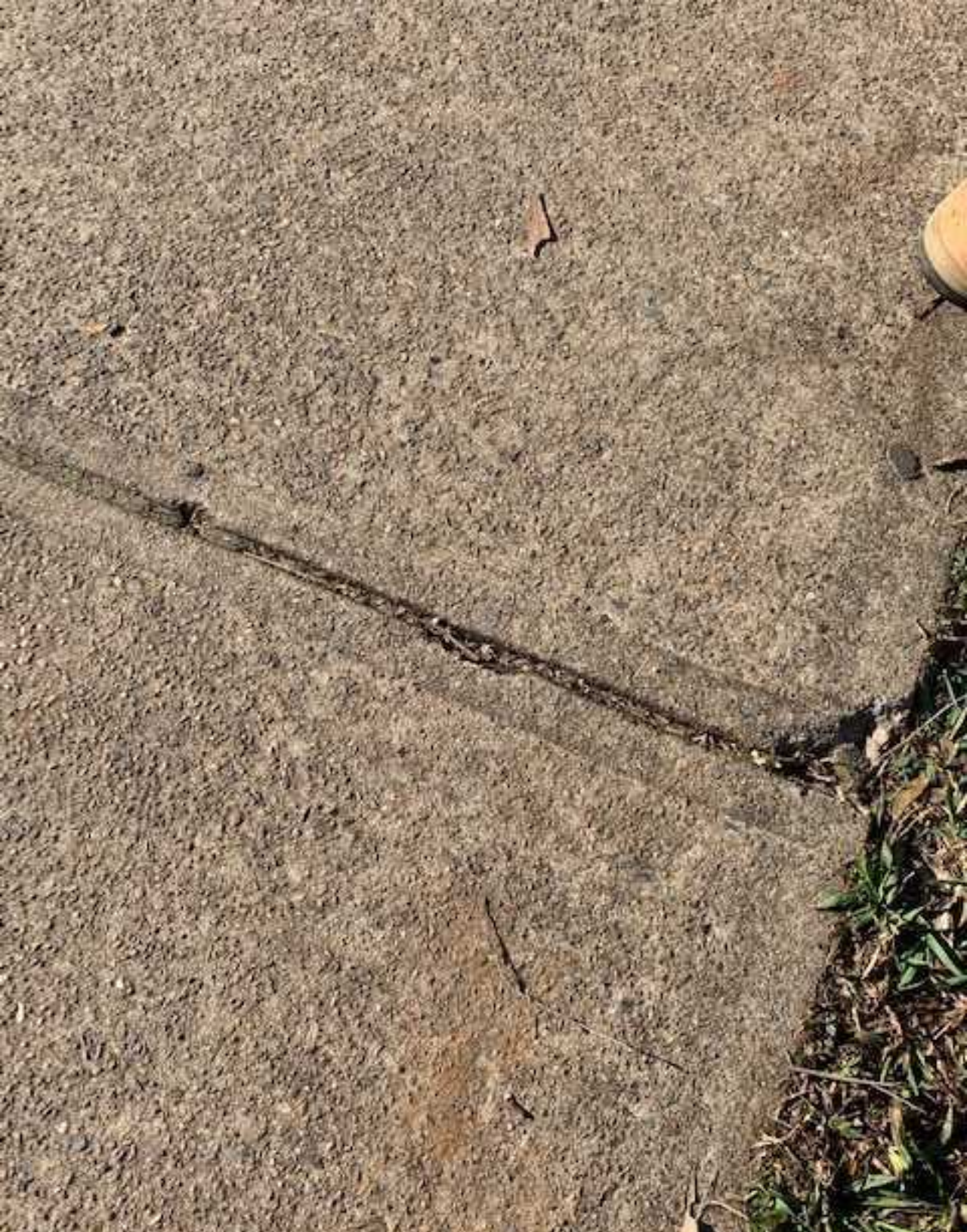
34e. General Conditions of footpath Multiple cracks in concrete pavement 1-10mm. Concrete sinking present