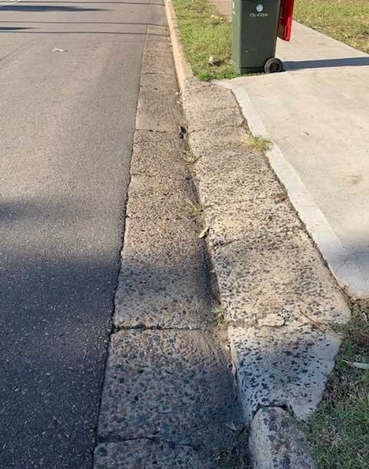
33. General Conditions neighboring driveway / Kerb and Gutter Concrete cracking 1-15mm. Minor concrete shrinkage present