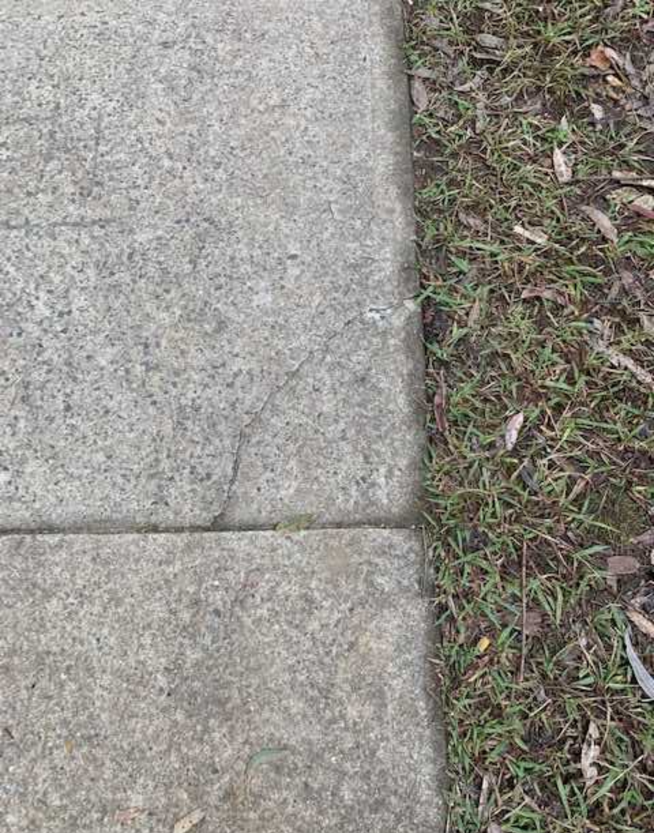
8. General Conditions of footpath Multiple cracks in concrete pavement 1-10mm