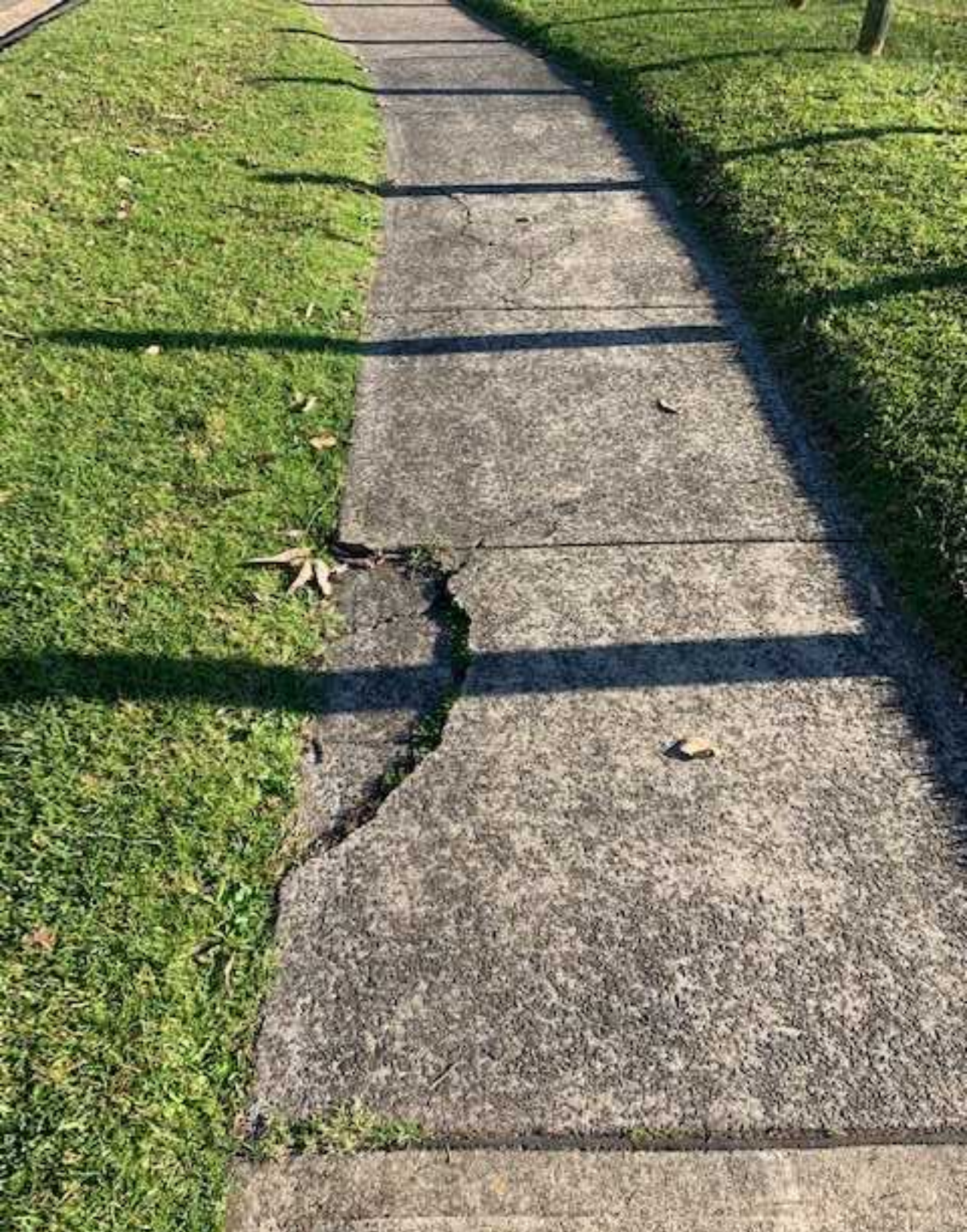
27. General Conditions of footpath Multiple cracks 1-20mm. Concrete sinking present