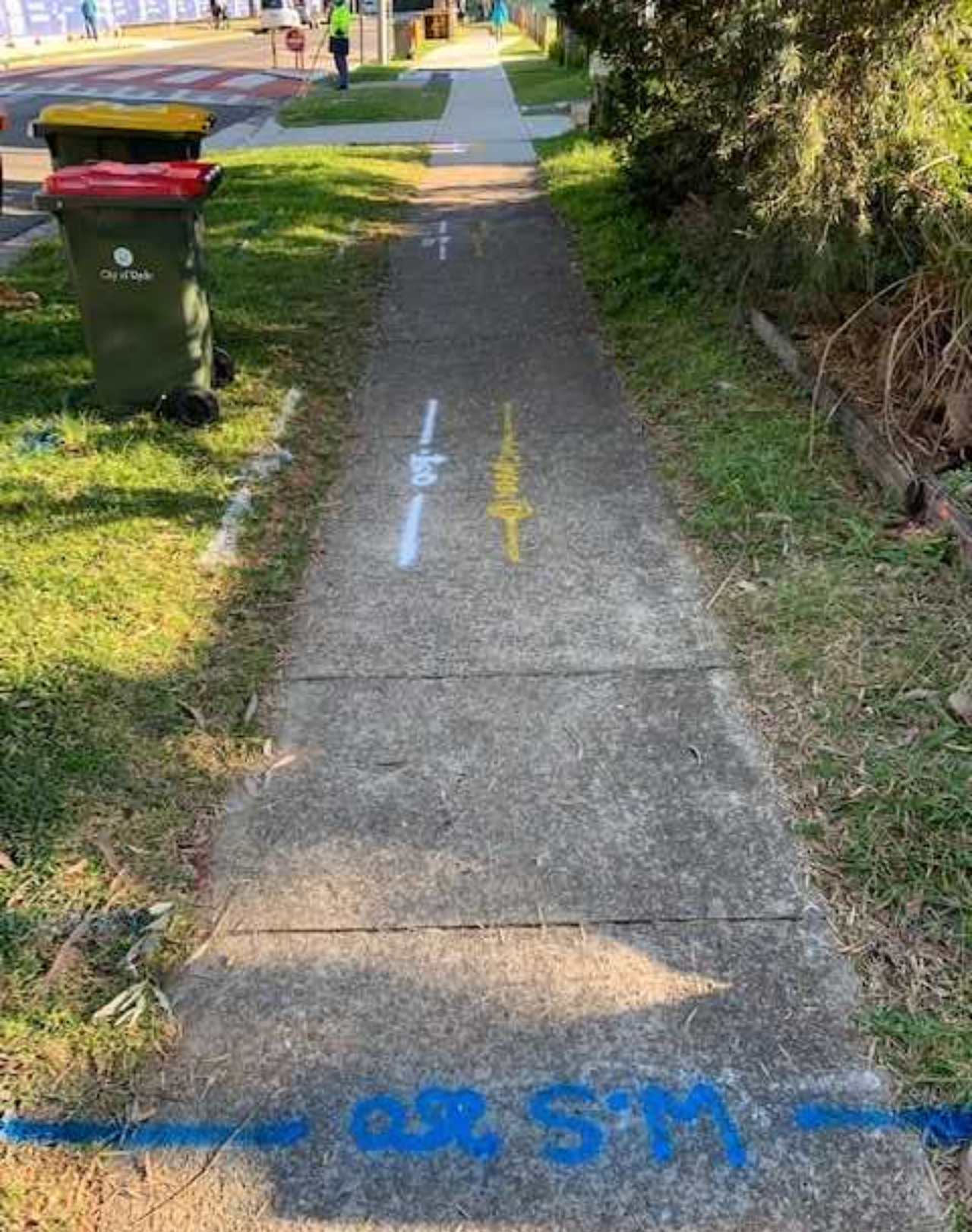
19. General Conditions of footpath Service location spray paint present. Small cracks in pavement