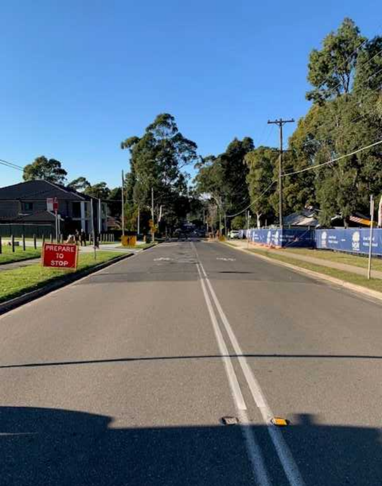
28b. General condition of Kent Road - South