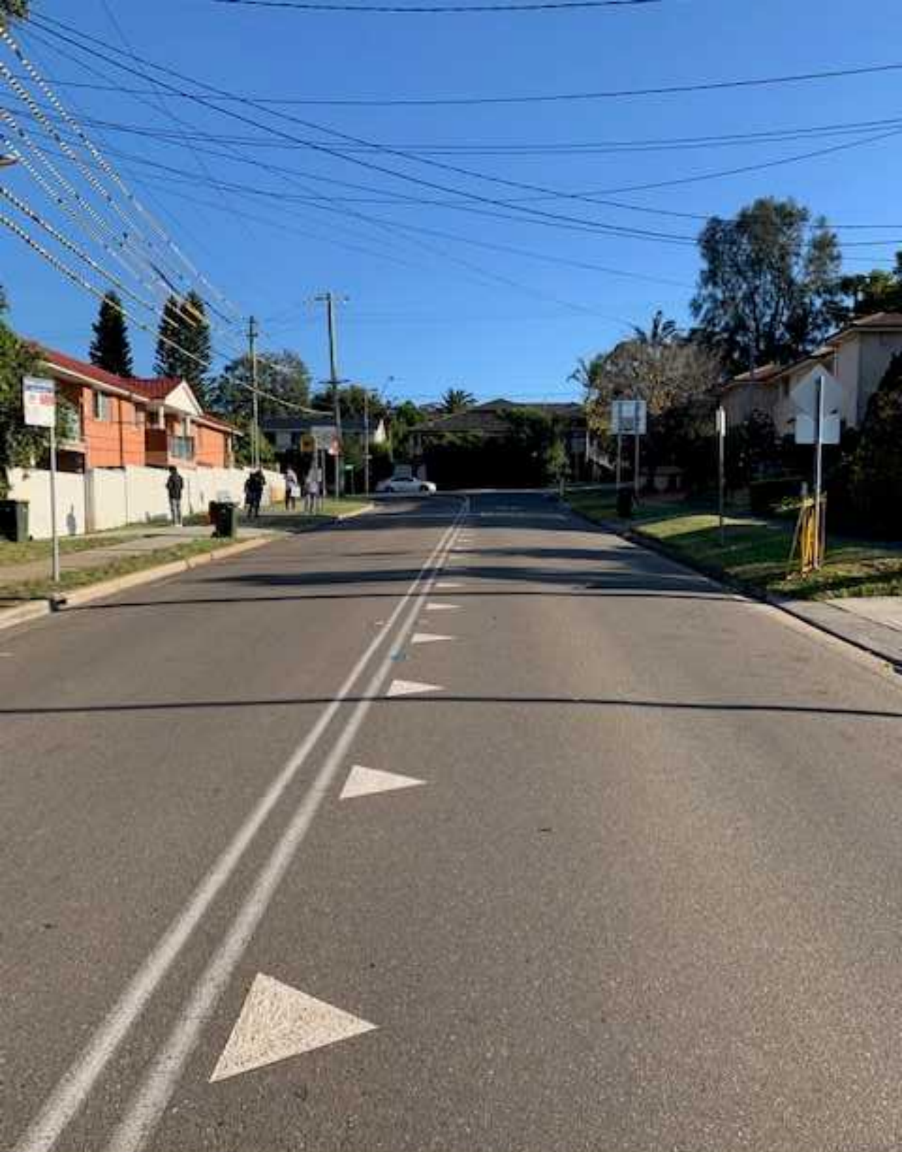
28a. General condition of Kent Road - North