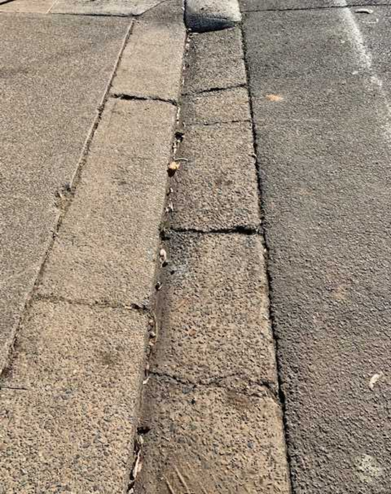
9b. General Conditions of Kerb and Gutter Multiple crack 1-15mm