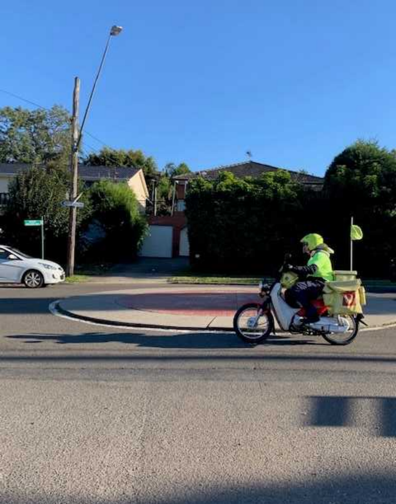
32. General Conditions of round about. Generally ok. Minor wear and tear