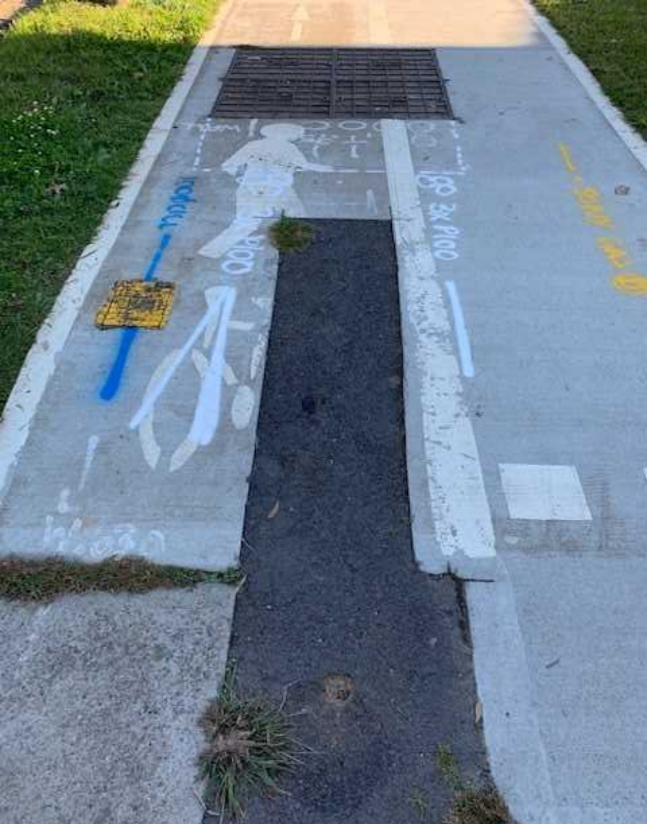
21. General Conditions of footpath (FIRE HYDRANT SERVICE) Service location spray paint present. Small cracks in pavement. Patches present