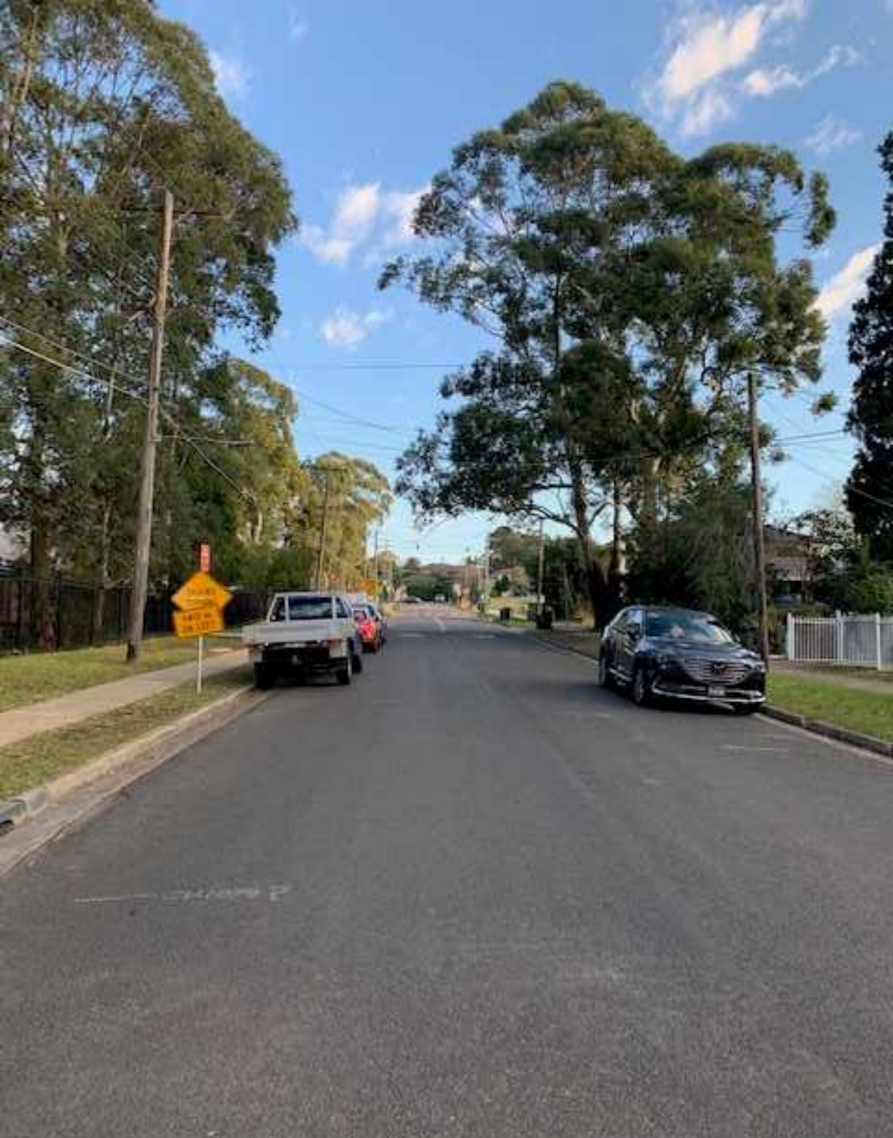
2. General Conditions of Kent Road - North