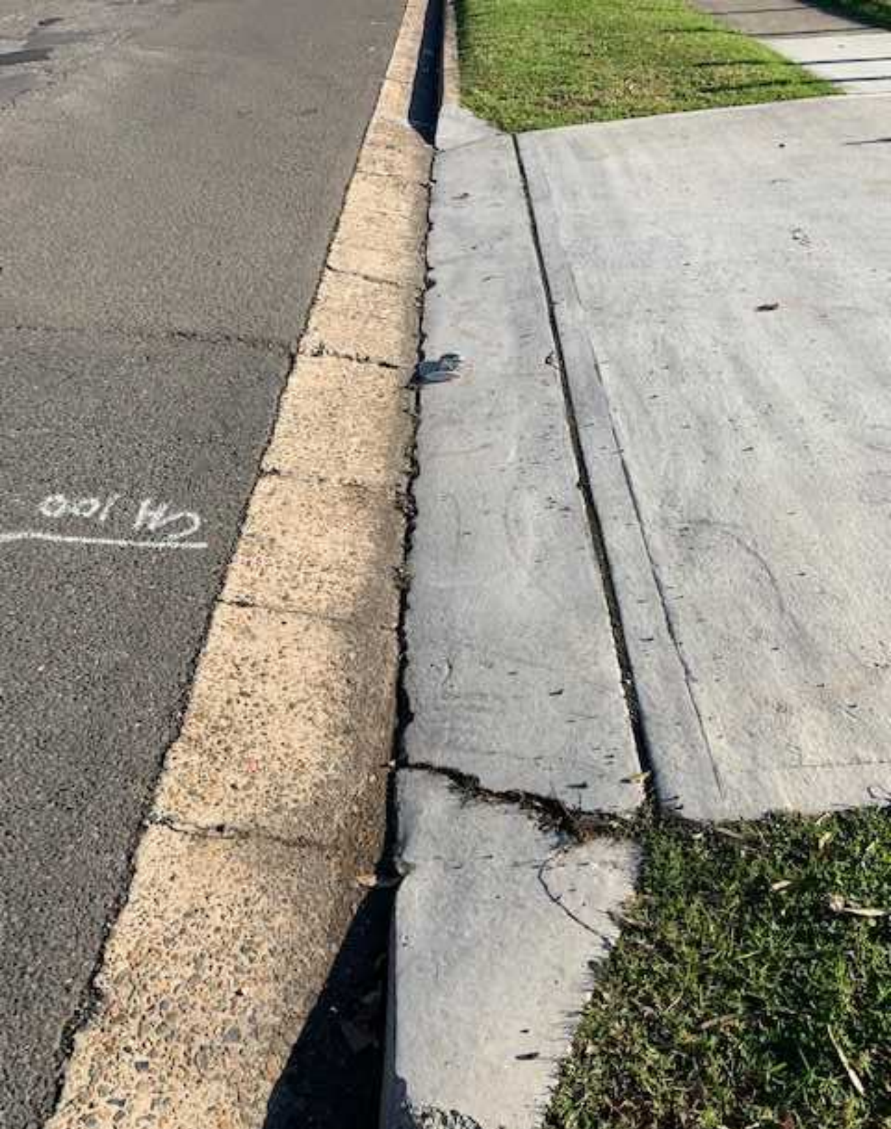
23. General Conditions of footpath and neighboring driveways Cracks in driveway 1-10mm. Concrete sinking present