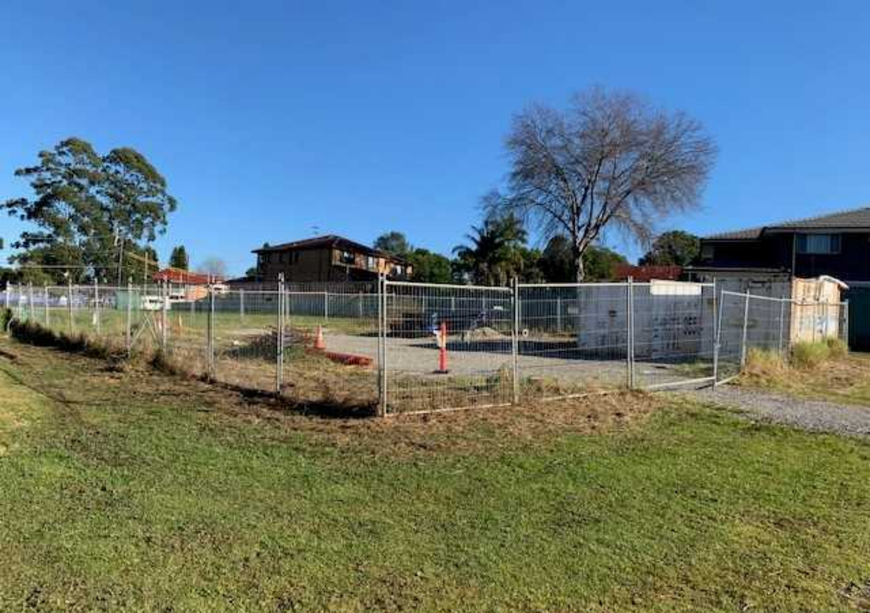
39. General condition of proposed construction parking area