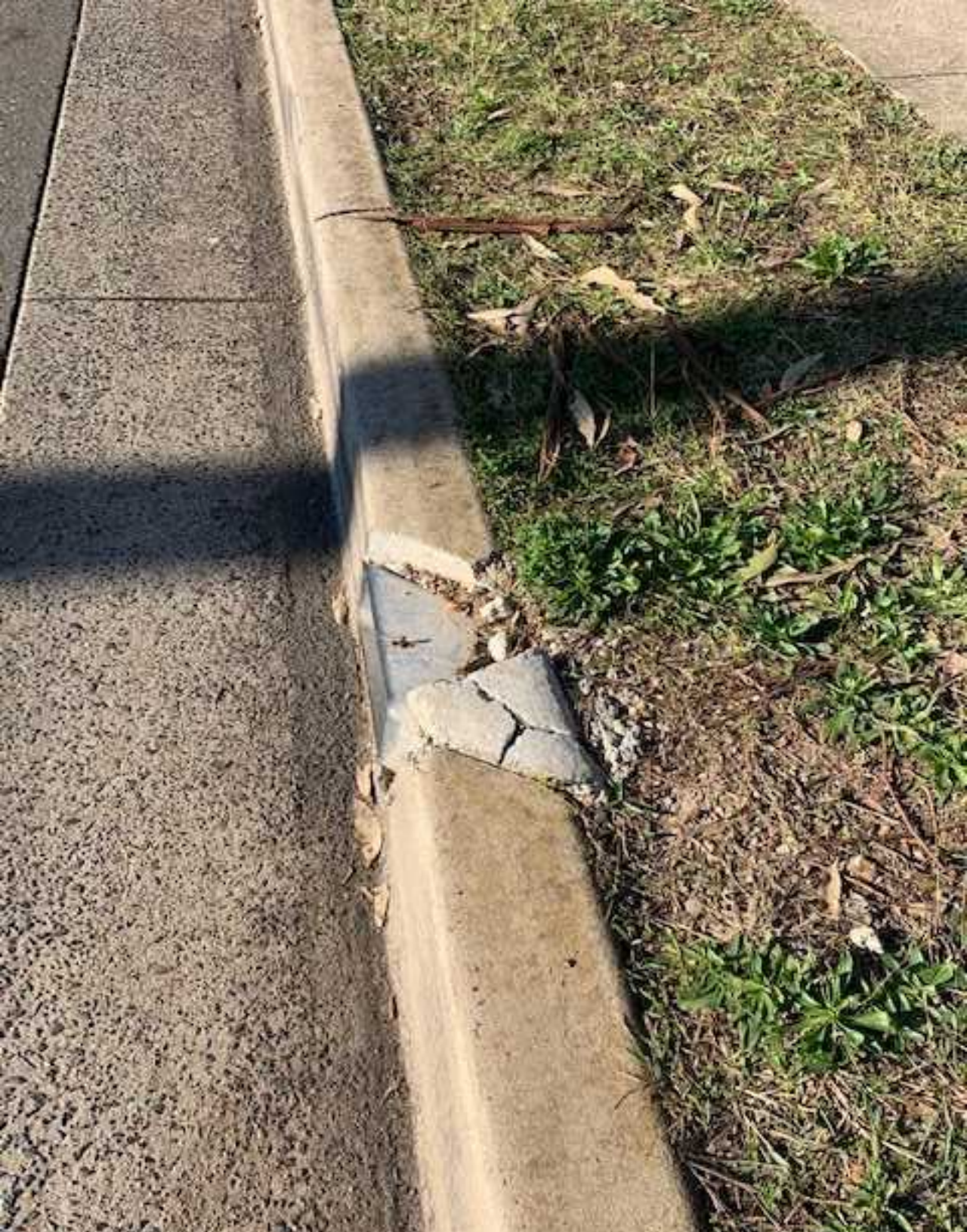
35. Broken concrete cover over drain