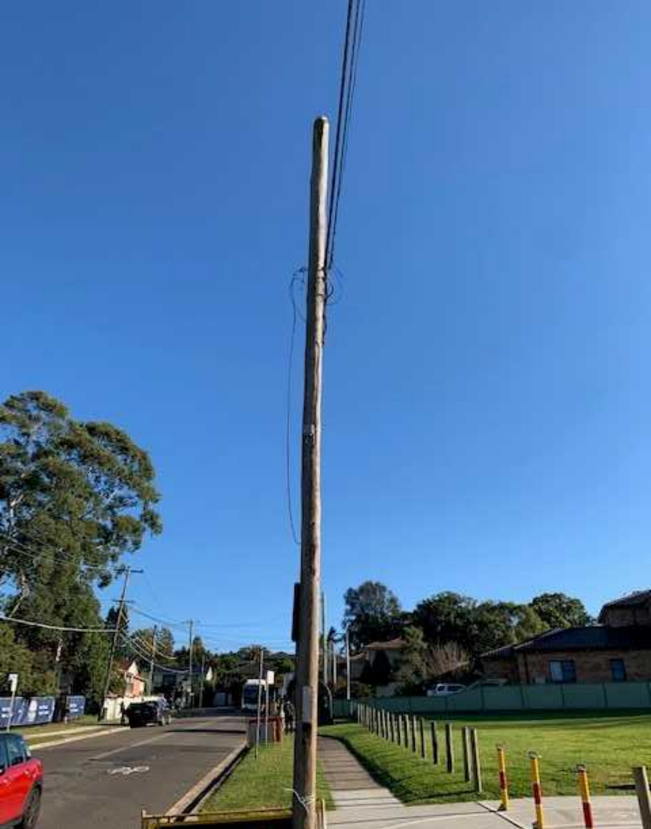
24. Wire hanging down from post.