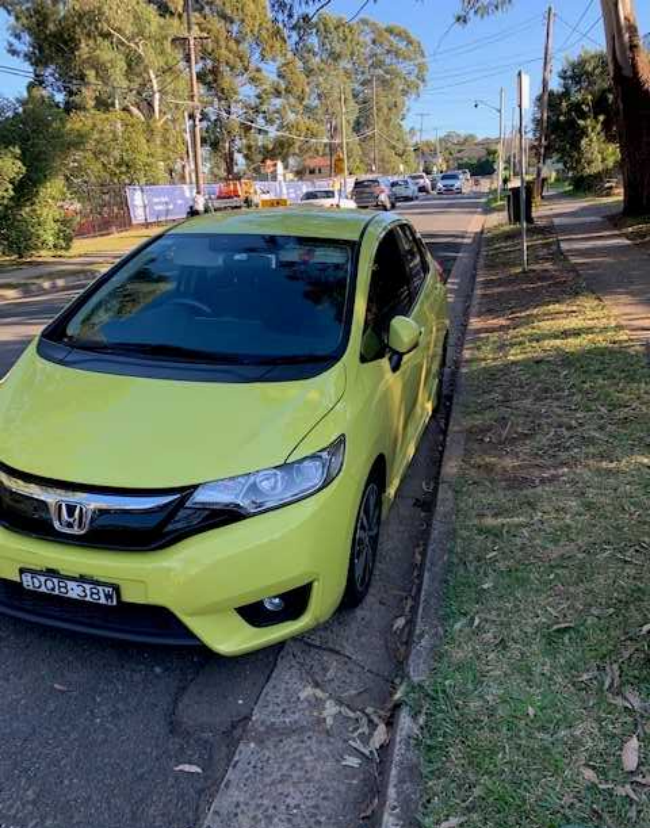
12. General Conditions of Kerb and gutter Multiple cracks in concrete pavement 1-20mm