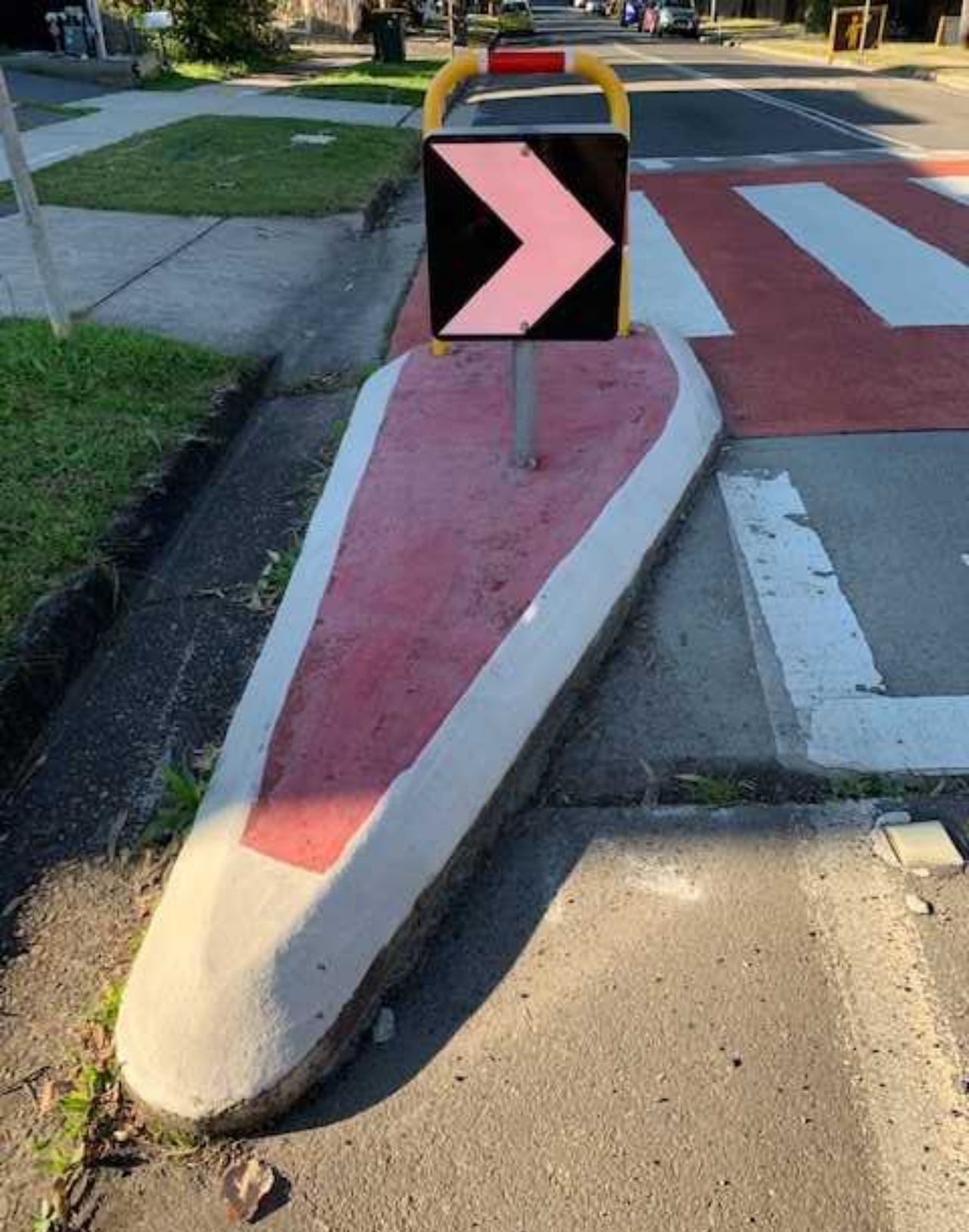
40. General Condition of existing pedestrian crossing