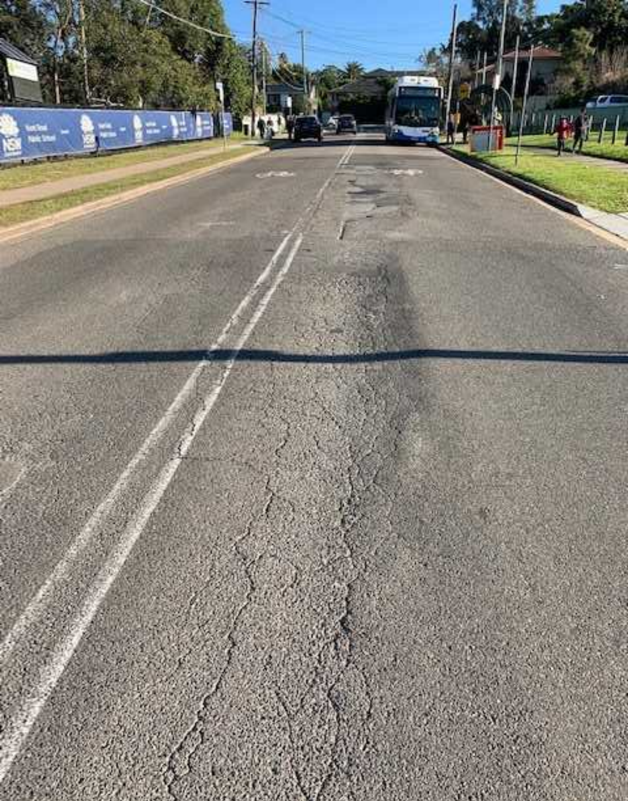
25. General Conditions of Kent Road - North Severe sinking and cracking. Multiple asphalt patches present