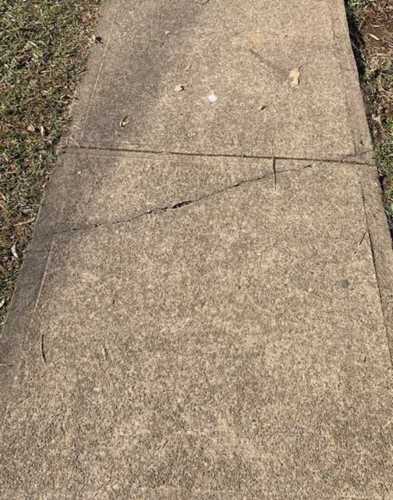
34f. General Conditions of footpath Multiple cracks in concrete pavement 1-10mm. Concrete sinking present