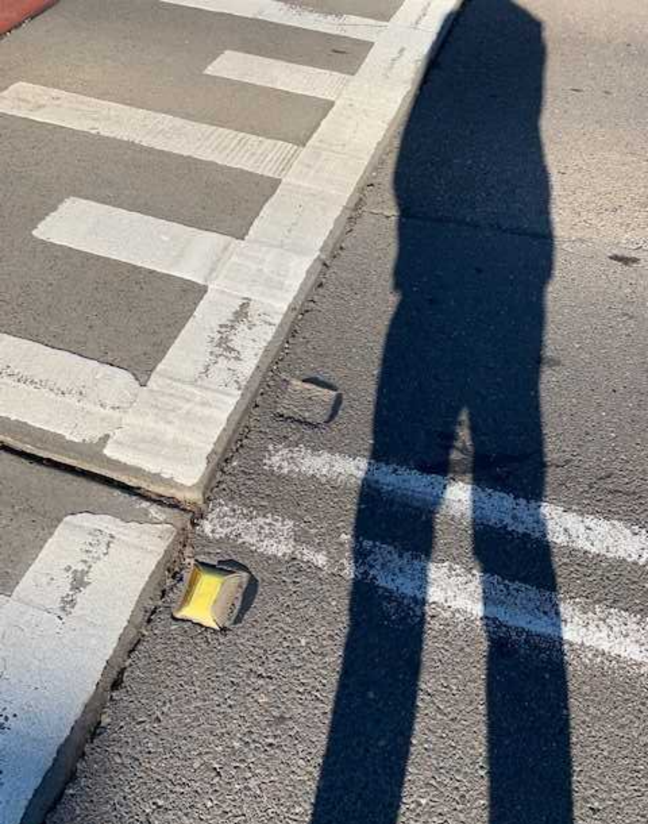
40. General Condition of existing pedestrian crossing Cats eye missing