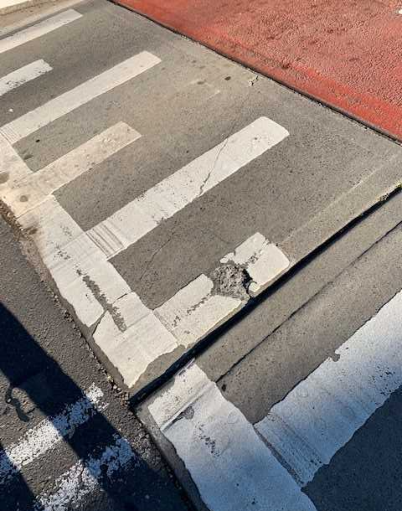
40. General Condition of existing pedestrian crossing Multiple cracks 1-10mm. Concrete chipped