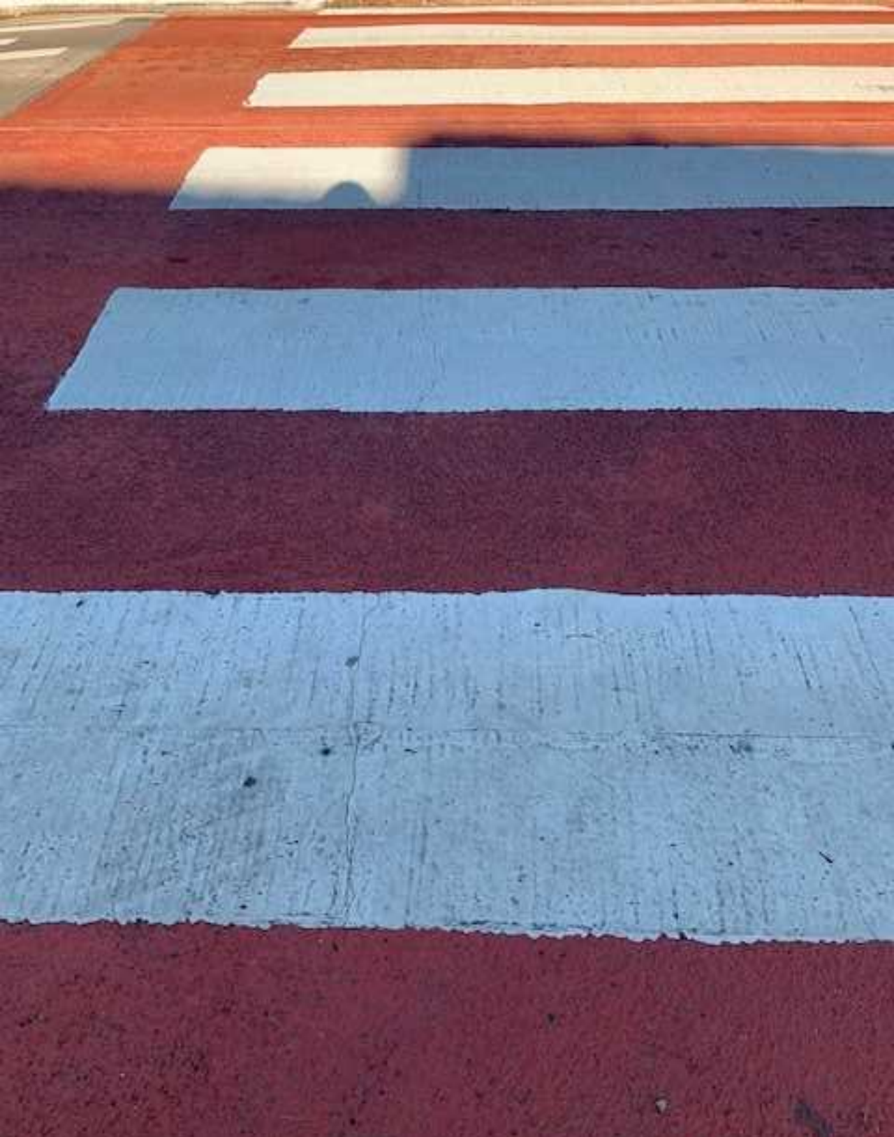
40. General Condition of existing pedestrian crossing Multiple cracks 1-10mm