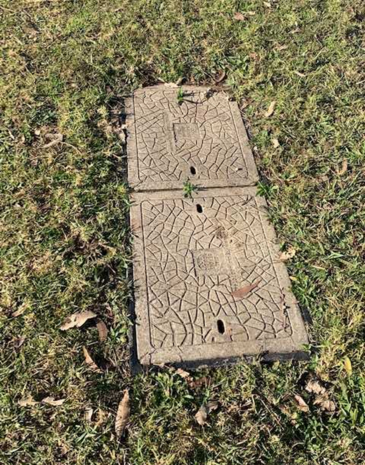
38. Communication pits. Not to be affected