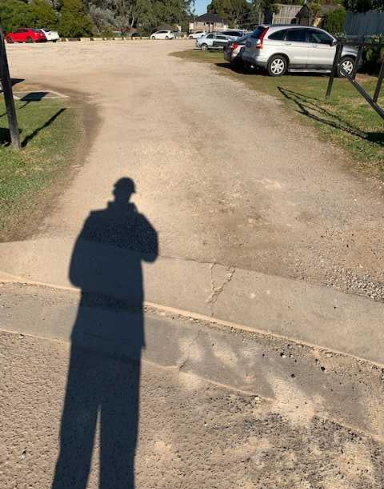
39. General Conditions of proposed construction parking area