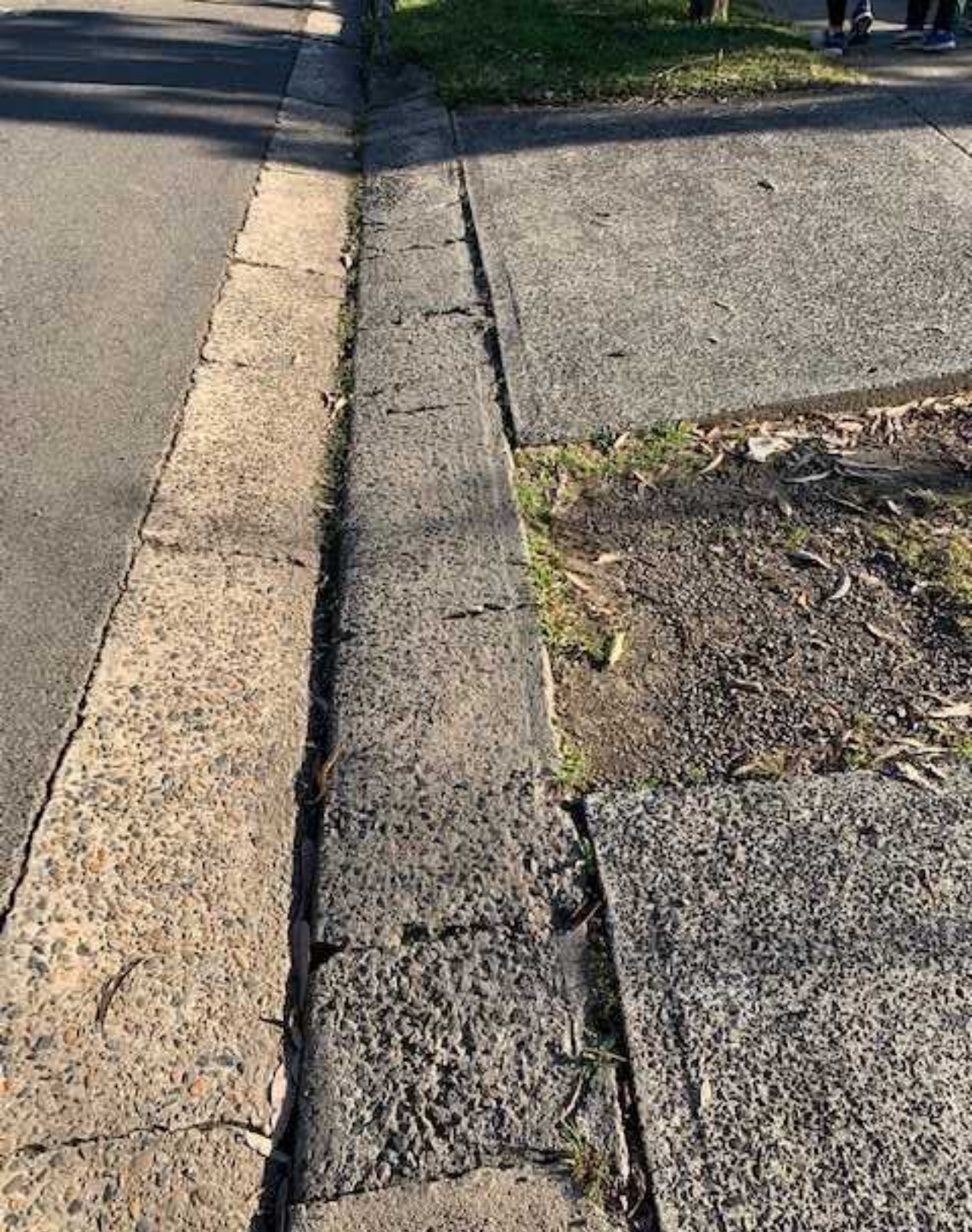
16. General Conditions of Kerb and Gutter / Neighboring driveways Multiple cracks 1-20mm. Concrete sinking present