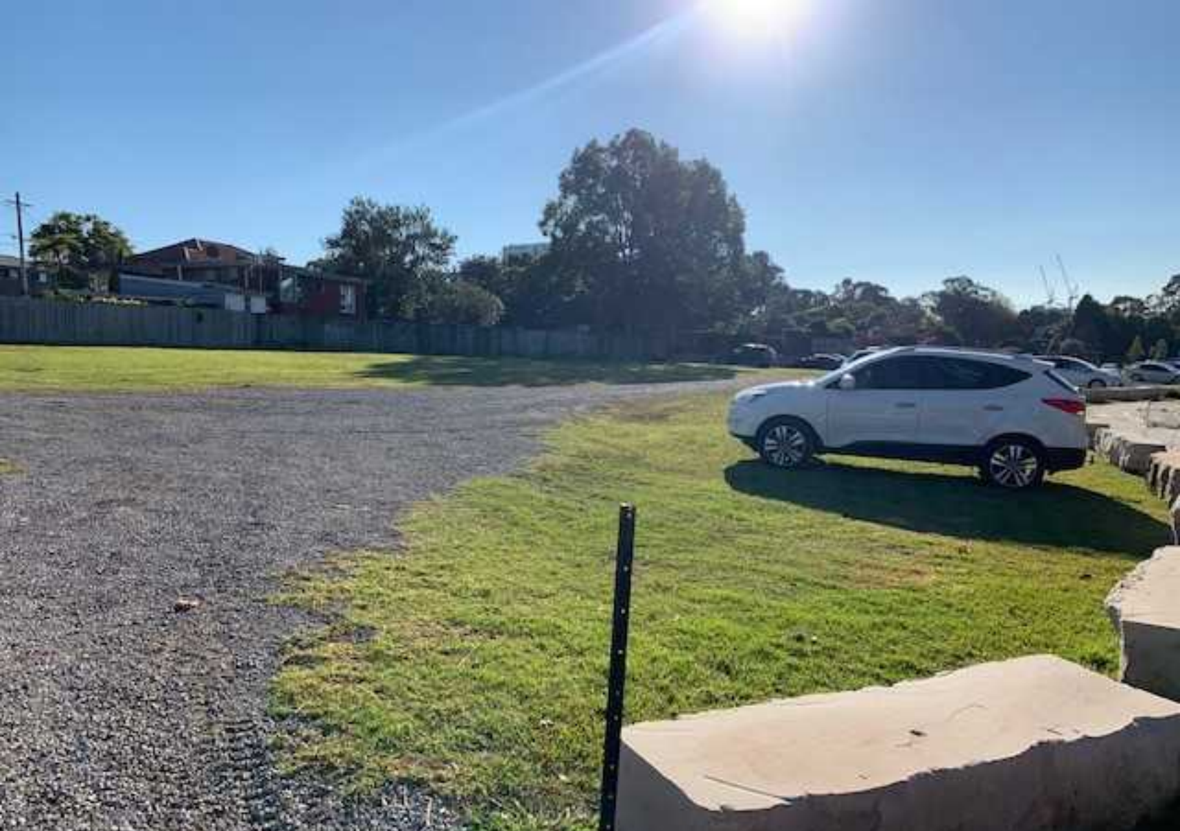
39. General condition of proposed construction parking area