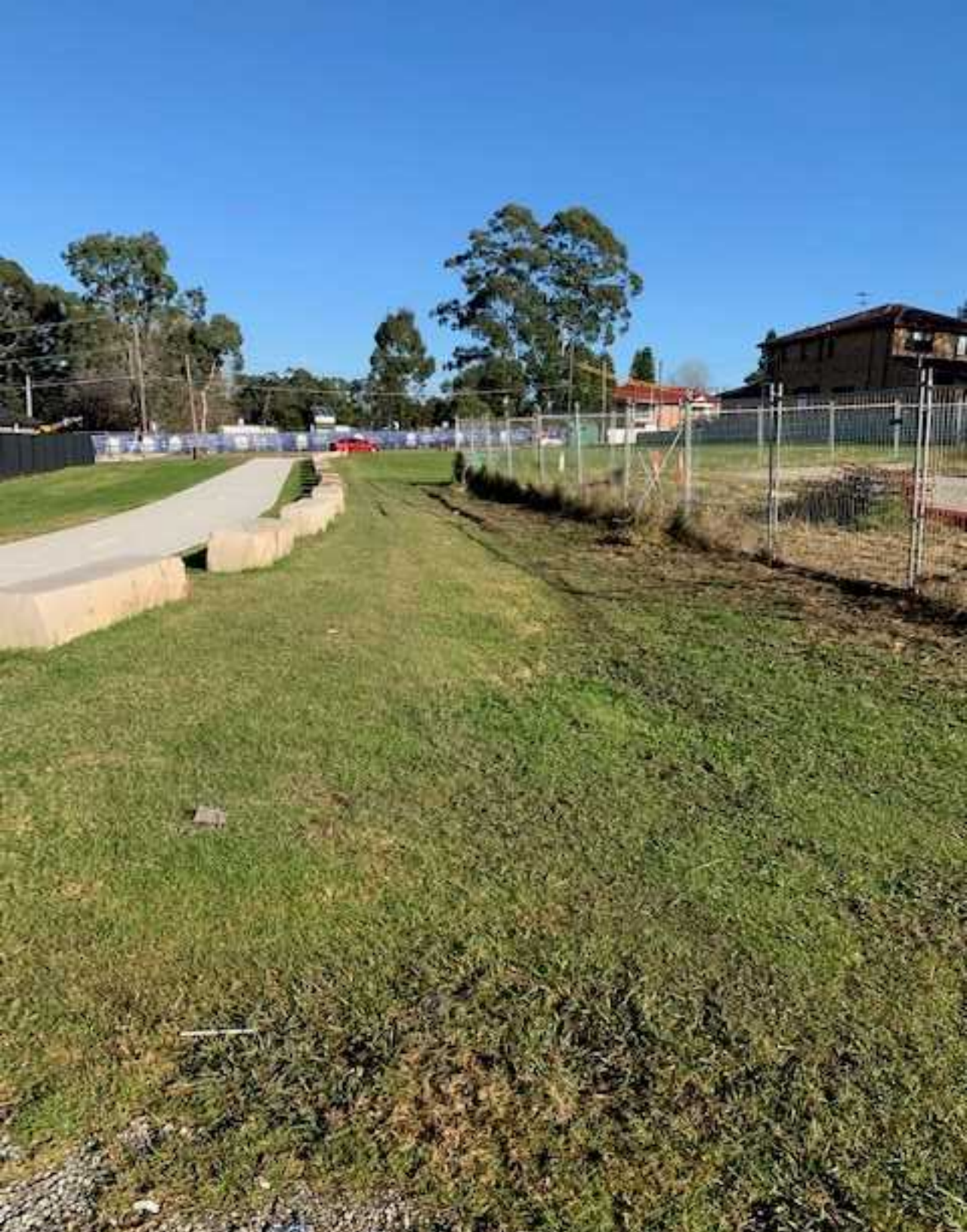
39. General Conditions of proposed construction parking area