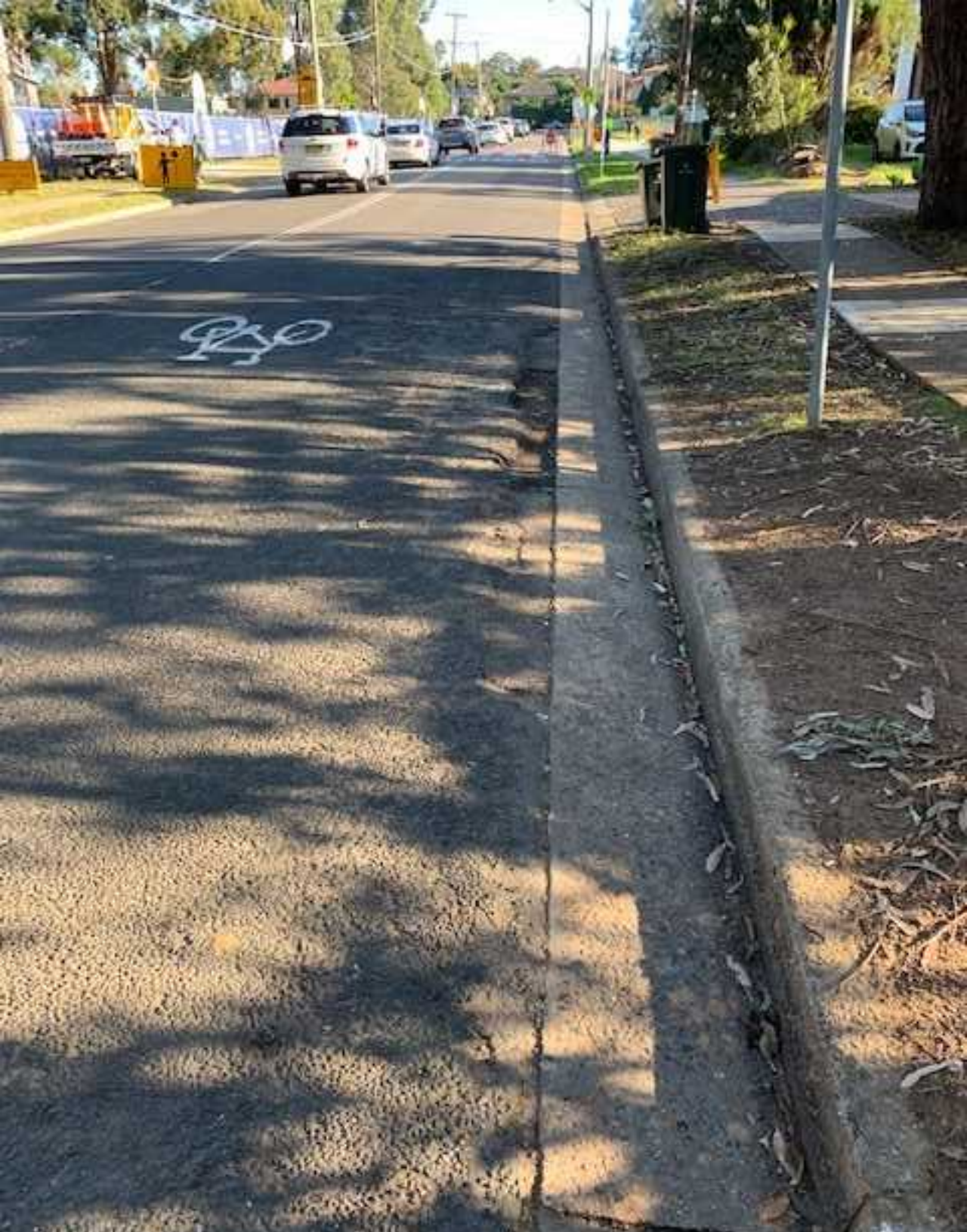
13. General Conditions of Kerb and gutter Multiple cracks 1-20mm. Medium- Large pot holes in asphalt