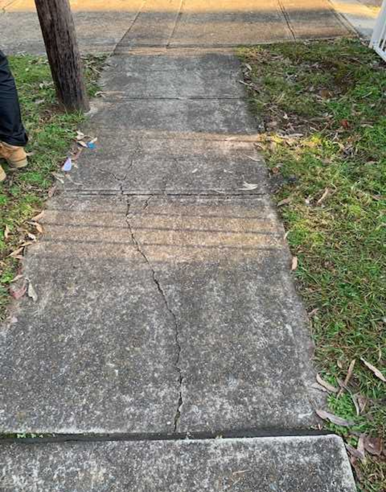
11. General Conditions of footpath Multiple cracks in concrete pavement 1-10mm. Concrete sinking present