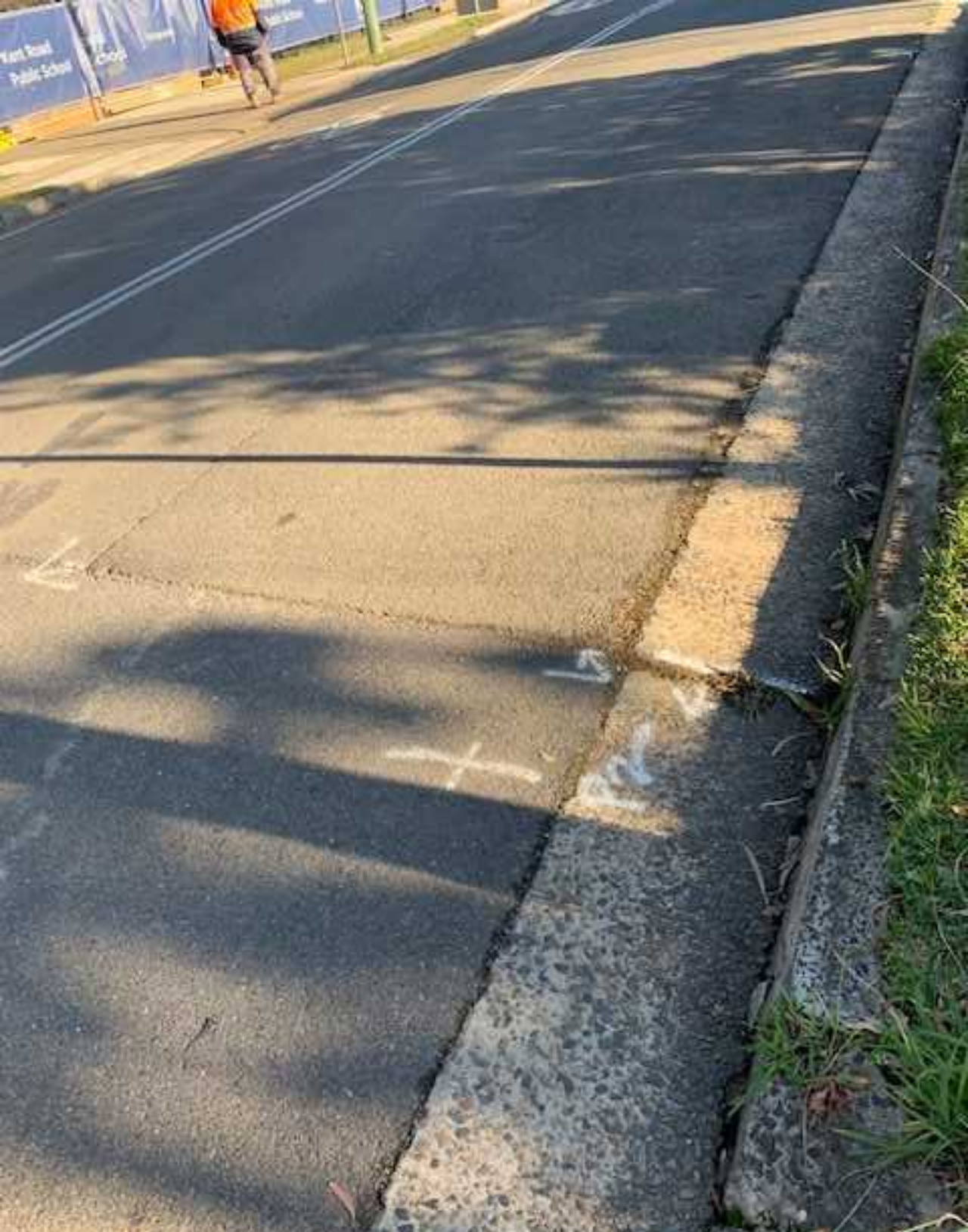
22. General Conditions of Kerb and Gutter Multiple cracks 1-20mm. Concrete sinking present. Spray paint visible