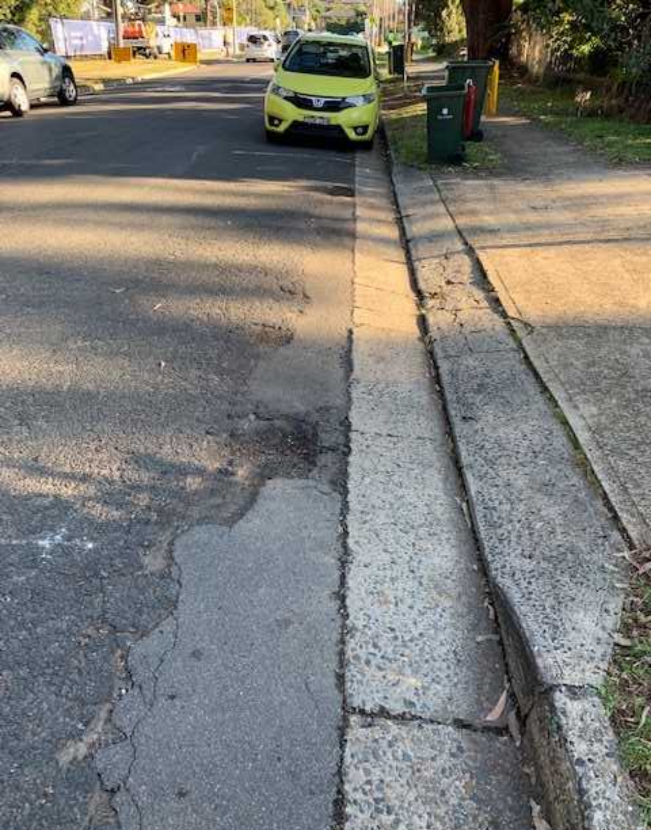
10. General Conditions of Ker, Gutter and neighboring driveways

Multiple cracks 1-20mm. Medium- Large pot holes in asphalt. Concrete sinking present