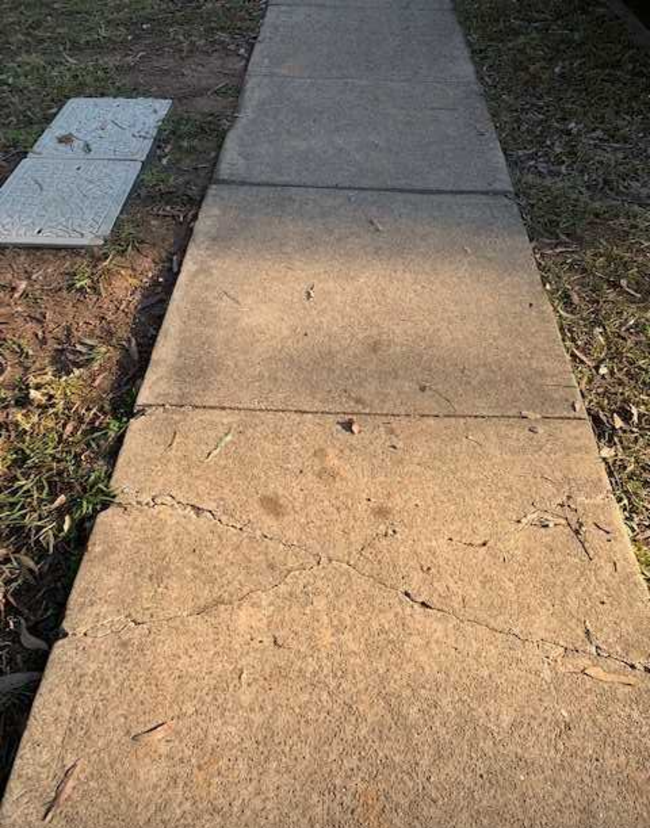
7. General Conditions of footpath Multiple cracks in concrete pavement 1-10mm