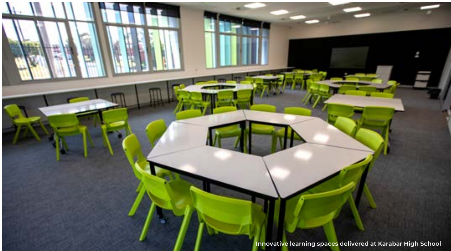
Innovative learning spaces delivered at Karabar High School