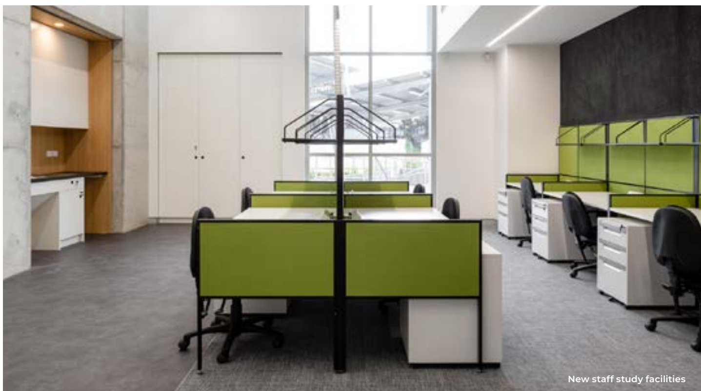
New staff study facilities