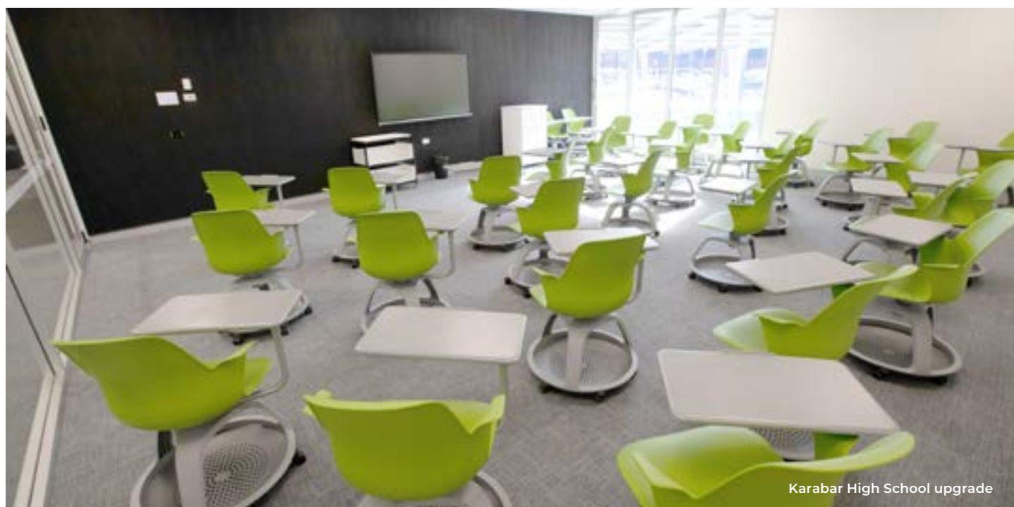
Karabar High School upgrade