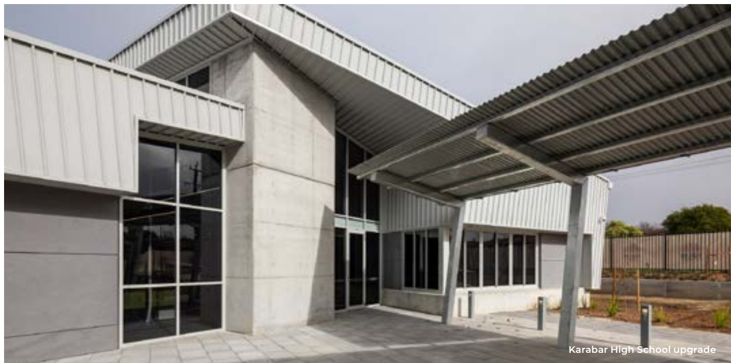
Karabar High School upgrade