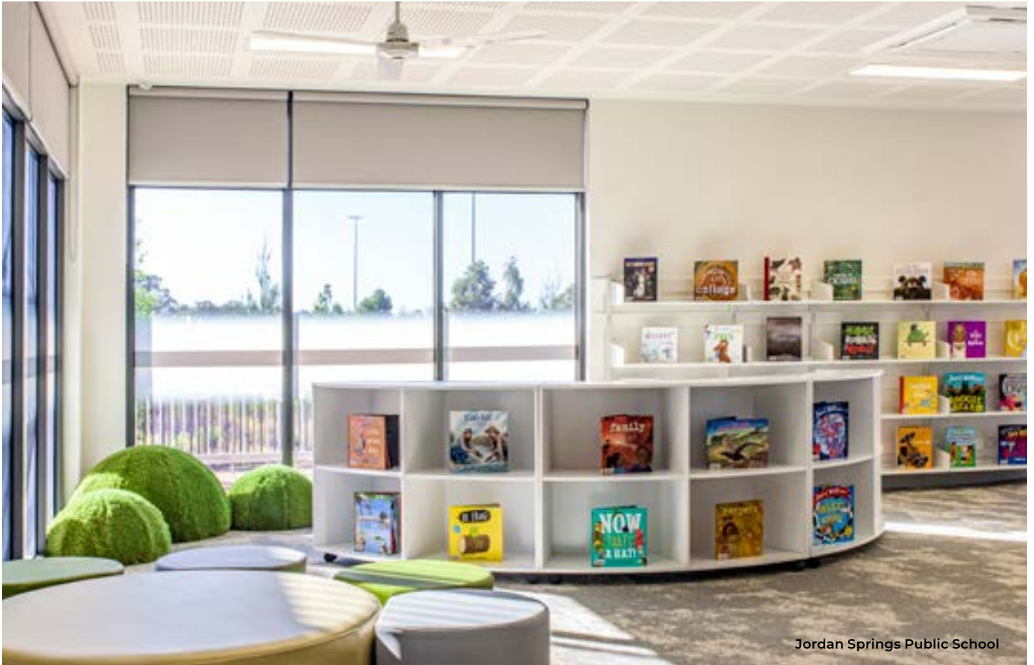
Jordan Springs Public School