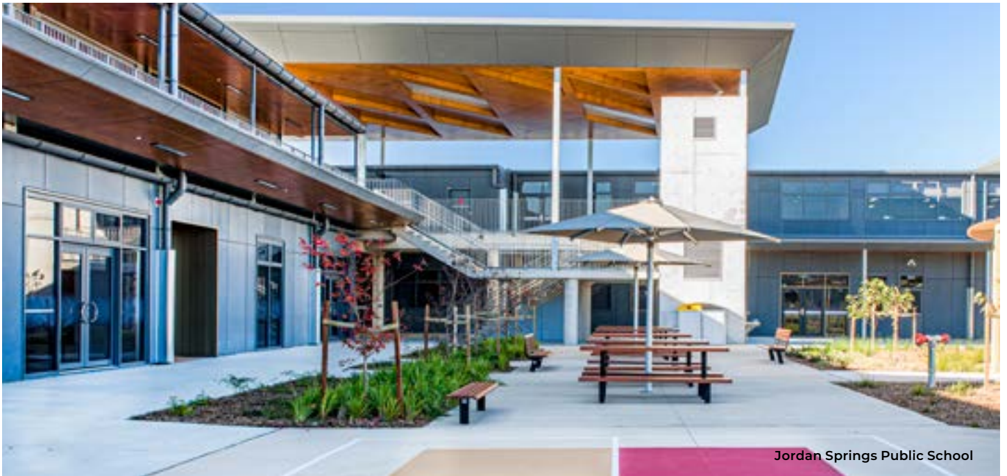
Jordan Springs Public School