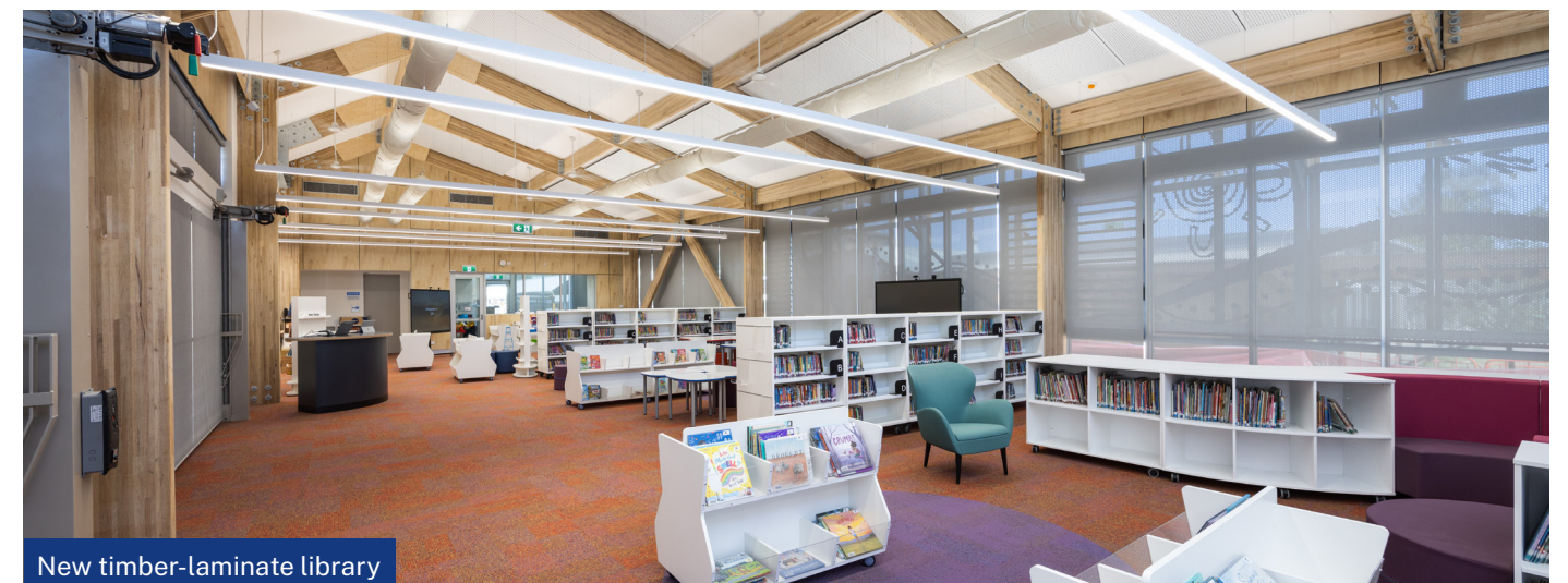
New timber-laminate library