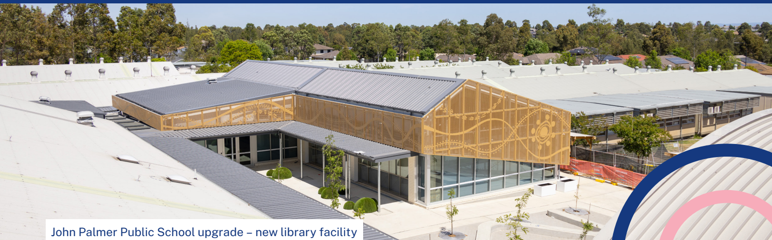
John Palmer Public School upgrade – new library facility