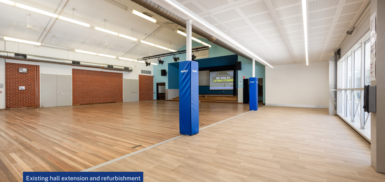
Existing hall extension and refurbishment