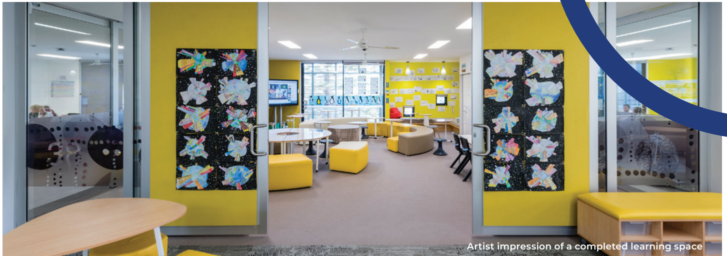
Artist impression of a completed learning space