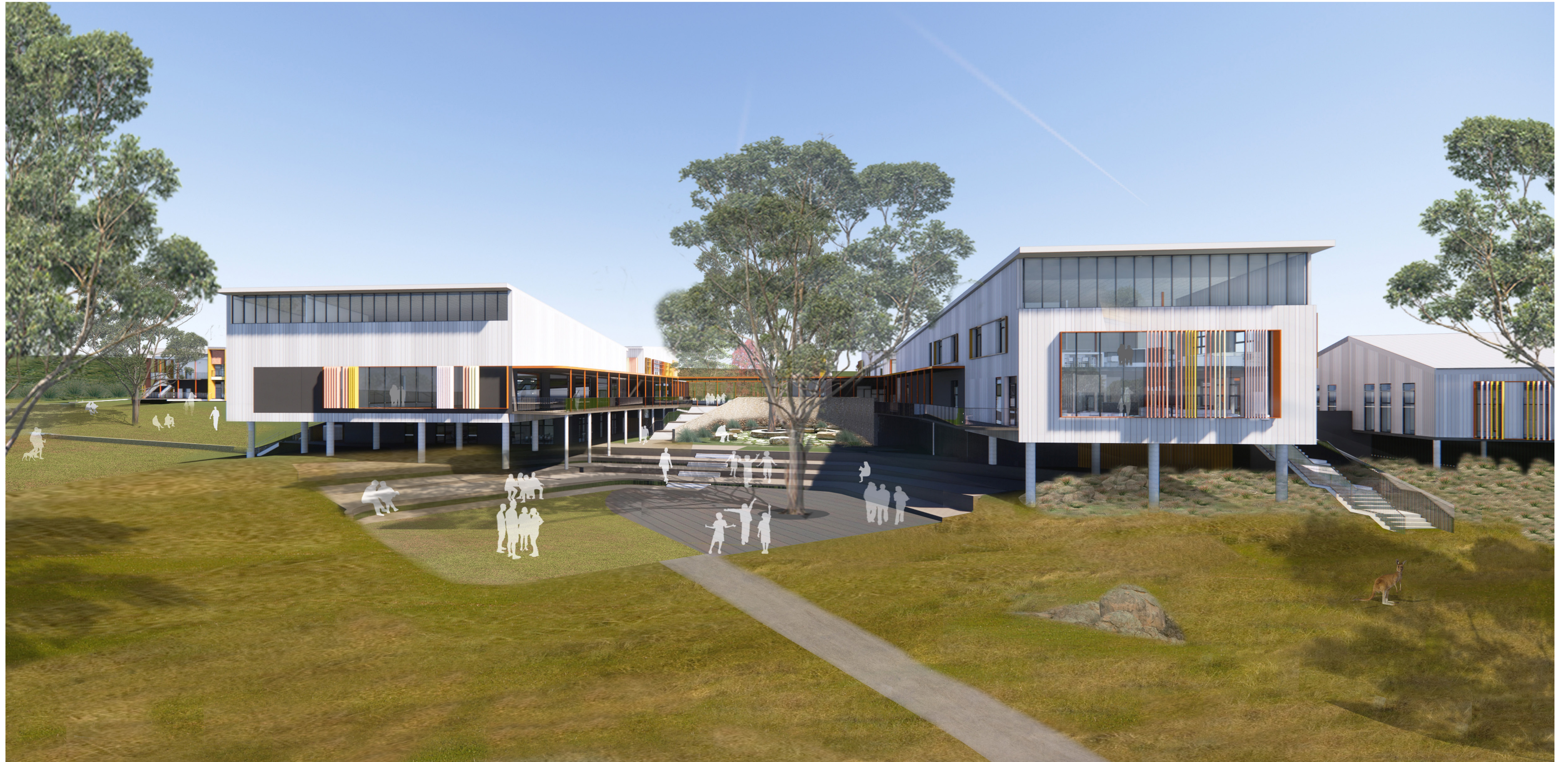
View from the amphitheatre looking to the entry