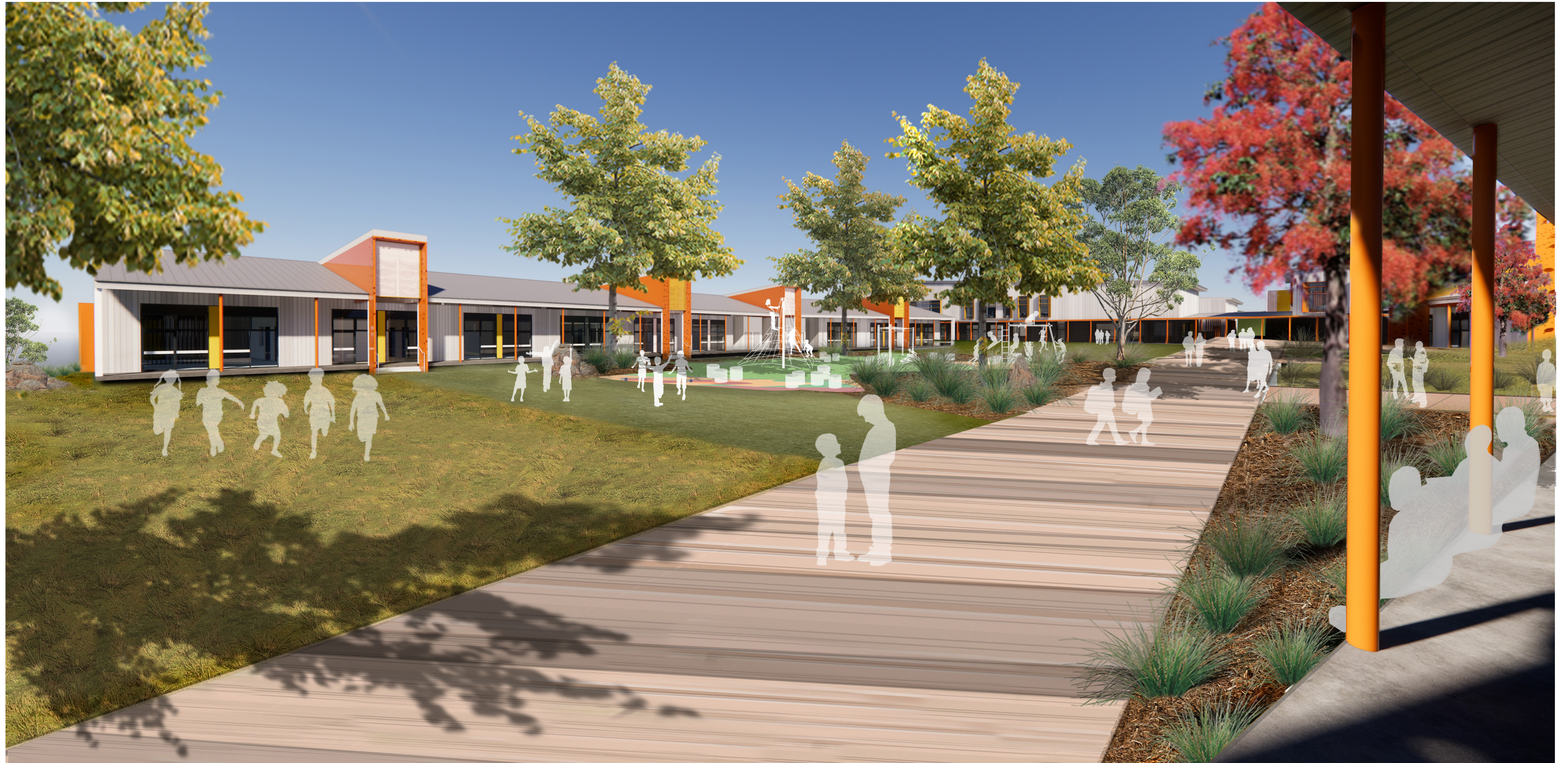
Primary School outdoor play area