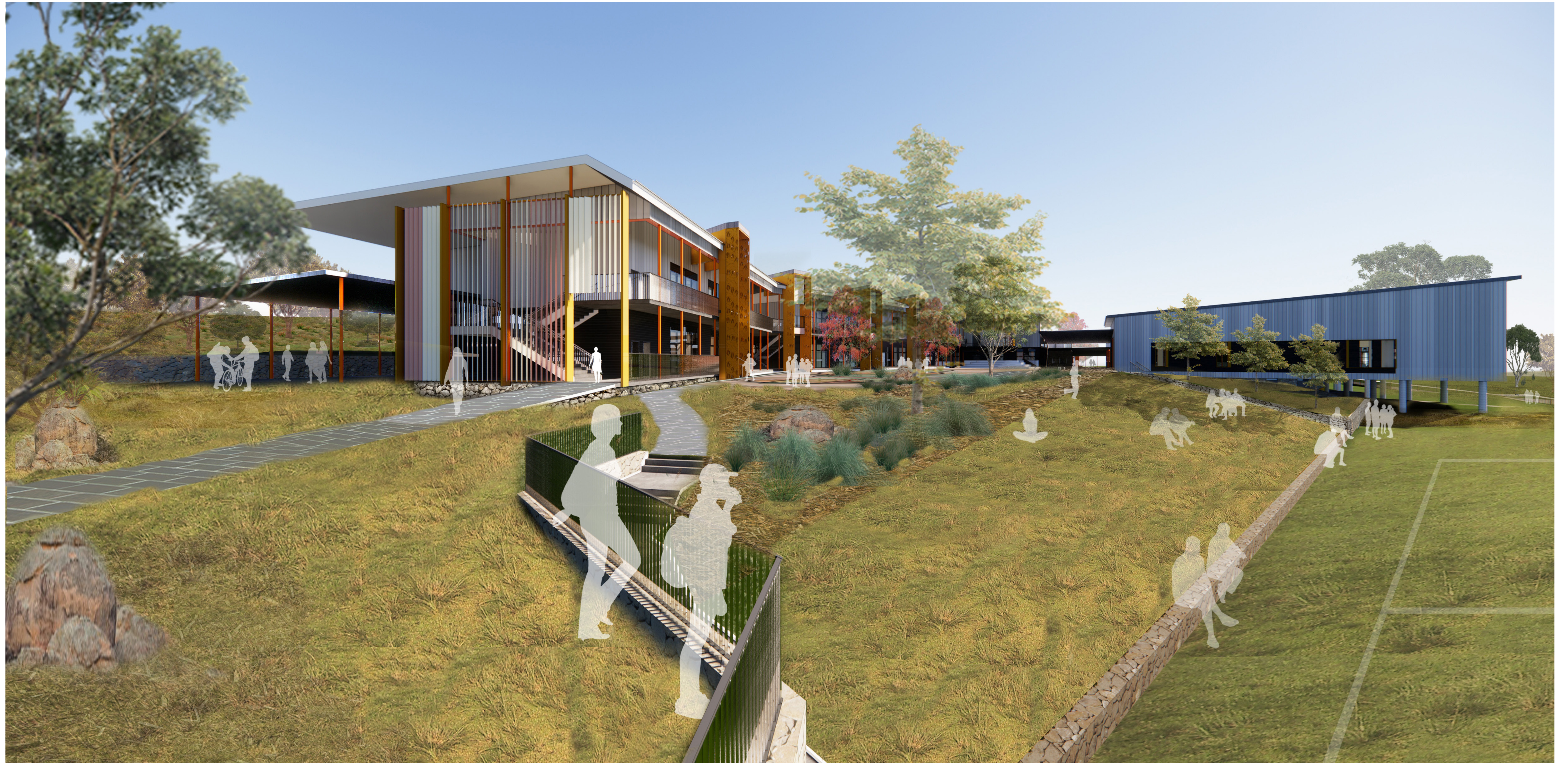
High School outdoor area