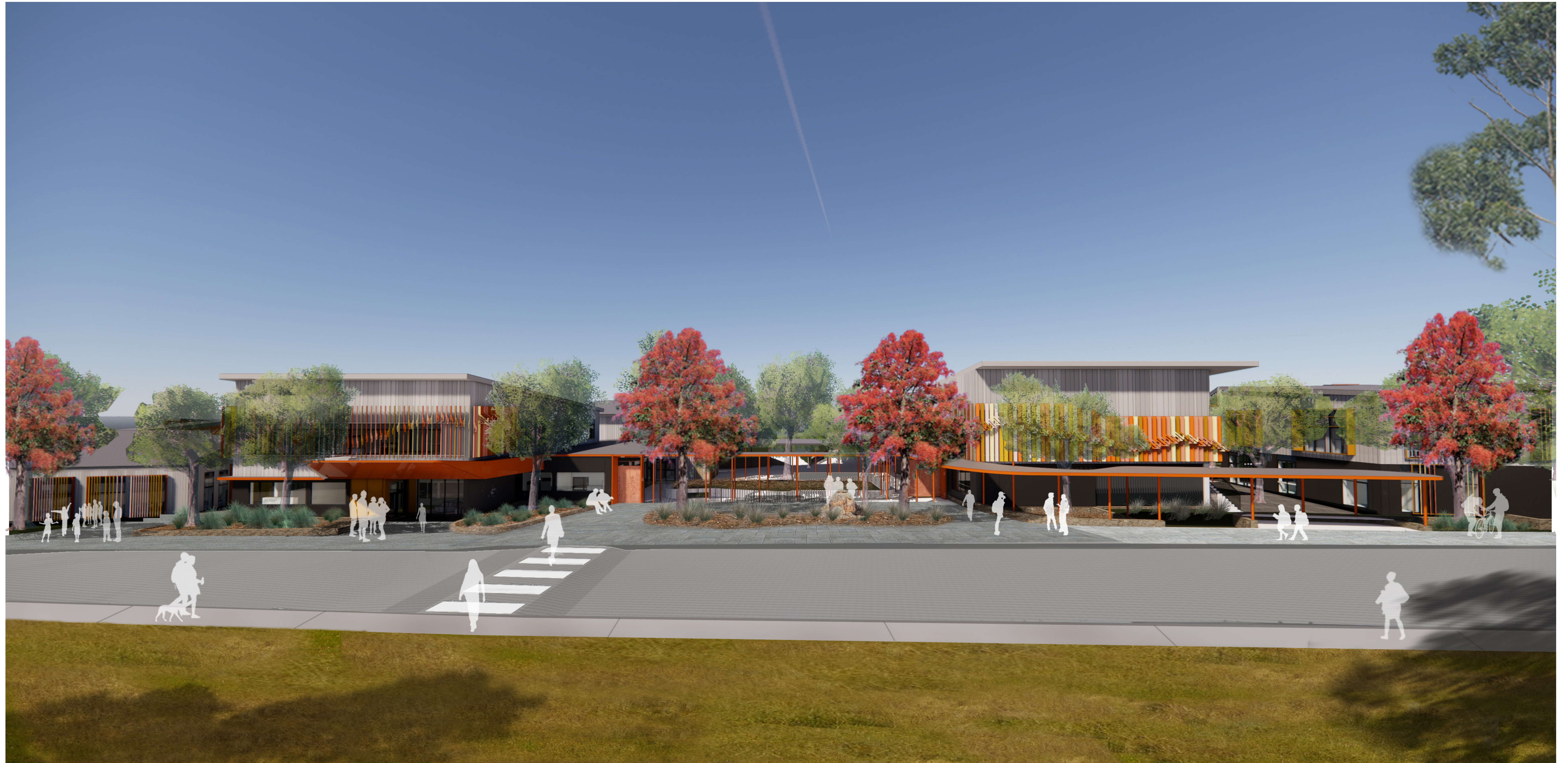
View of school entry