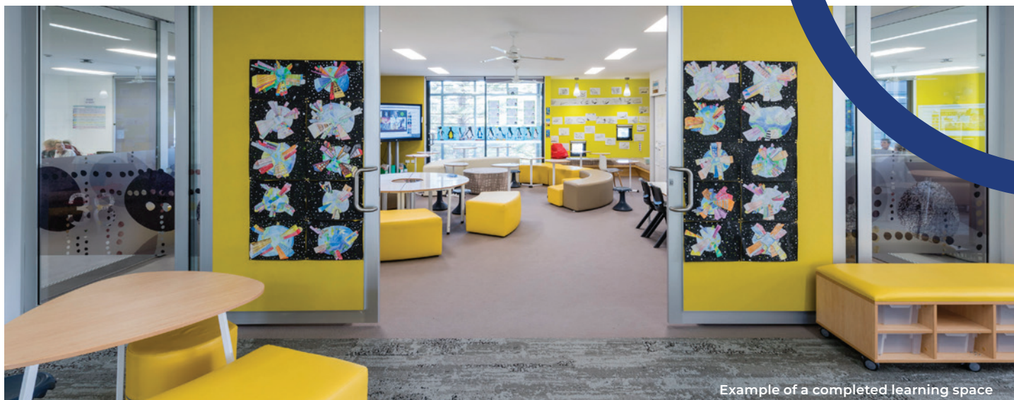
Example of a completed learning space