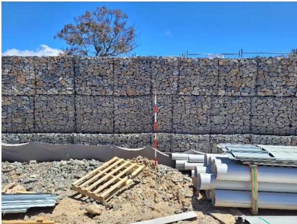
Plate 1 The vicinity of Jindabyne Campus AFT 2 showing the substantial ground surface disturbance from development on 28 November 2022.