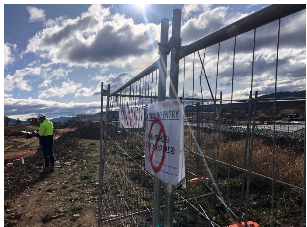
Plate 6 View of fencing of no-go area near AFT 2 looking north by HY 23/06/2023.