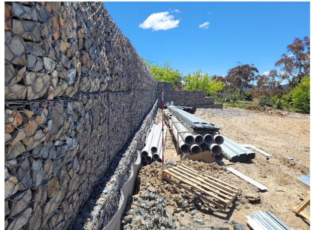
Plate 2 In the vicinity of Jindabyne Campus AFT 2 which has been impacted by development 28 November 2022.