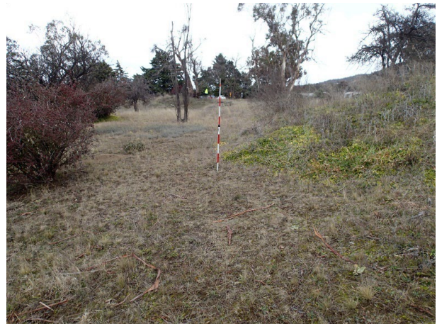
Plate 4 Jindabyne Campus AFT 2 when recorded on 25 June 2021.