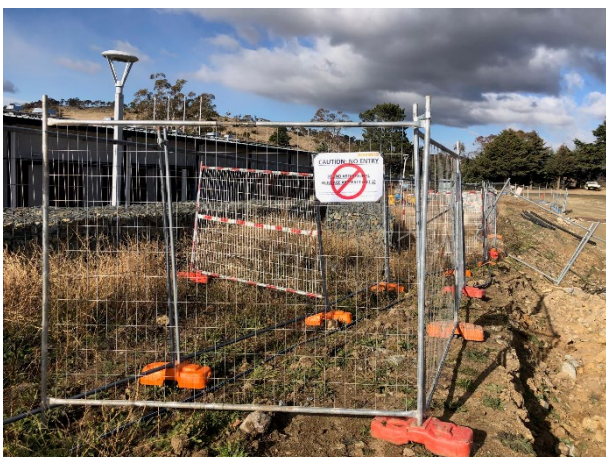
Plate 5 View of fencing of no-go area near AFT 2 looking south provided by HY 23/06/2023.