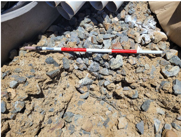
Plate 3 Ground surface in the vicinity of Jindabyne Campus AFT 2 which has been impacted by development 28 November 2022.