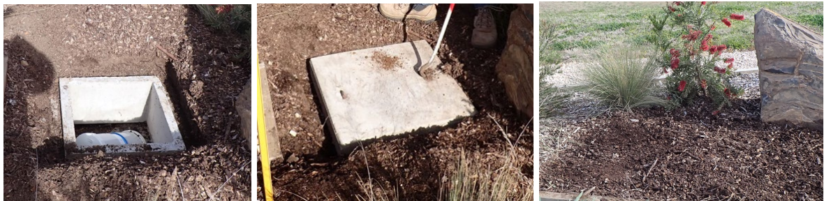
Plate 1. Image of the sequence of possible reburial option within the grounds of the Project which shows a concrete box and lid which can be incorporated into a garden area.

It may be possible post construction, during the landscaping phase of works for the Project, to determine with the RAPs and Principal a suitable location to install a small concrete box (with or without an open base) which can be sealed over with a concrete lid for the long term storage of cultural material within the Project Area. This location would be incorporated into a garden bed surrounding by plantings of native vegetation and may include a plaque or information board providing acknowledgement of Country. These measures would need to be considered and discussed with the RAPs to ensure their agreement. The images below show one possibility incorporation of such an option for reburial of cultural material within the Project area. This option would ensure that into the future there is a location within the school grounds which can be used for the long term storage of cultural material that won't be impacted by future works.