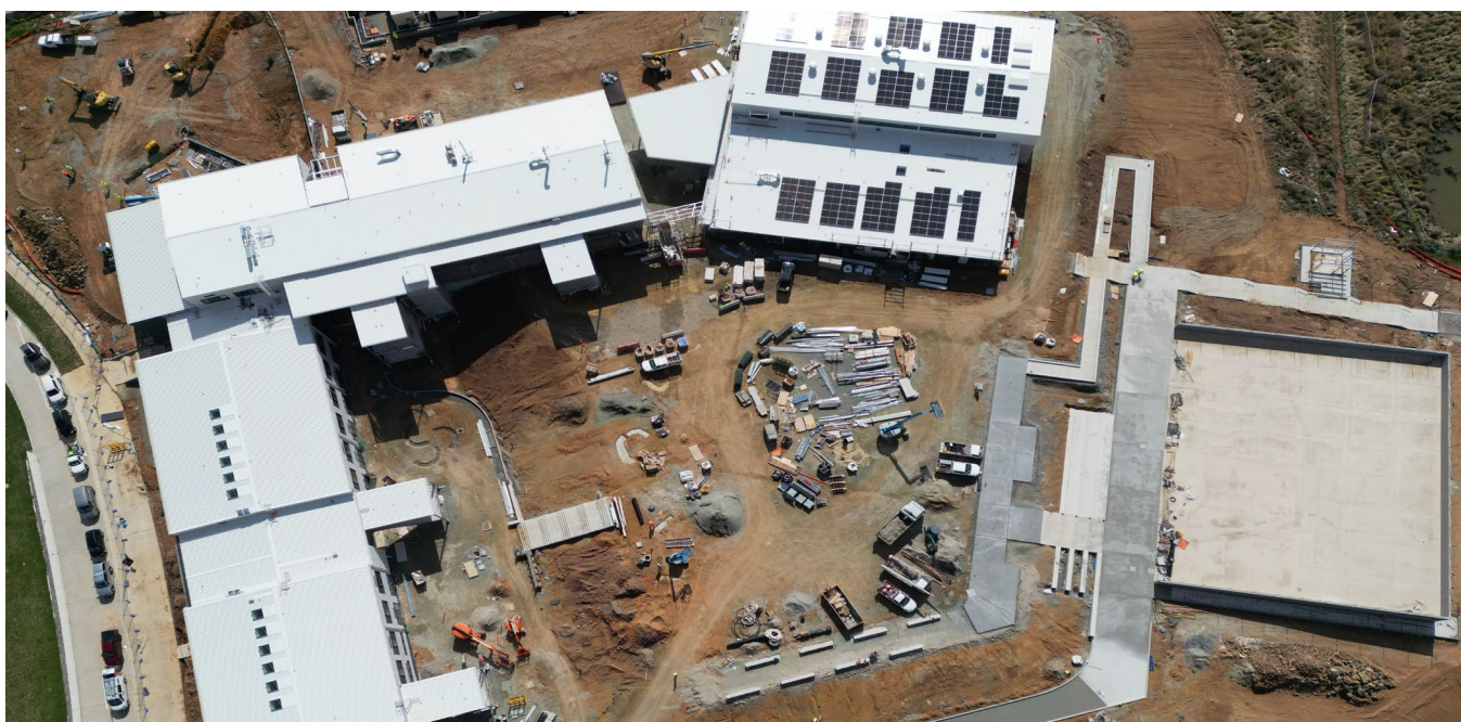
Drone photo of Jerrabomberra High School under construction

The image below shows the school (from left to right) Block A, Block B, Block C and the sports courts.