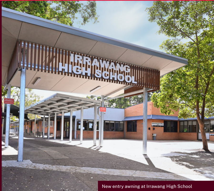
New entry awning at Irrawang High School