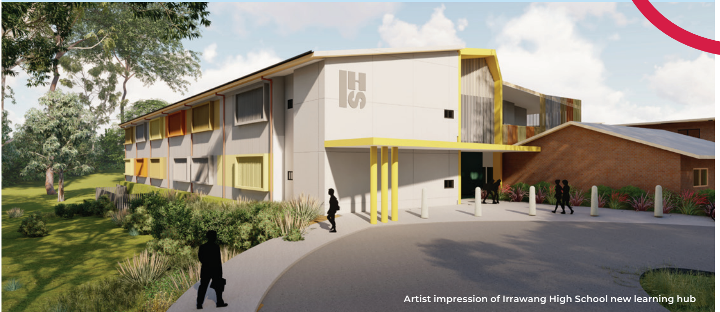
Artist impression of Irrawang High School new learning hub