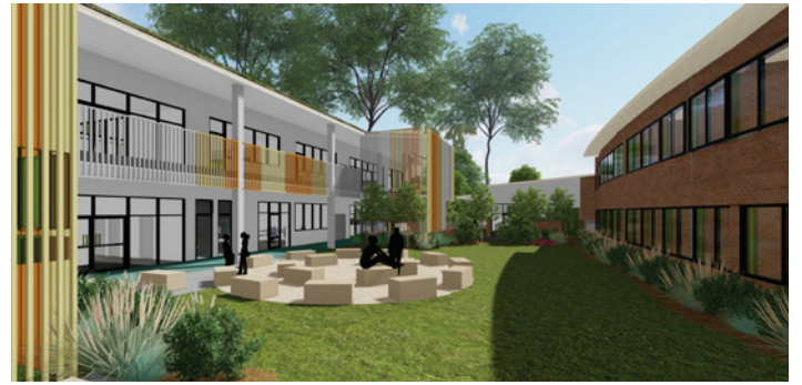
Artist impressions of Irrawang High School