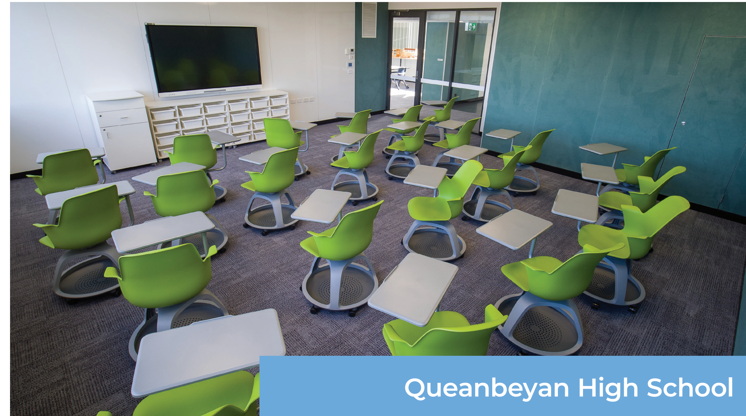
Queanbeyan High School