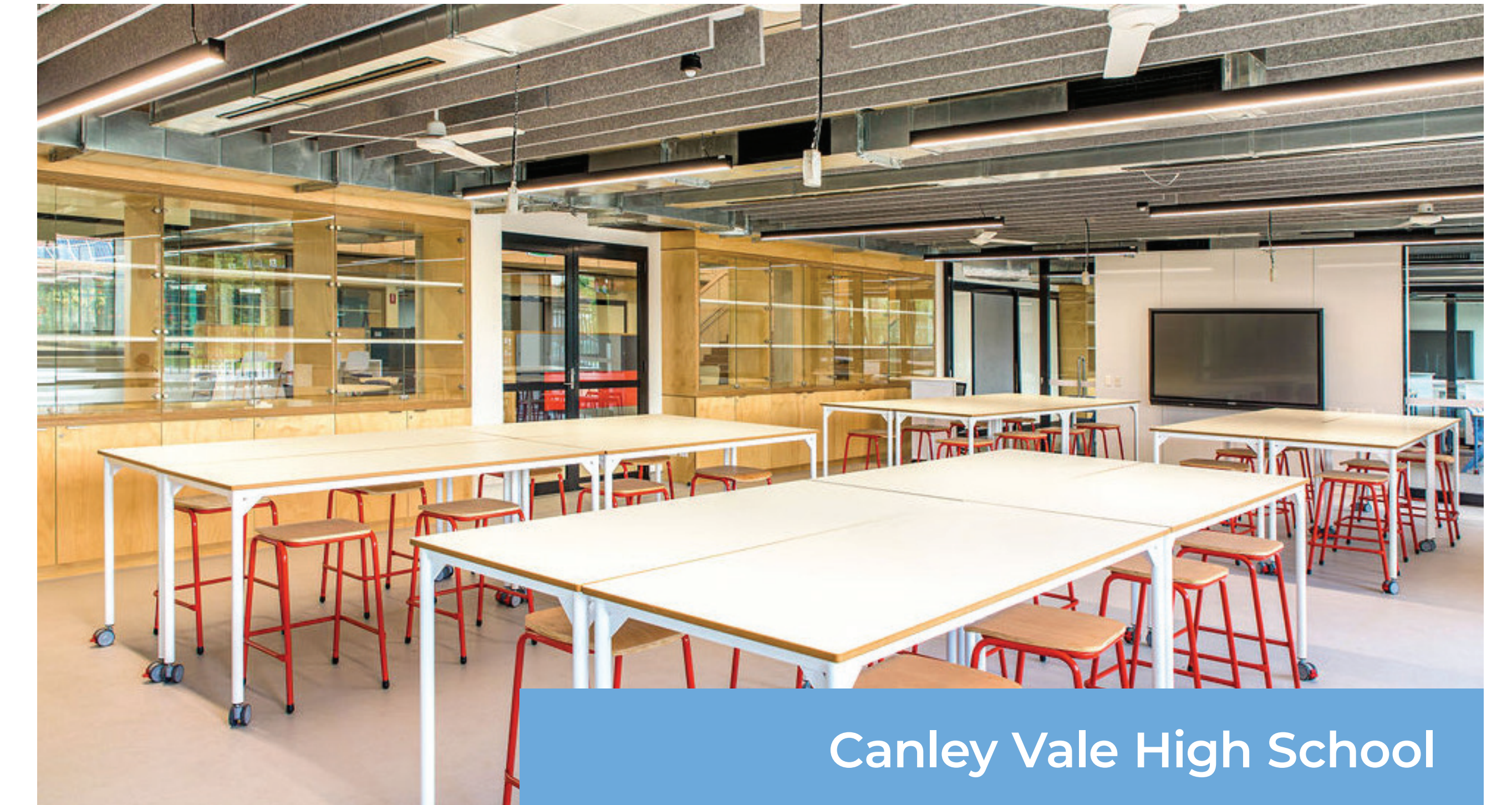
Canley Vale High School