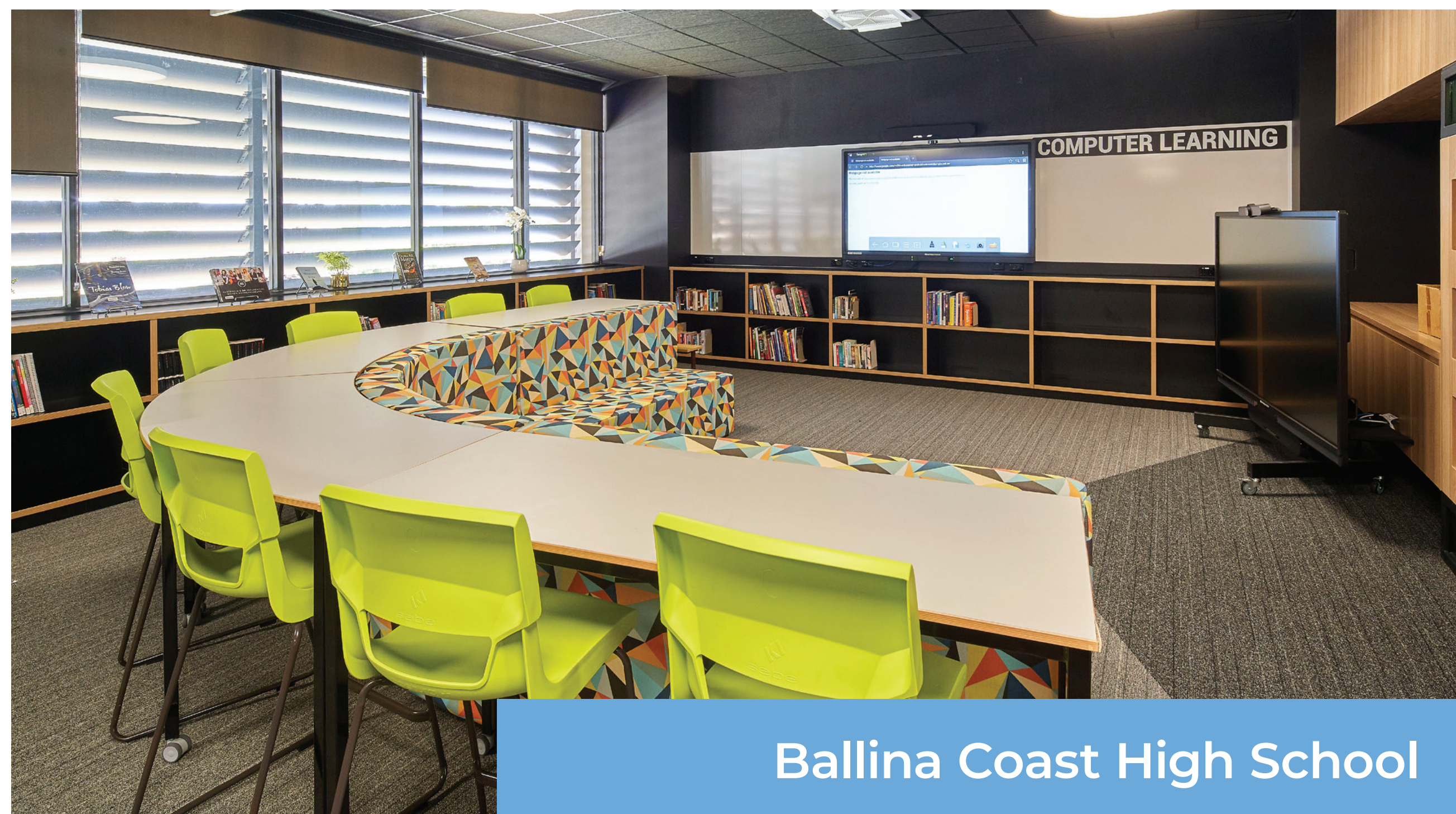
Ballina Coast High School