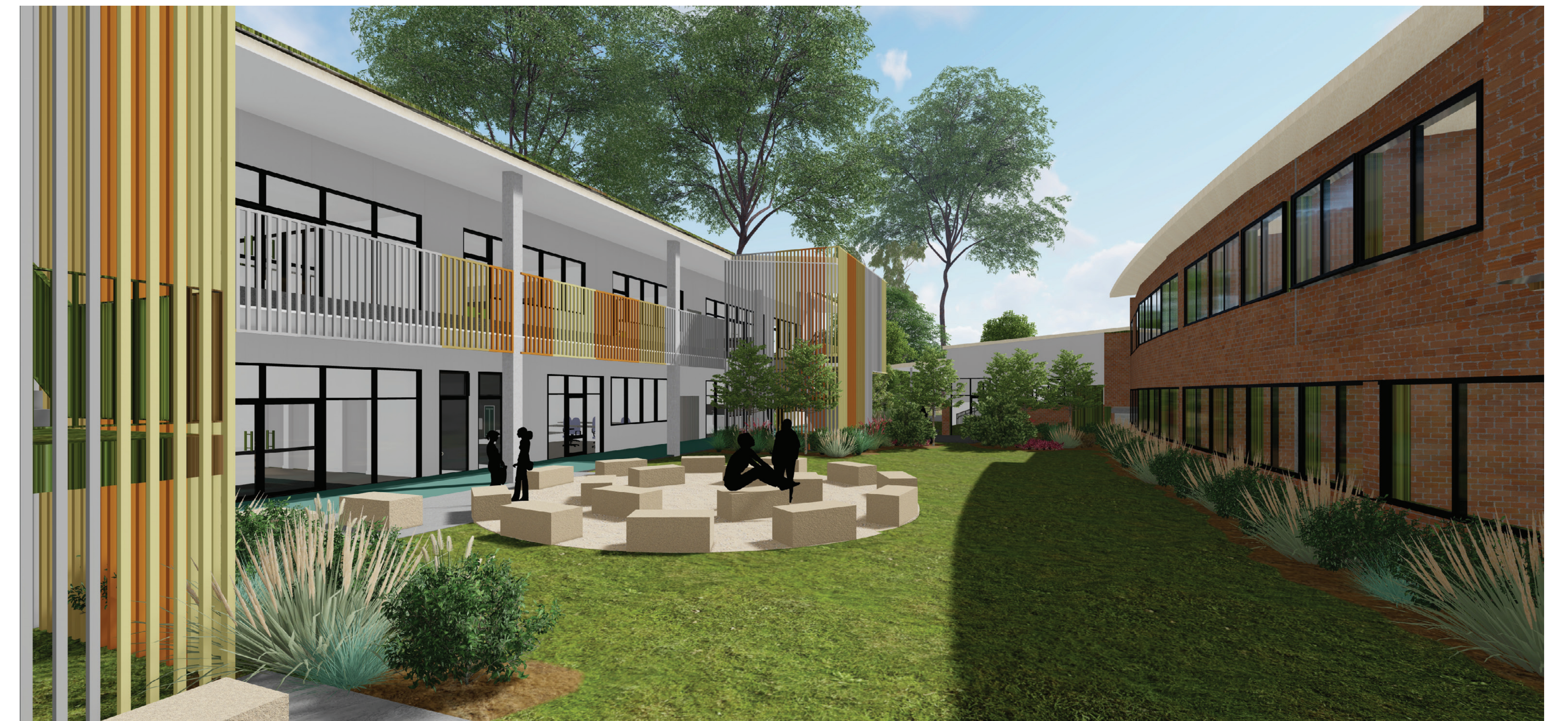
Artist impressions of Irrawang High School upgrade