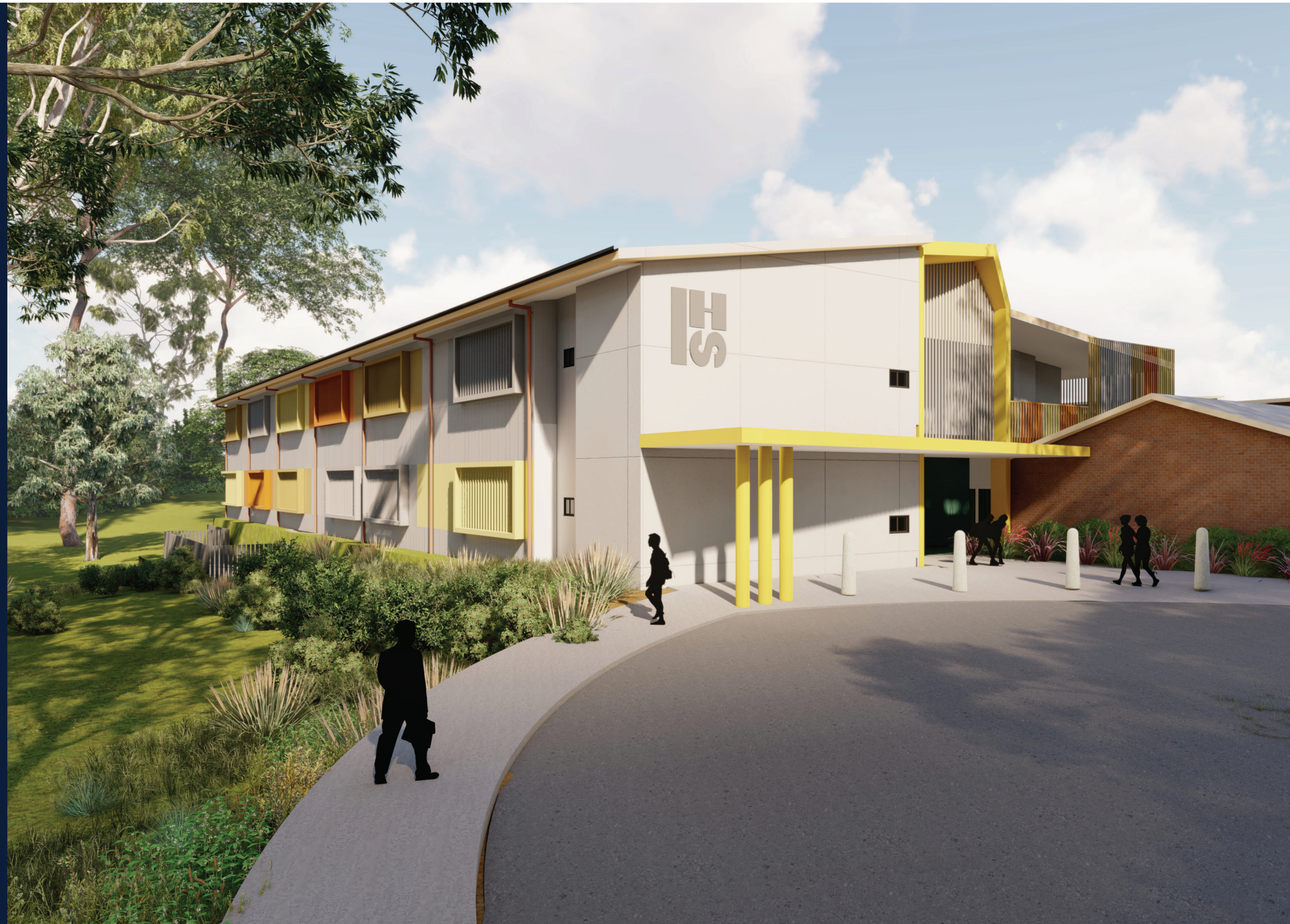
Artist impression of Irrawang High School new learning hub

New support student drop-off / pick-up area