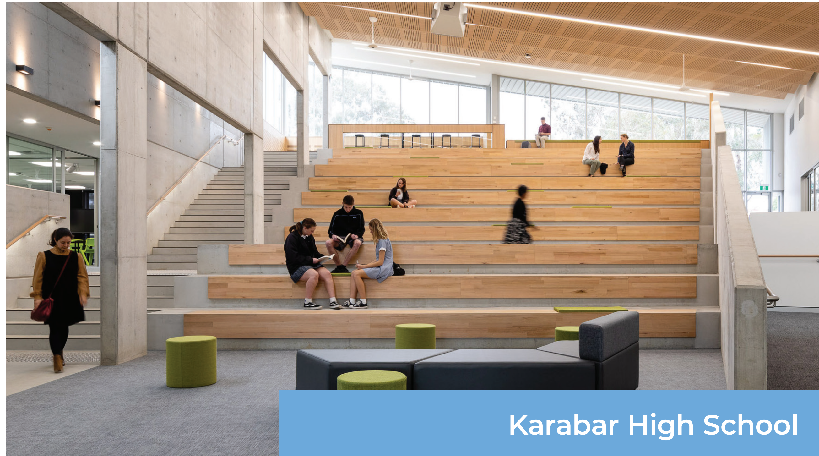
Karabar High School

These are some examples of contemporary learning environments for high school students across NSW.