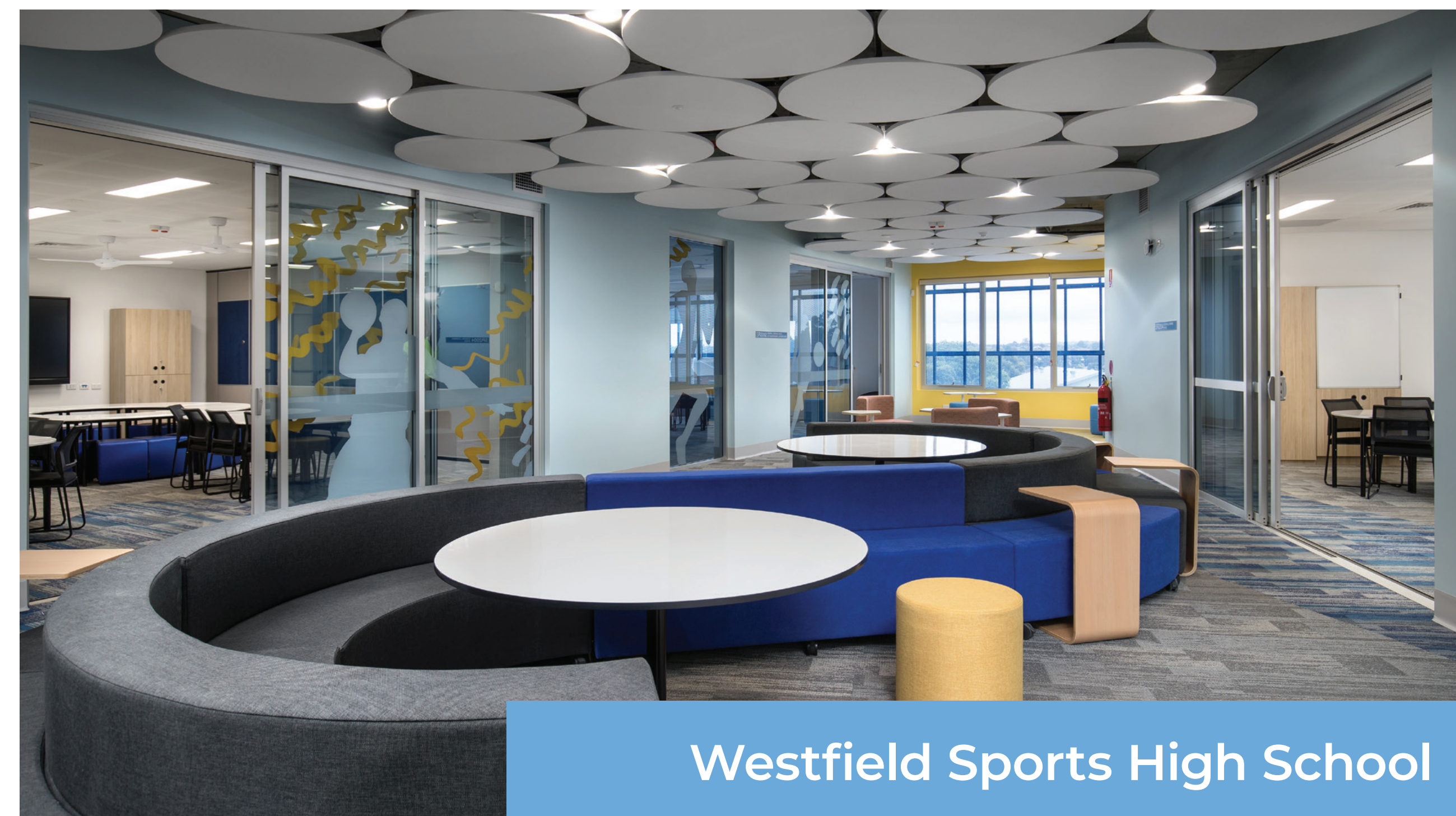
Westfield Sports High School