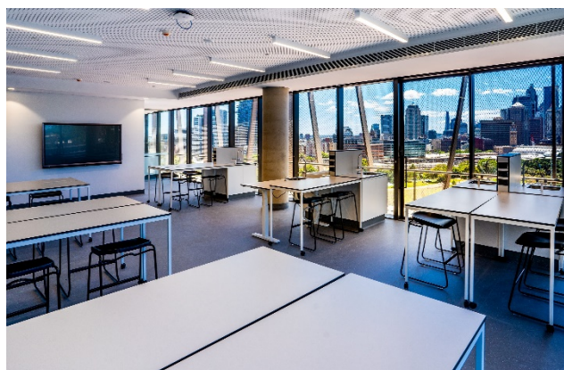
STEM focused facilities