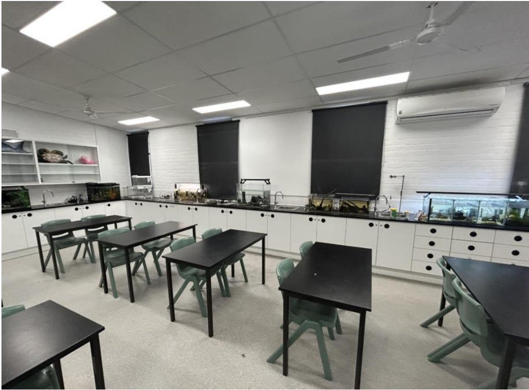
Image: upgraded science lab.