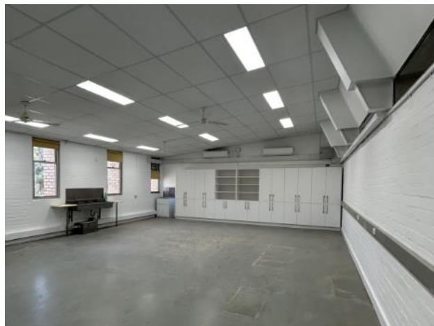
After: art room upgrade.