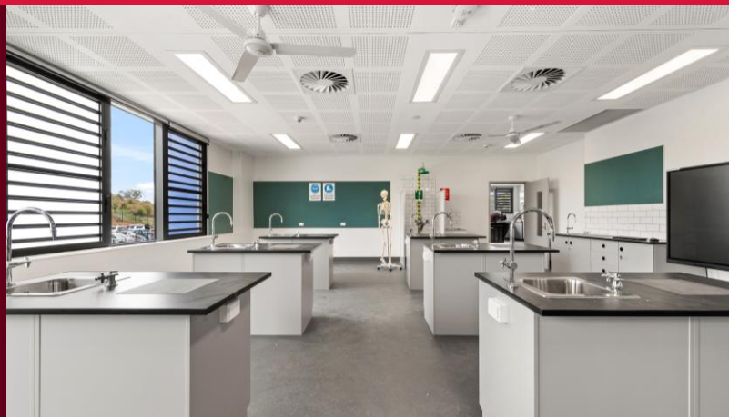
Image caption: Example of a science lab