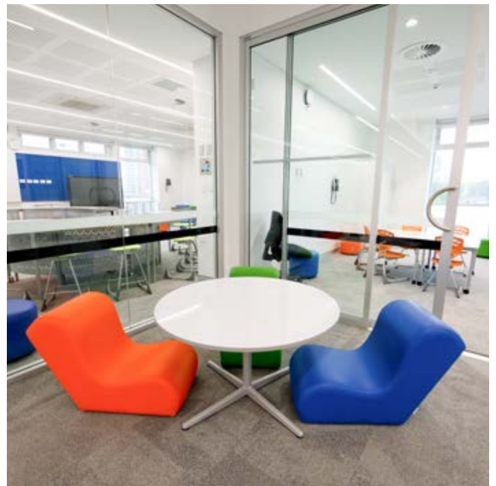
Hurstville Public School upgrade