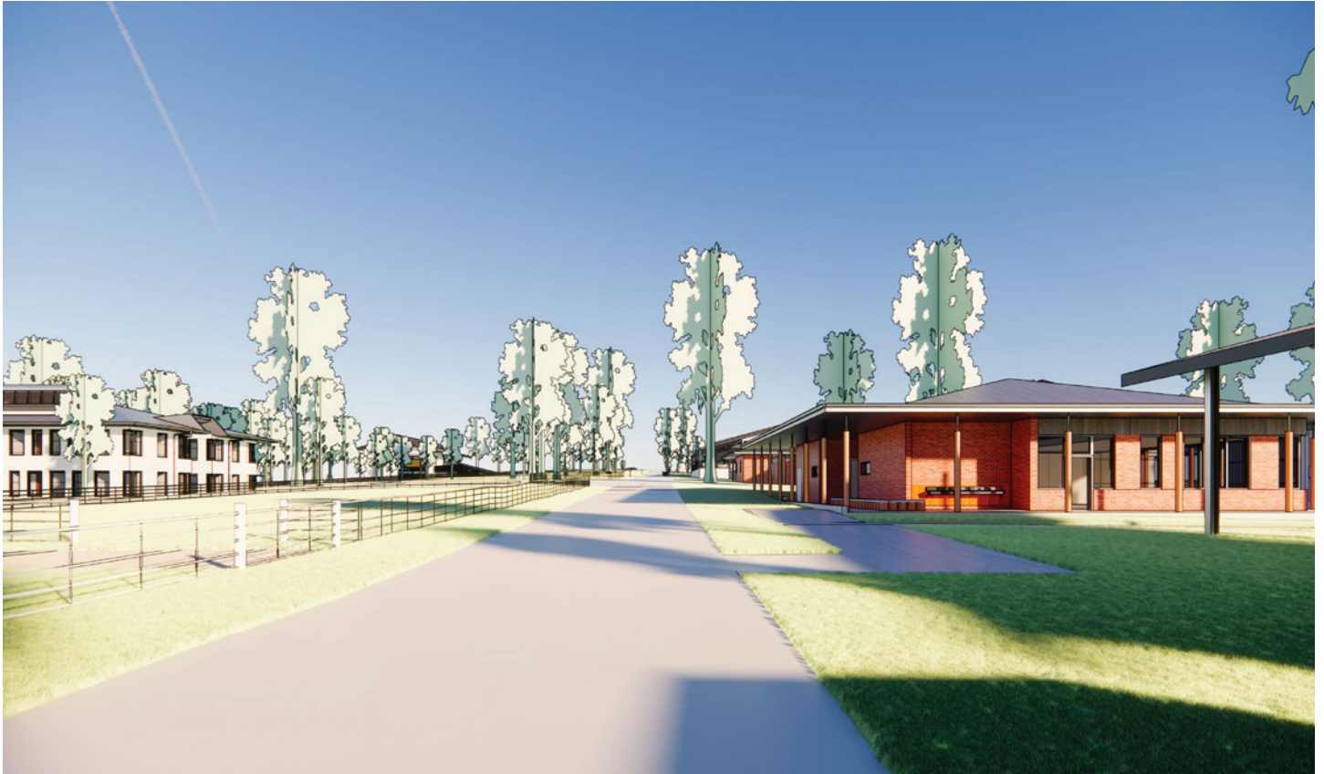
Concept design of the view west down Roy Watts Road, boarding facilities to the south and farm learning hub to the north

Once the detailed design has been completed, construction is expected to start in late 2022, pending planning approvals.