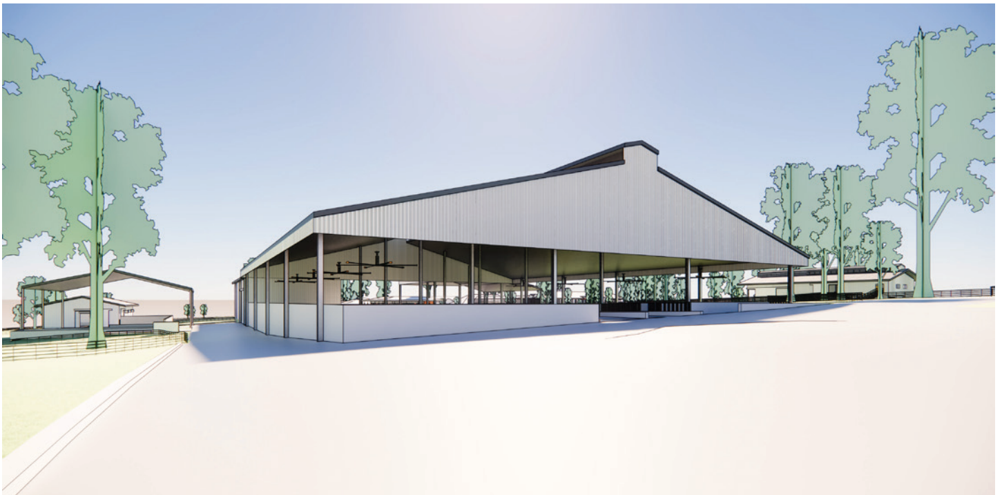
Concept design of the cattle barn