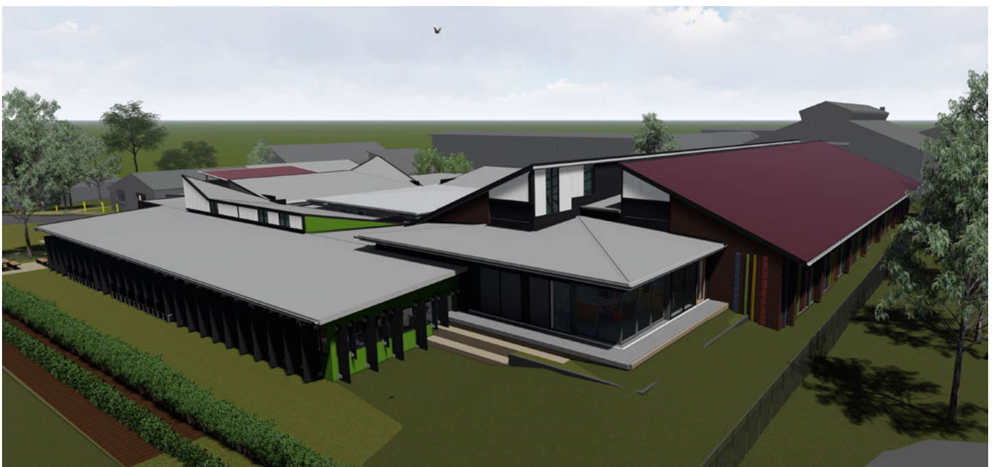
Artist impressions of the Hurlstone Agricultural High School upgrade in Glenfield

The Department of Planning is working with Property NSW and other government agencies to update the Glenfield Precinct Plan to include a strategy for redeveloping land surrounding Hurlstone Agricultural High School. This includes land reserved for a new primary school in Glenfield.