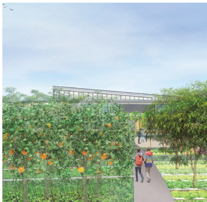
Artist impressions of the new Hurlstone Agricultural High School – Hawkesbury Campus