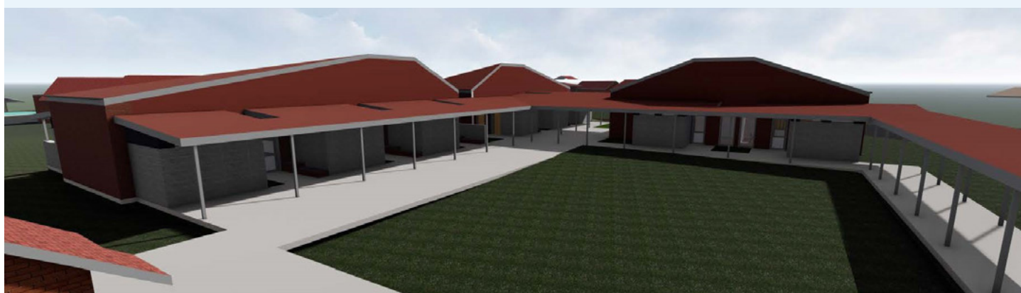
Artist impression of the Ajuga School upgrade in Glenfield