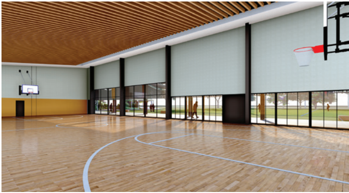
Artist impression of Hunter River High School gymnasium