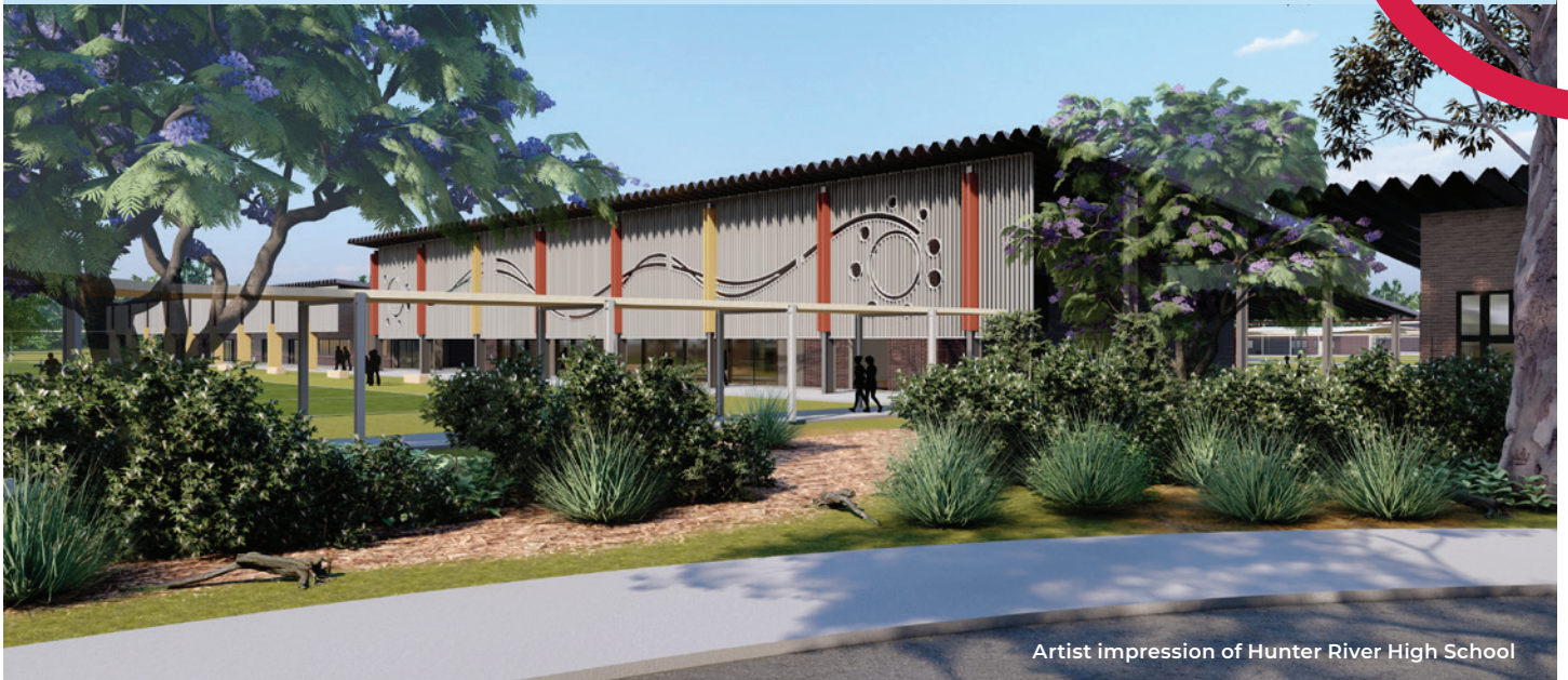
Artist impression of Hunter River High School