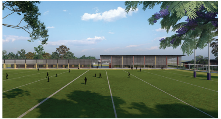
Artist impression of sports field with learning hub and gymnasium