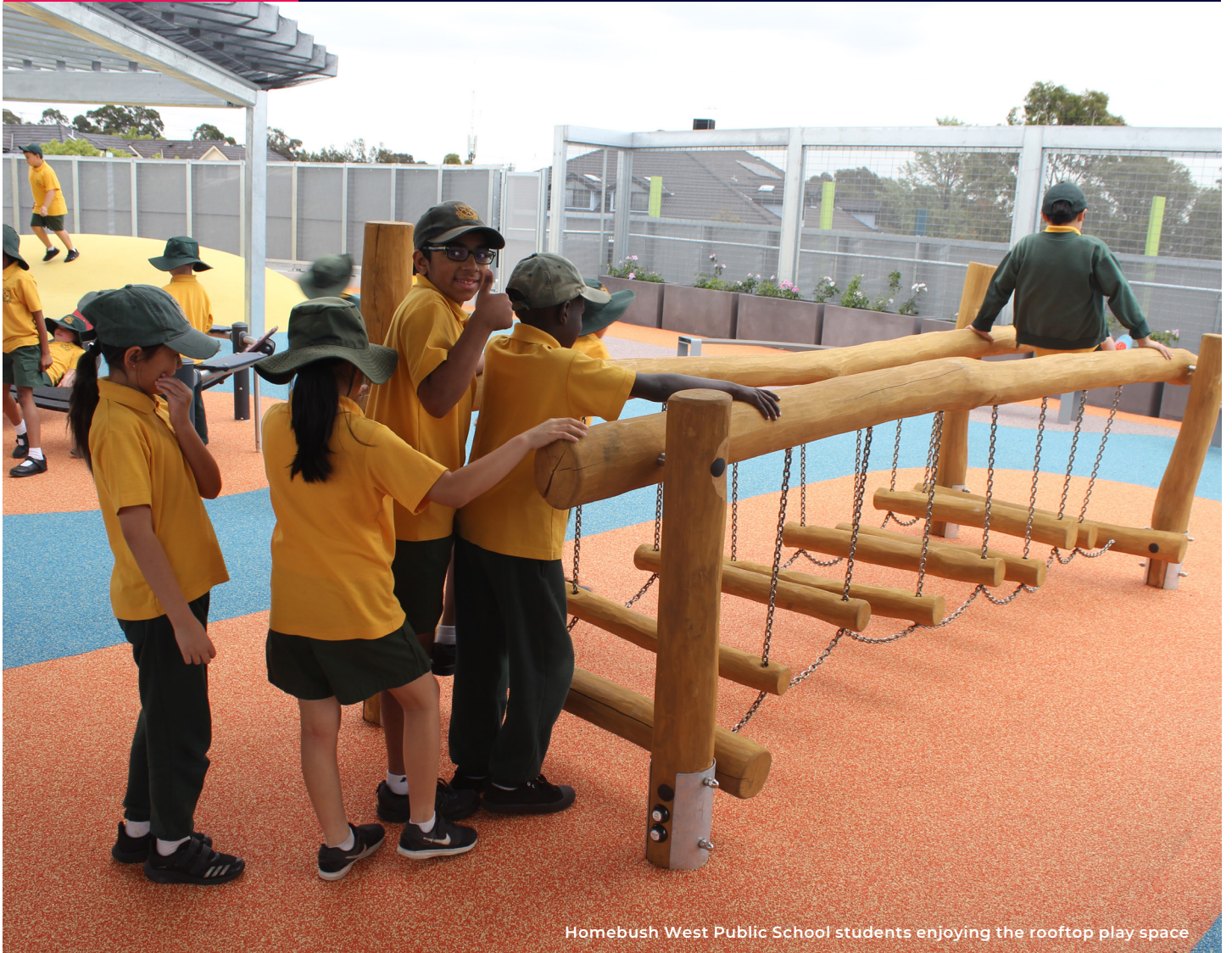
Homebush West Public School students enjoying the rooftop play space