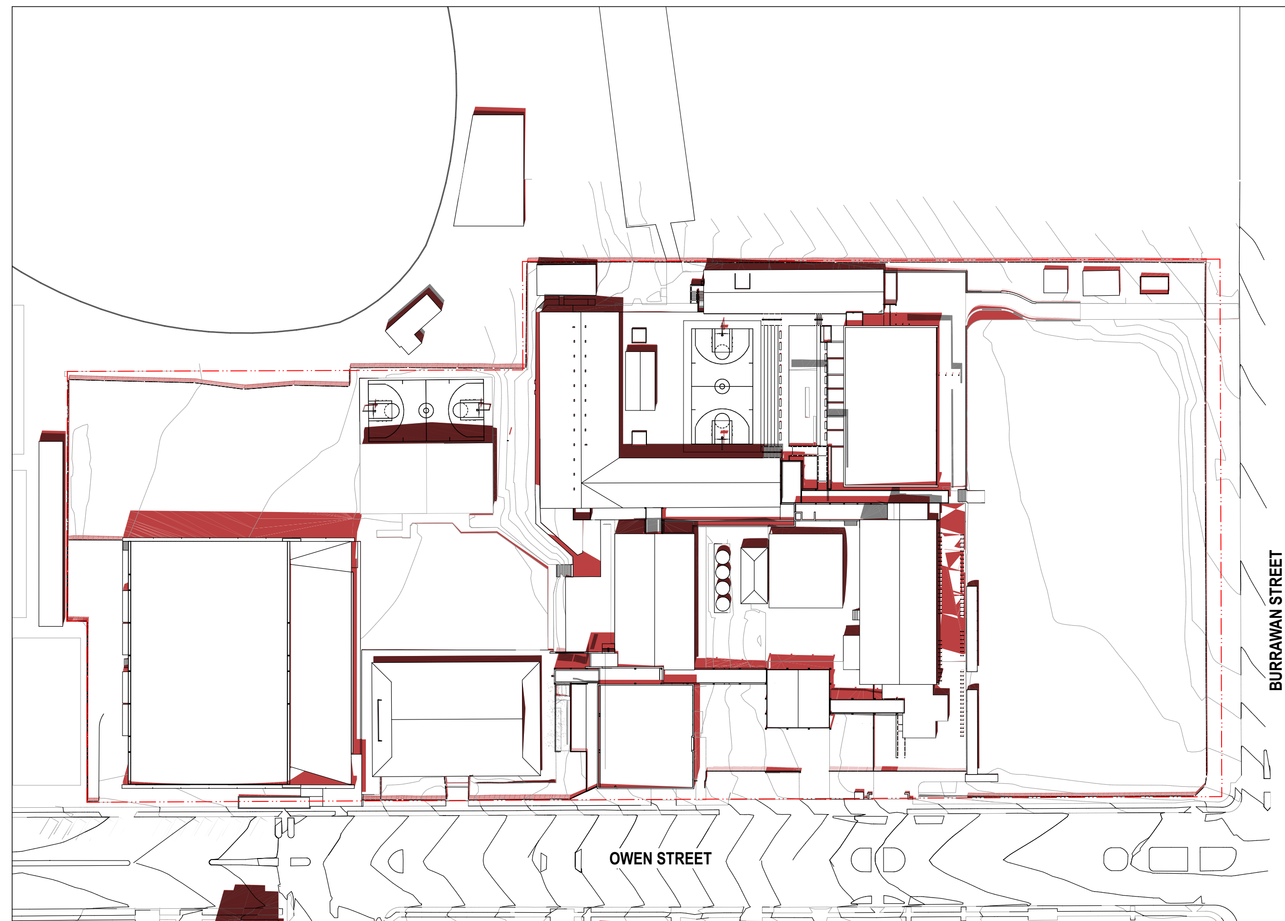
02 3D VIEW Shadow Diagram - December 21 2pm NTS