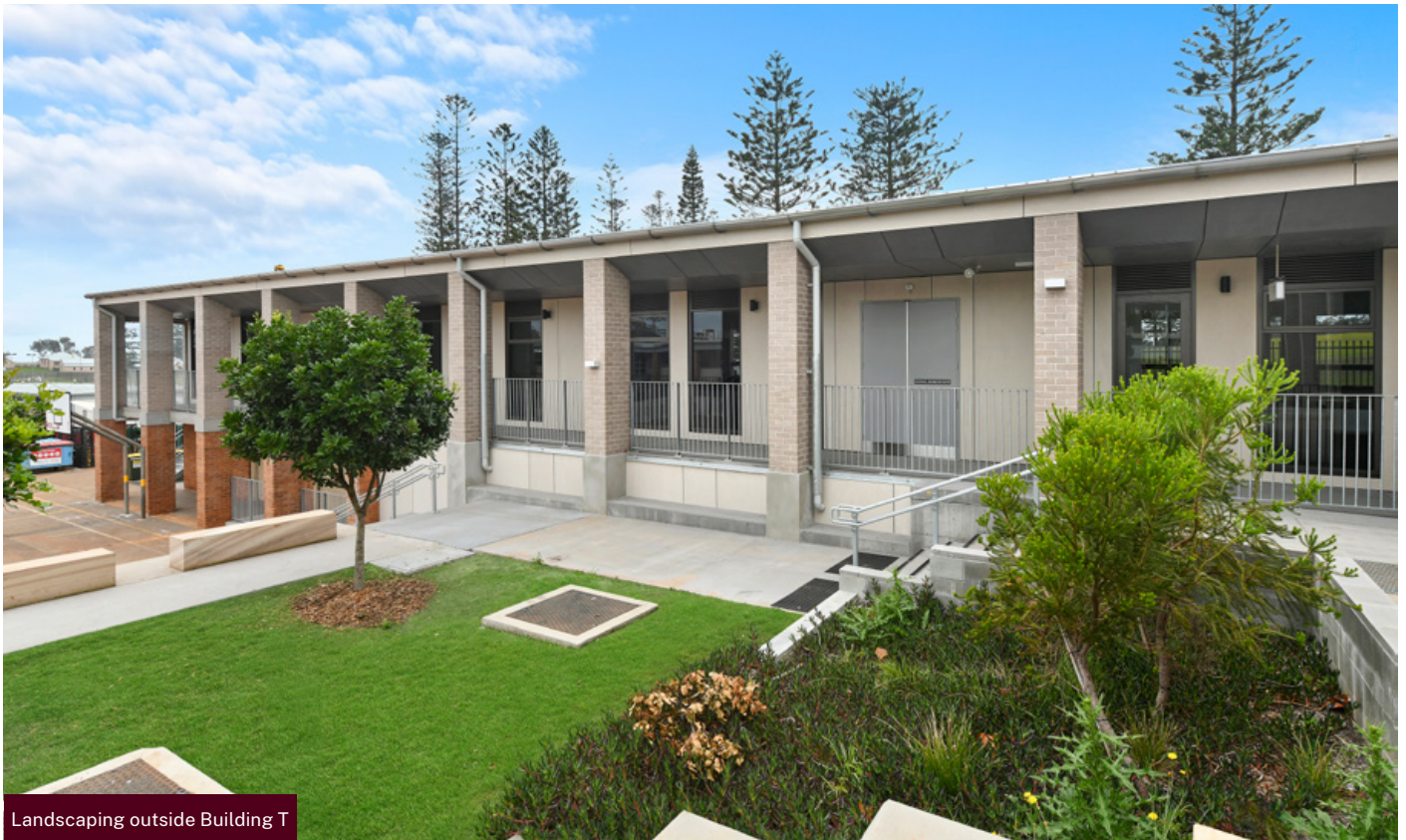
Landscaping outside Building T