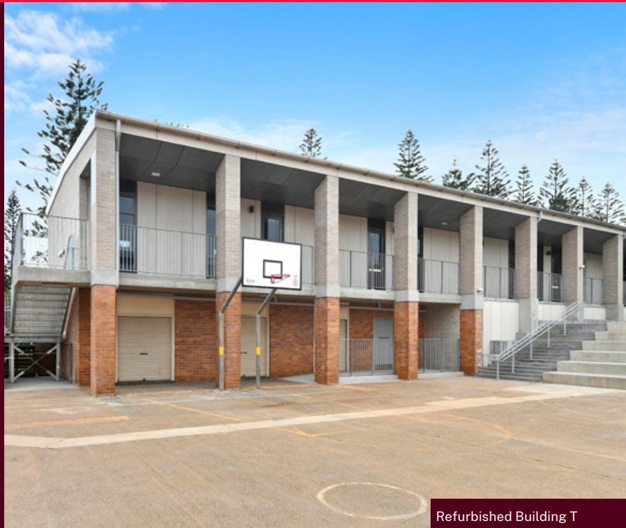
Refurbished Building T