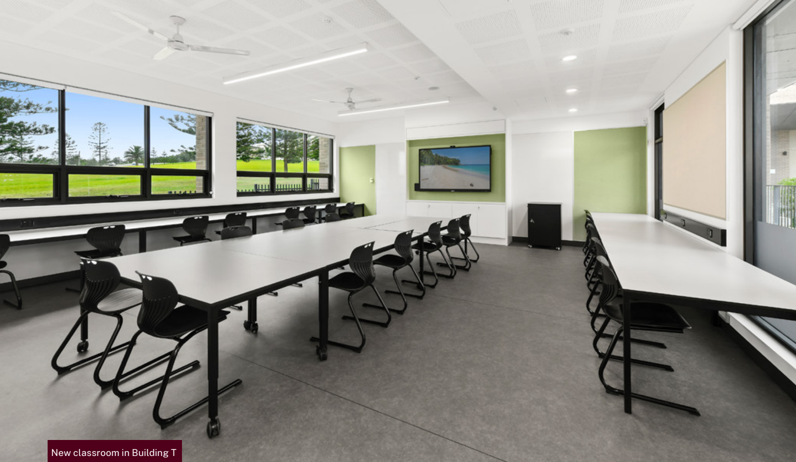
New classroom in Building T