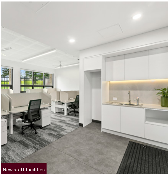
New staff facilities