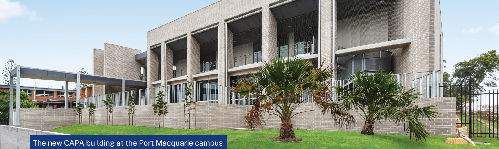
The new CAPA building at the Port Macquarie campus