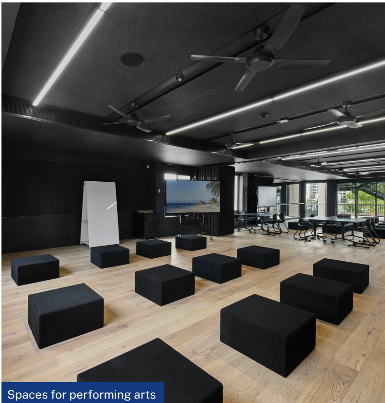
Spaces for performing arts