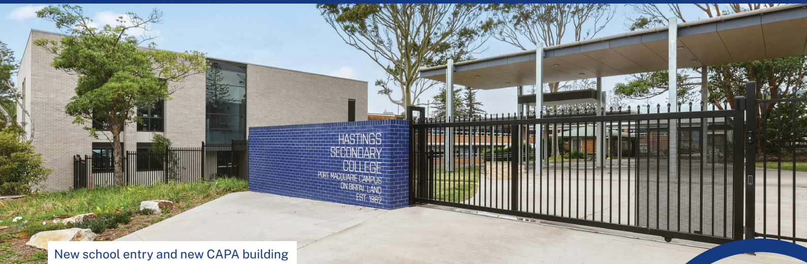
New school entry and new CAPA building