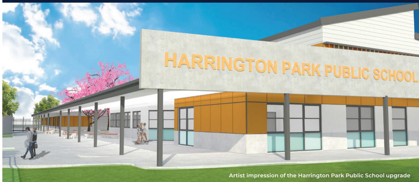
Artist impression of the Harrington Park Public School upgrade

The NSW Government is investing $6.7 billion over four years to deliver more than 190 new and upgraded schools to support communities across NSW. This is the largest investment in public education infrastructure in the history of NSW.