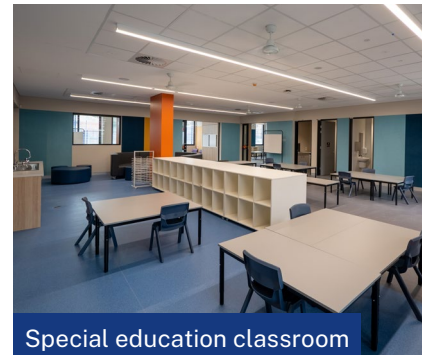
Special education classroom