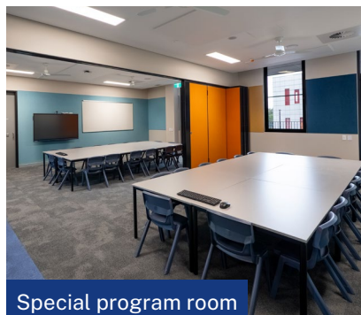
Special program room