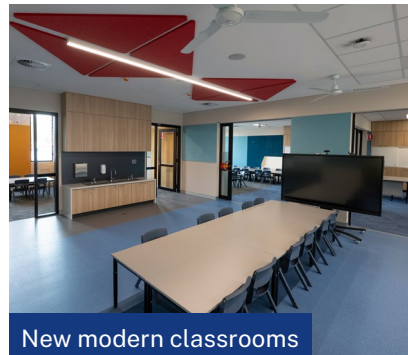
New modern classrooms