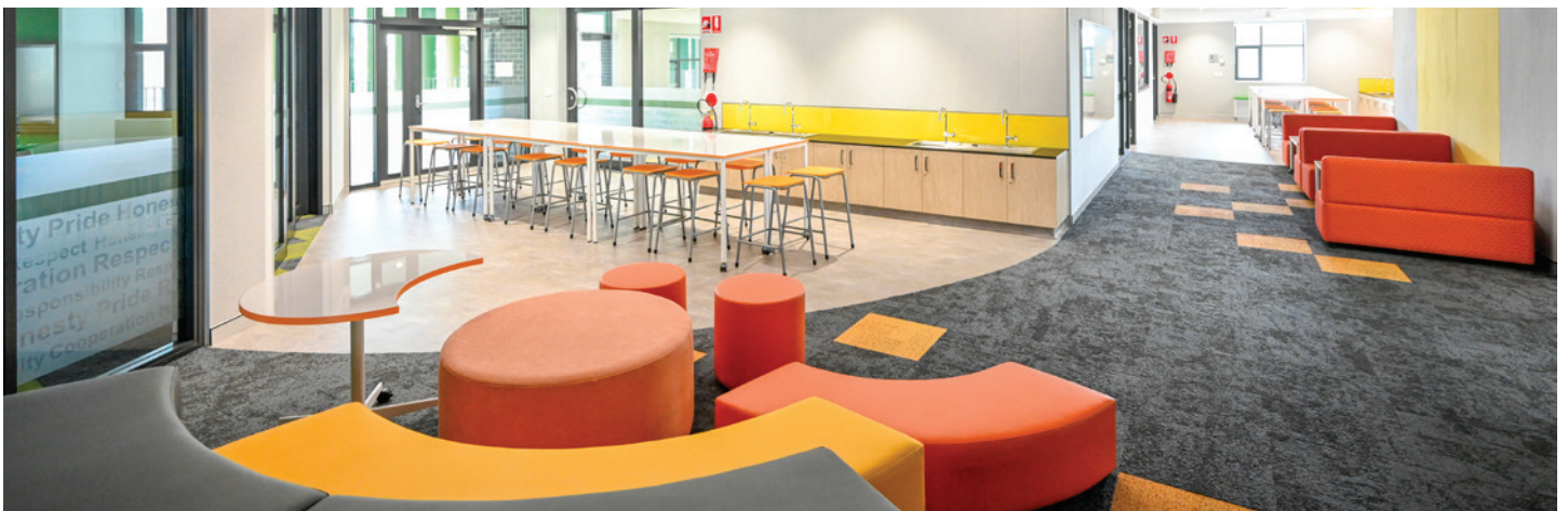
Learning space in new Building M South