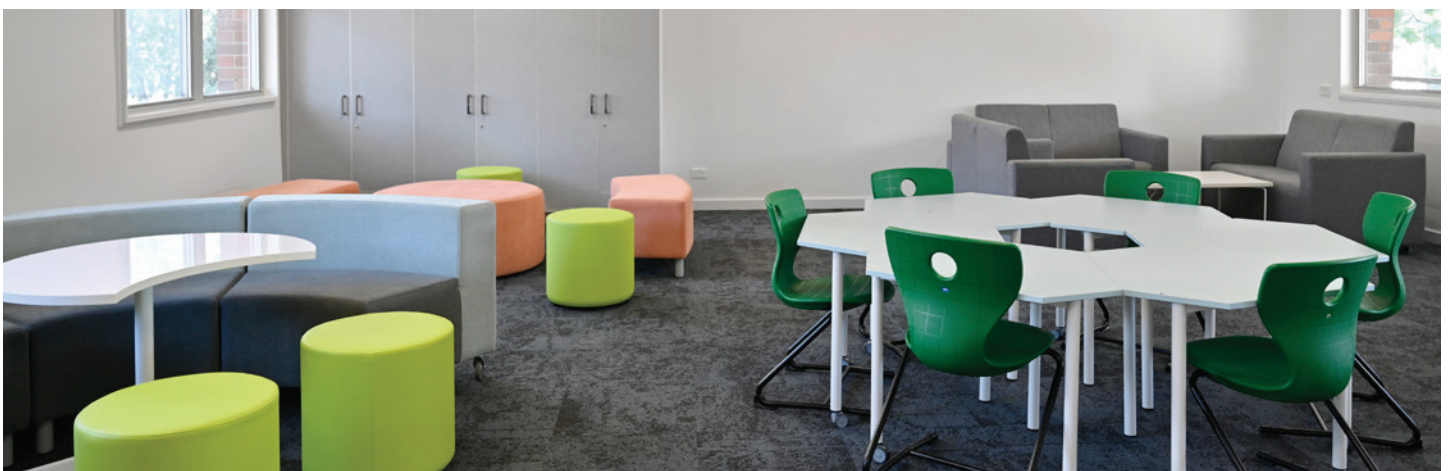
Multipurpose learning space in the refurbished Building A