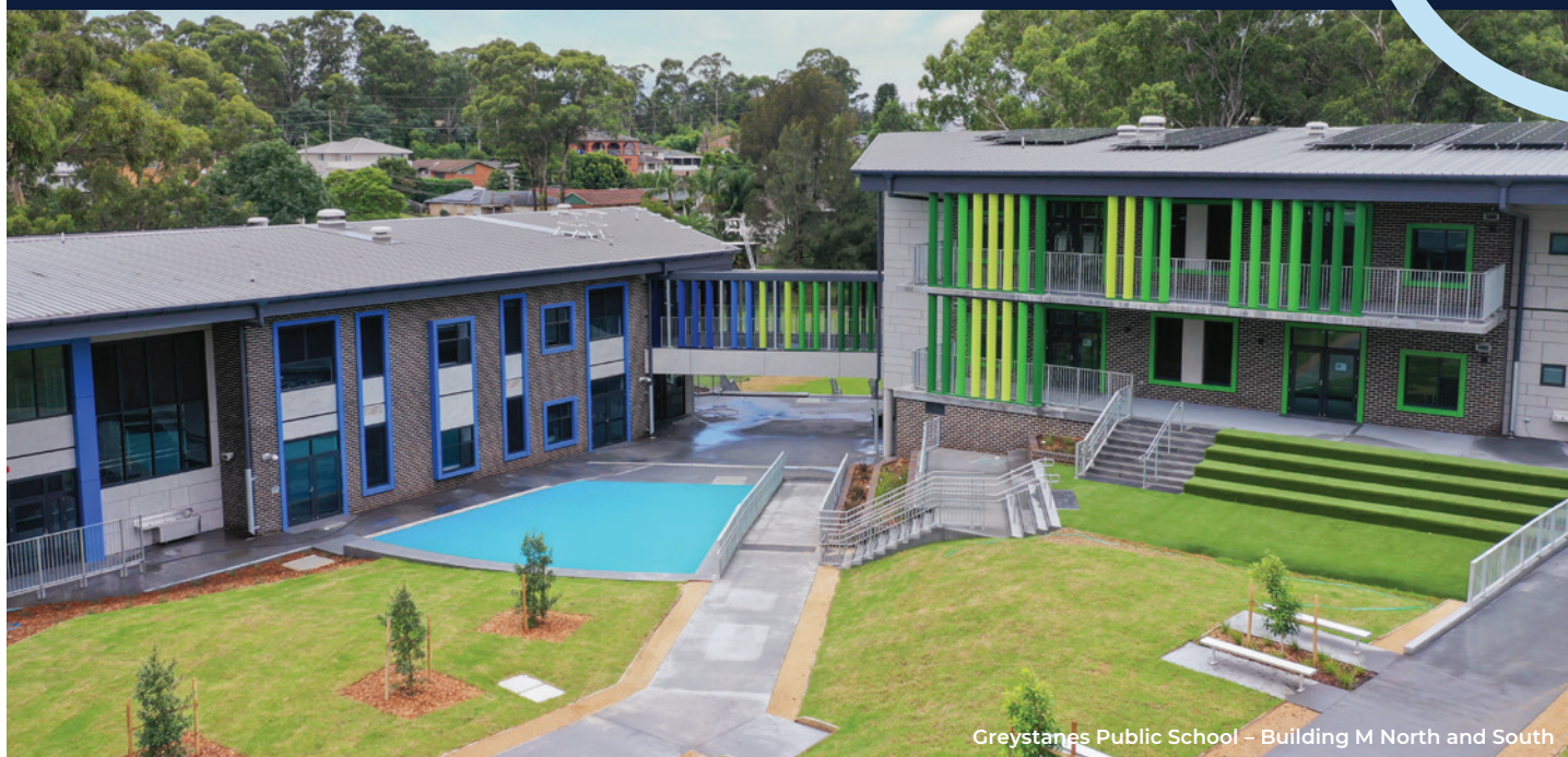
Greystanes Public School – Building M North and South