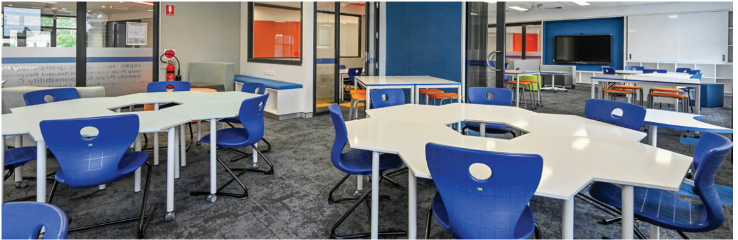
Learning space in new Building M North