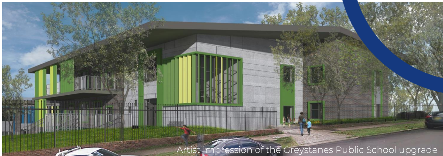
Artist impression of the Greystanes Public School upgrade